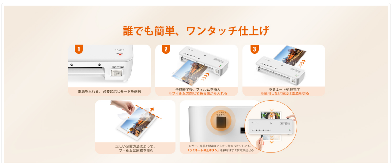
Figure 5: Guidance on proper film insertion: always insert the sealed edge first to prevent jams and ensure smooth lamination.