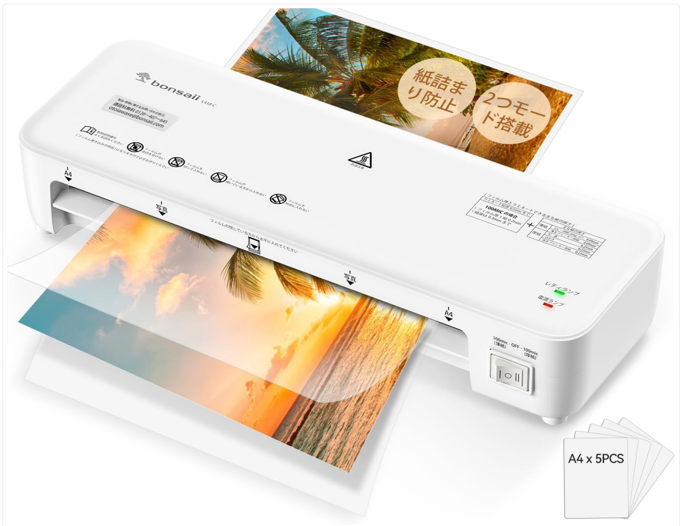
Figure 1: The bonsai L418-C A4 Laminator in operation, showcasing its compact design and ease of use.