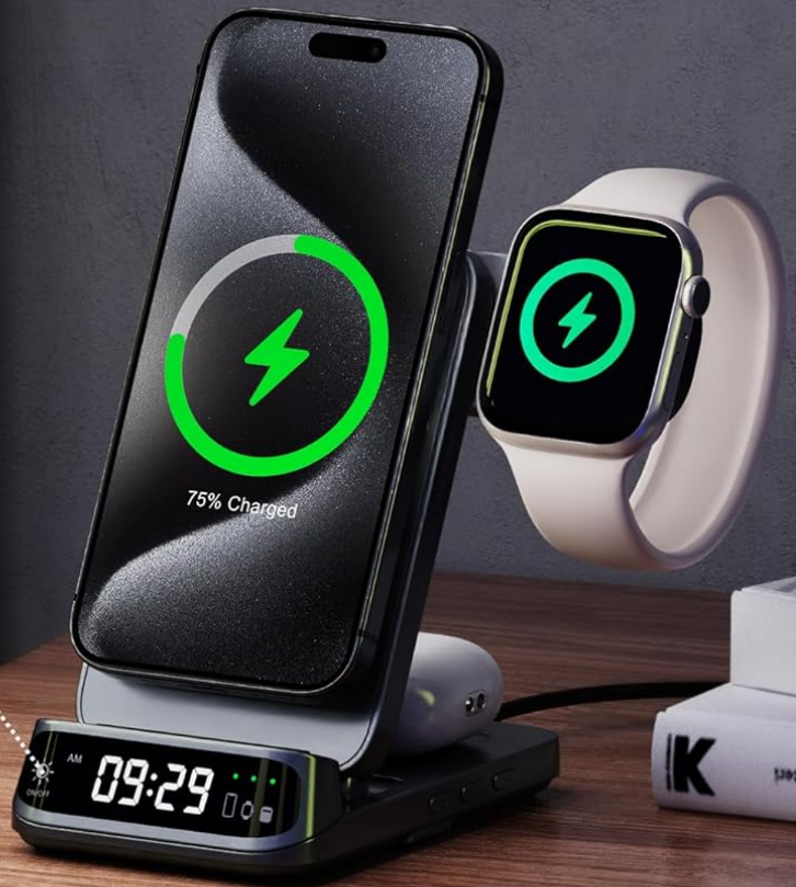
Image: The SwanScout 708M demonstrating its strong magnetic force, securely holding an iPhone in place for charging.