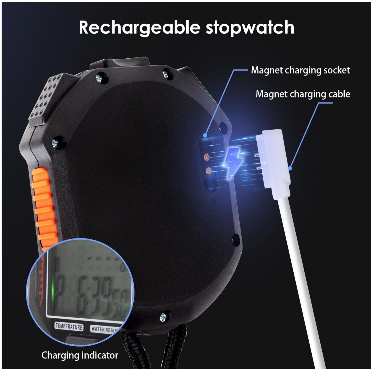
Figure 4.1: The stopwatch connected to its magnetic charging cable.

Before first use, fully charge the stopwatch. Connect the magnetic charging cable to the charging socket on the side of the stopwatch and the USB end to a power source (e.g., computer USB port, USB wall adapter). The charging indicator on the display will show charging status.