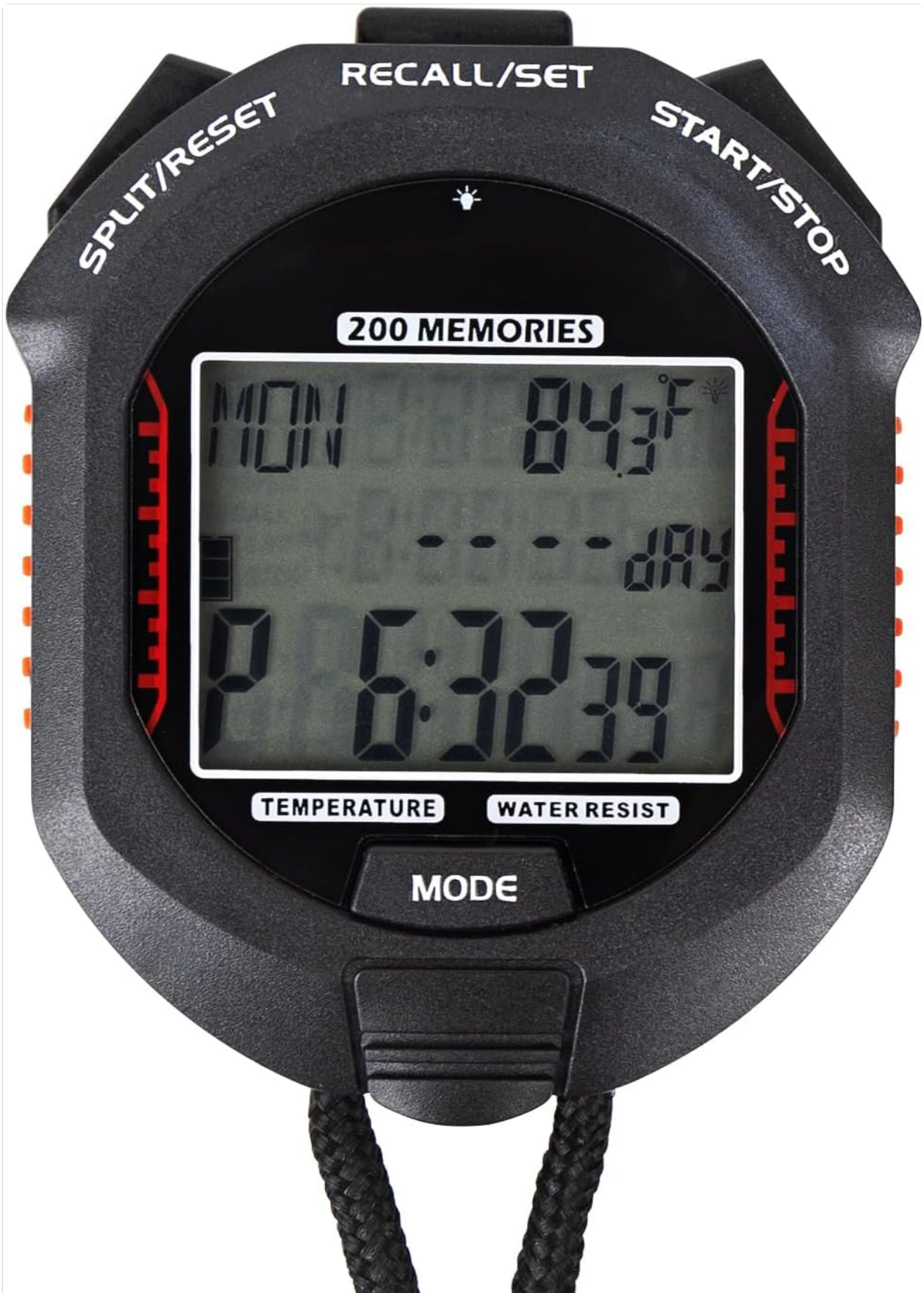
Figure 3.1: Detailed view of the stopwatch display and labeled buttons.