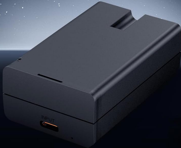
1 x Lithium Battery for Z1/Z2/Z2PRO/Z3/Z3R/Z760/Z880 Flash Speedlite