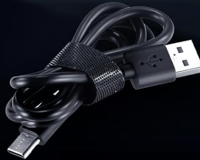
1 x Type C Charging Cable