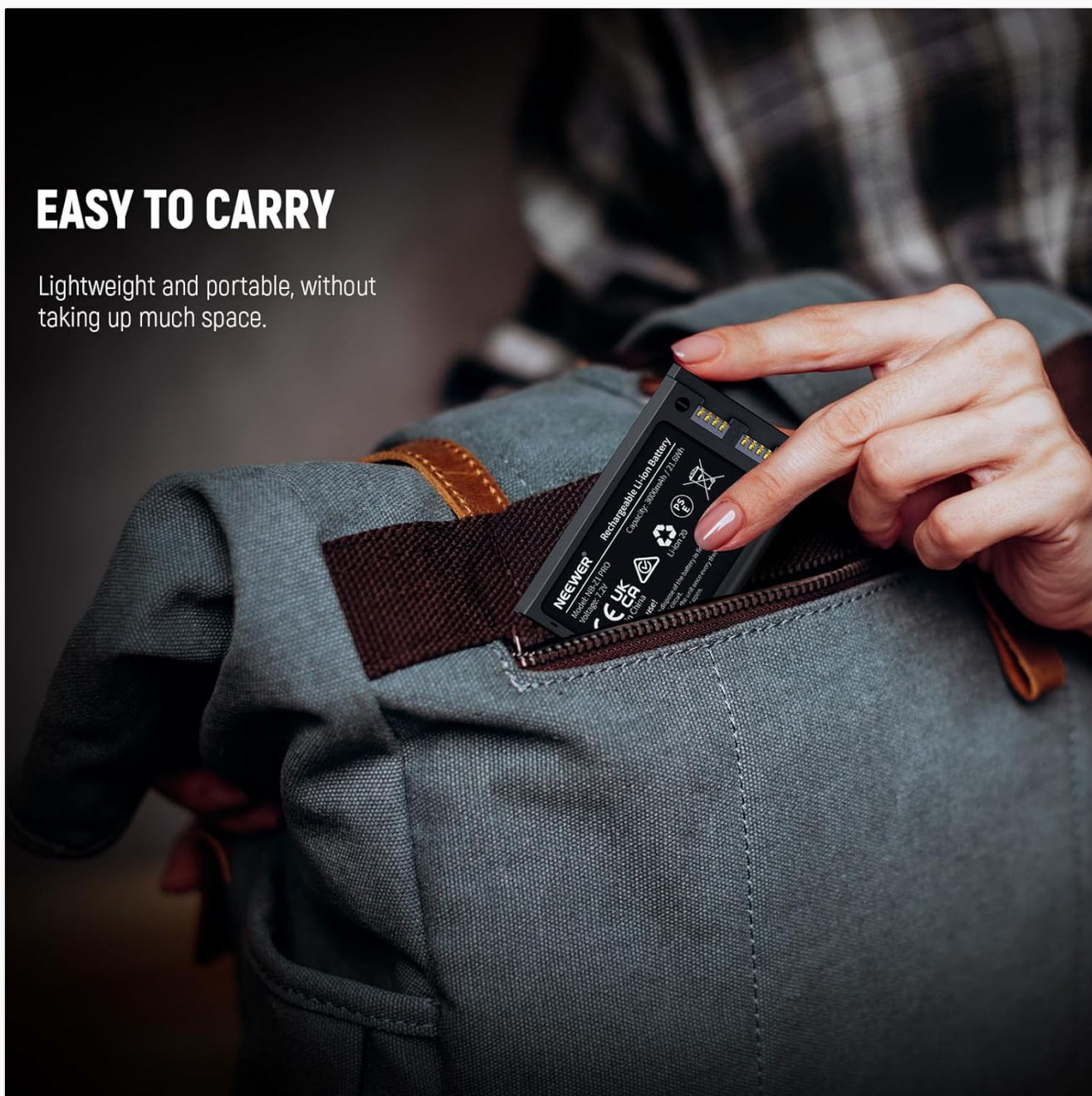
Image: A hand demonstrating the ease of carrying the lightweight and portable Neewer NB-Z1 PRO battery, fitting it into a small bag compartment.

Lightweight and portable, without taking up much space.