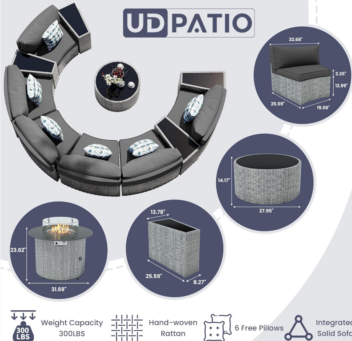
Image 8.1: Detailed dimensions and features of the UDPATIO patio set components.