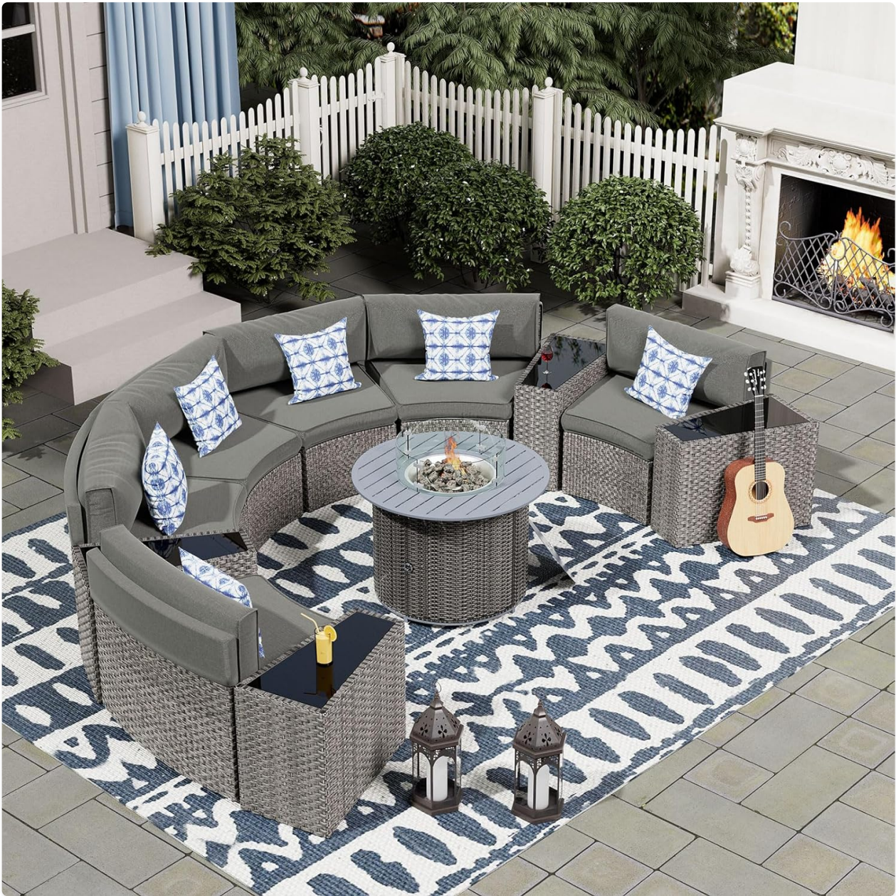
Image 6.1: The hand-woven PE rattan is 30% thicker than standard, offering enhanced durability and resistance to outdoor elements.