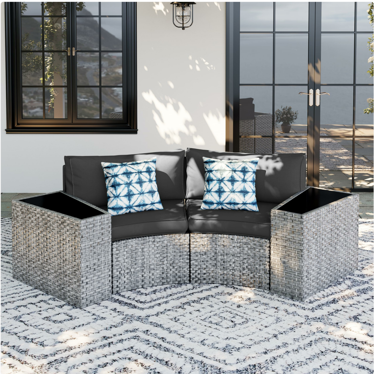
Image 1.1: The UDPATIO Modern Half-Moon Curved Patio Set (4 Piece) with side tables.