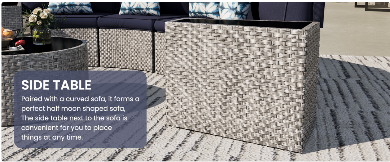
Image 5.3: The side table offers a practical surface for various items.