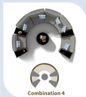
Image 4.3: The modular design allows for various flexible combinations to suit your space.