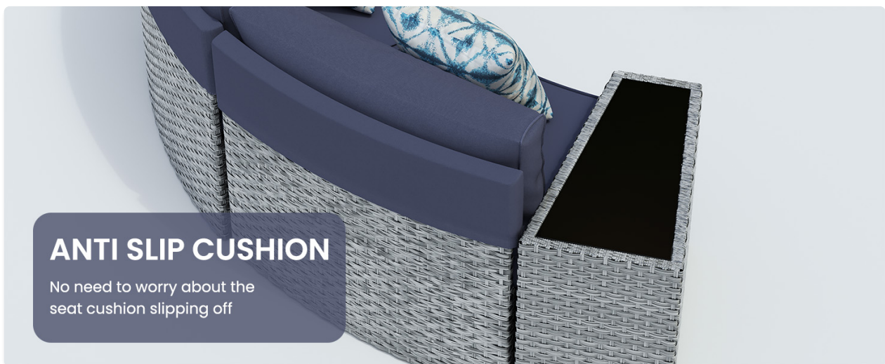
Image 5.2: Cushions feature anti-slip properties to prevent movement during use.