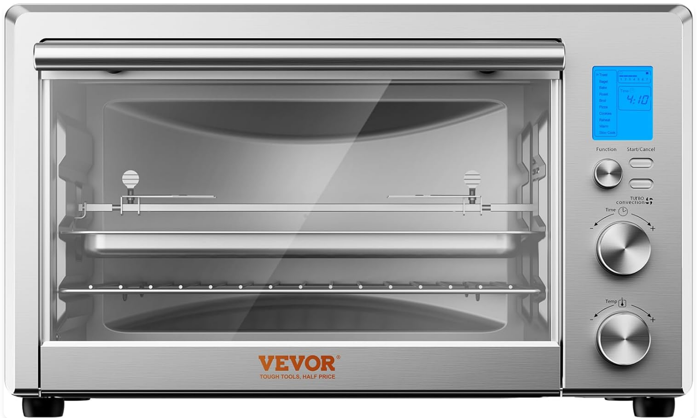
Front view of the VEVOR Convection Toaster Oven, showcasing its sleek silver design and digital display.