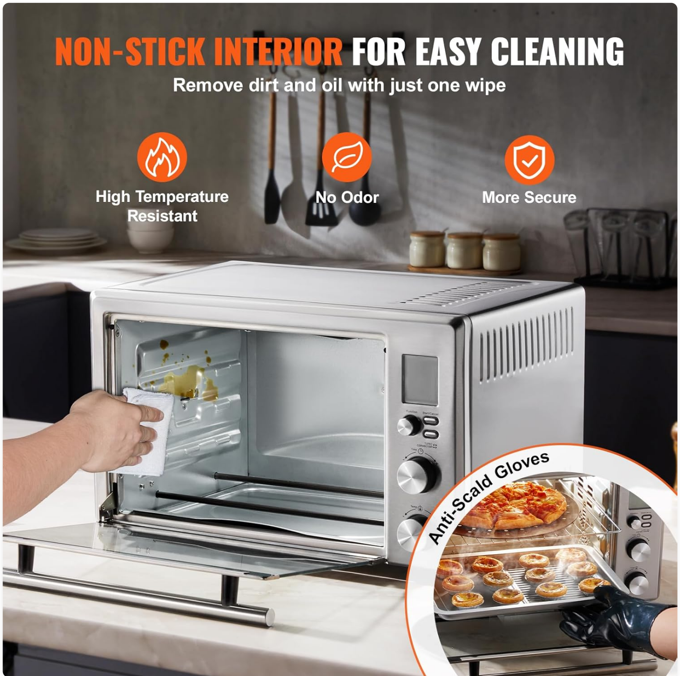
Demonstration of cleaning the non-stick interior for easy maintenance.