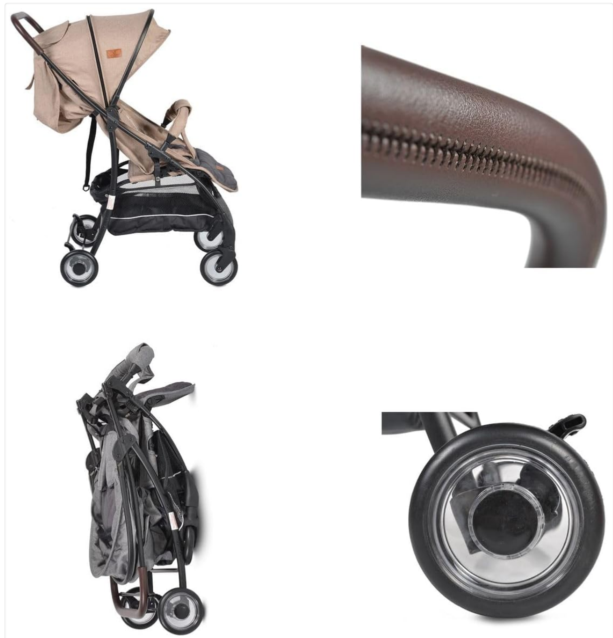
Figure 2: Various configurations of the Cangaroo London Buggy, demonstrating its adjustable backrest and compact folding capability.

Ensure the backrest is in an upright position and the canopy is retracted. Locate the folding mechanism (often a button or lever on the handle or frame). Activate the mechanism and push the handle forward or pull it upwards, following the buggy's natural folding motion until it locks into a compact position.