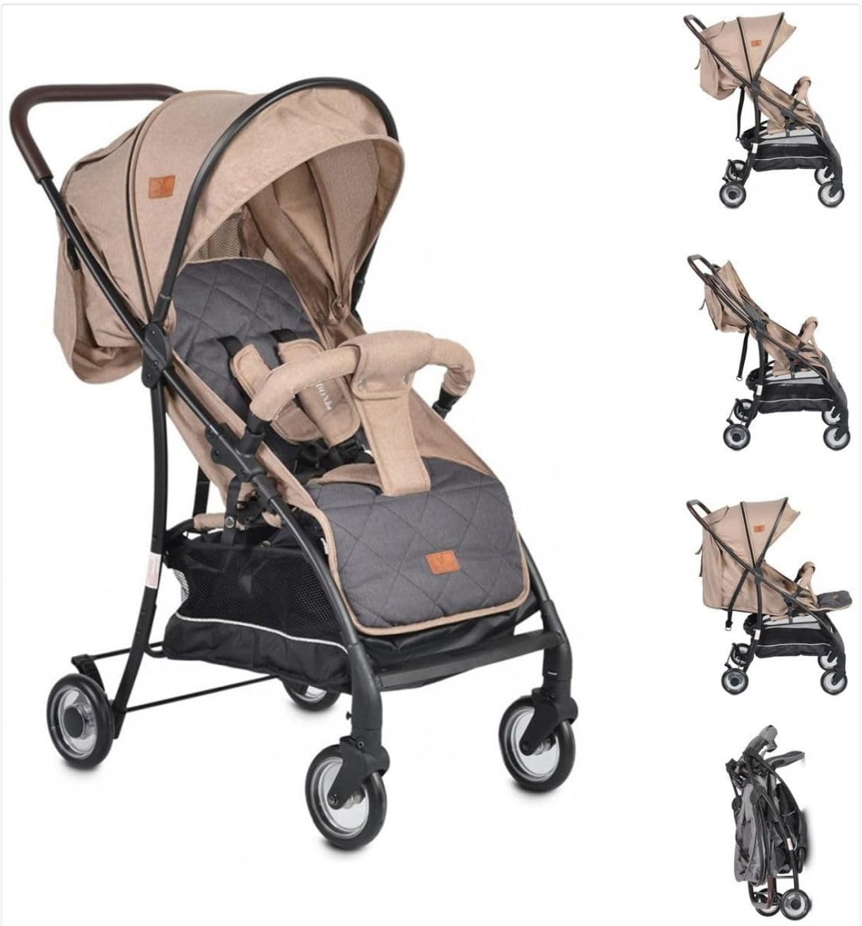
Figure 1: Fully assembled Cangaroo London Buggy. This image shows the buggy in its upright position with the canopy extended, ready for use.