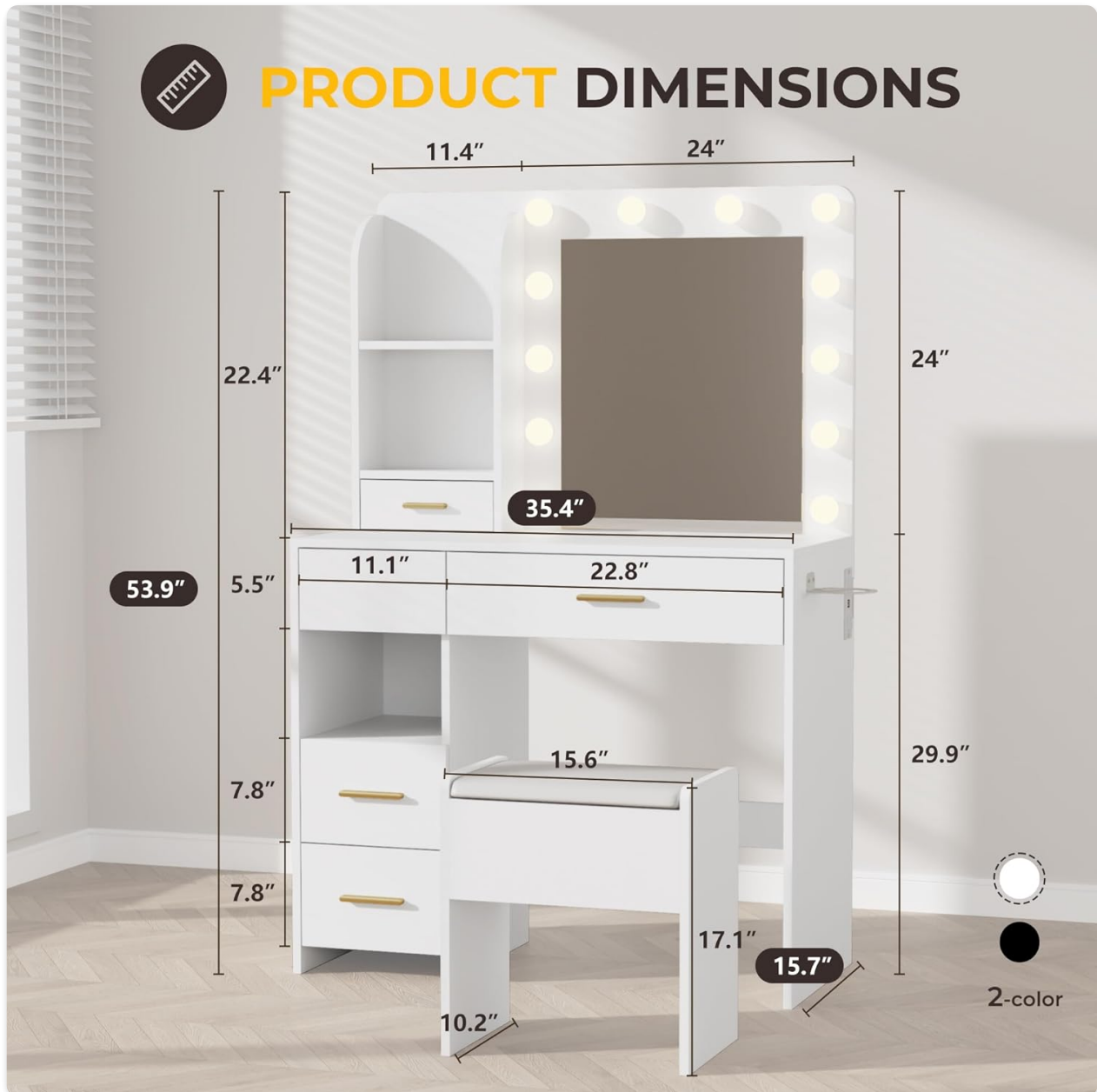
Figure 4.1: Product dimensions for planning placement and assembly.