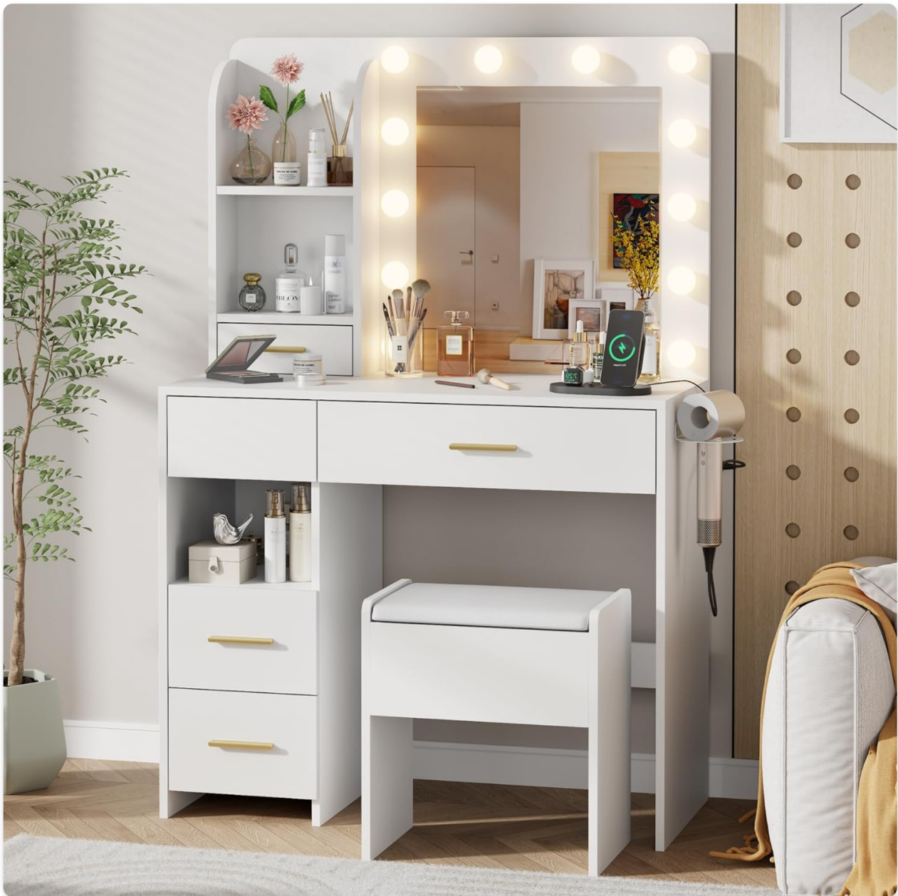
Figure 2.1: The Otterease Vanity Desk, Model SZT08, in a bedroom setting, showcasing its mirror, storage, and included stool.