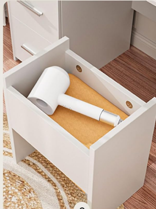
Desktop drawer & metal handle