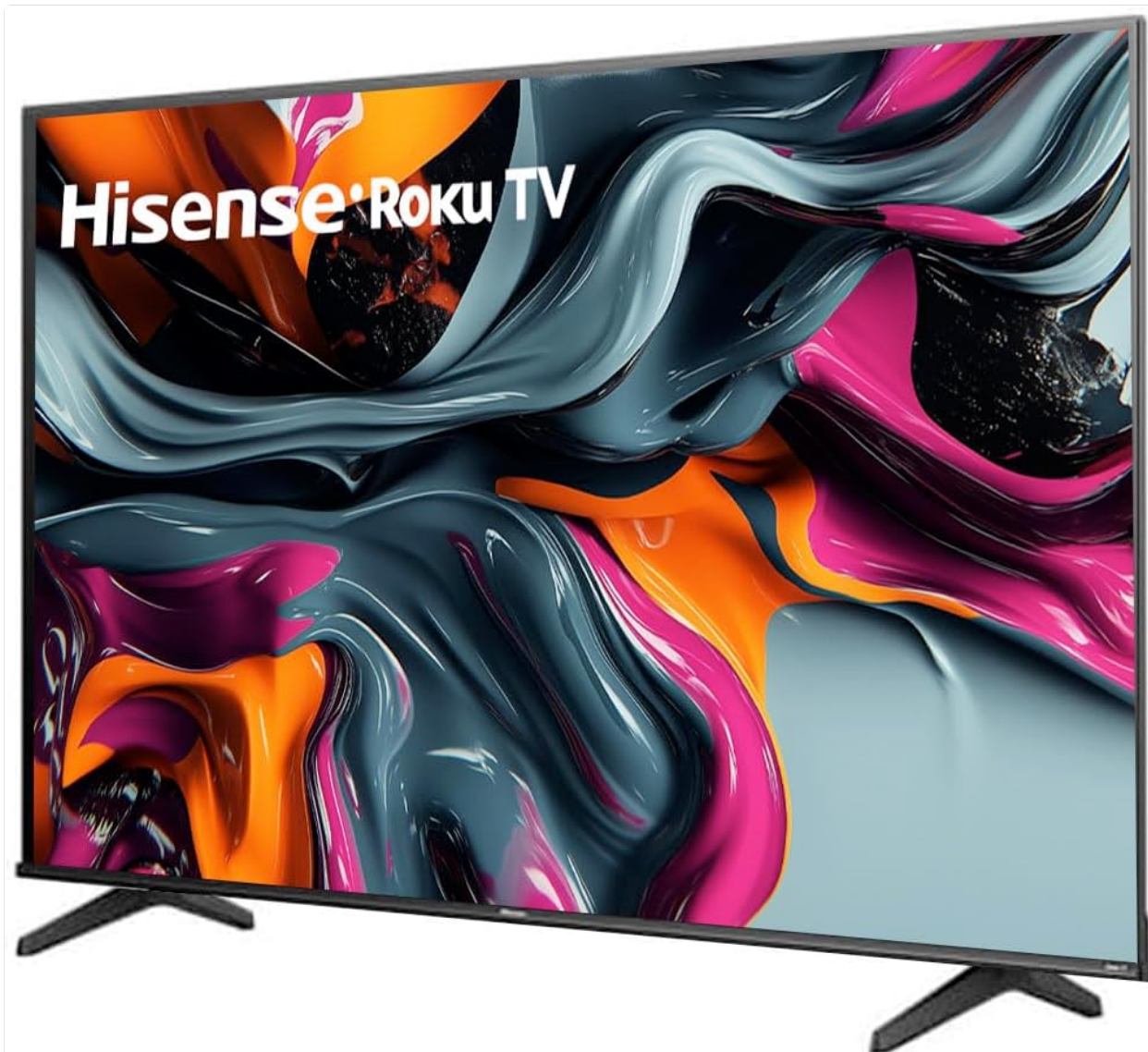
Figure 2.1: Illustration of TV stand attachment.