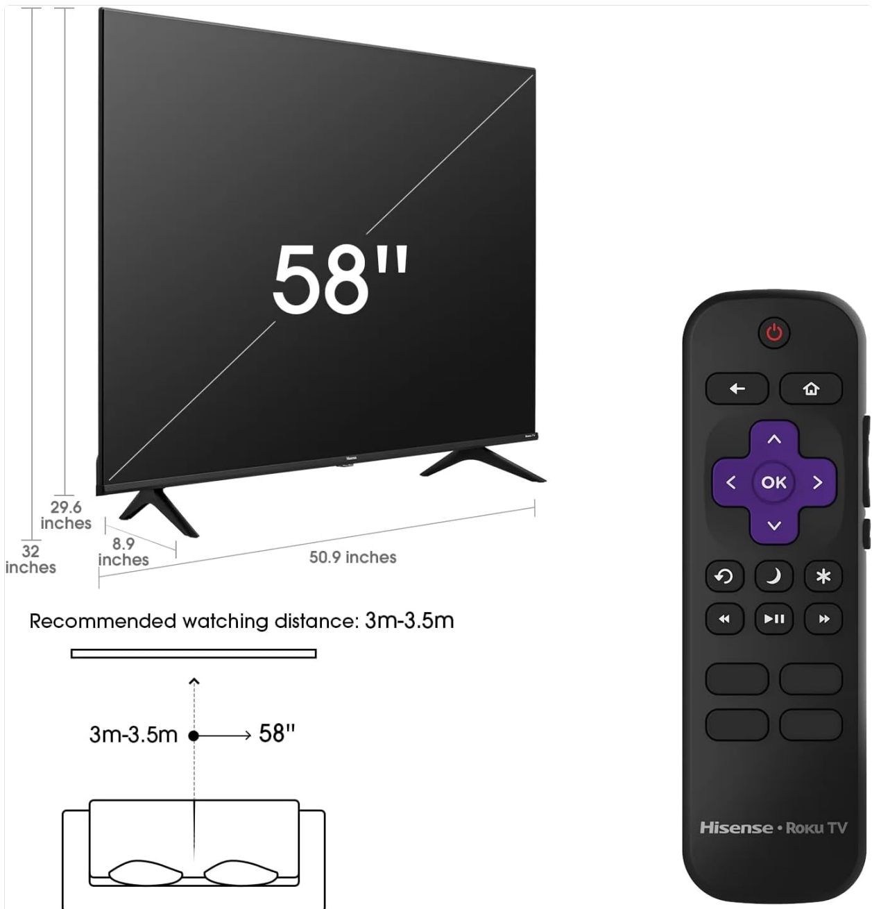
Figure 3.1: Hisense Roku TV Remote Control.