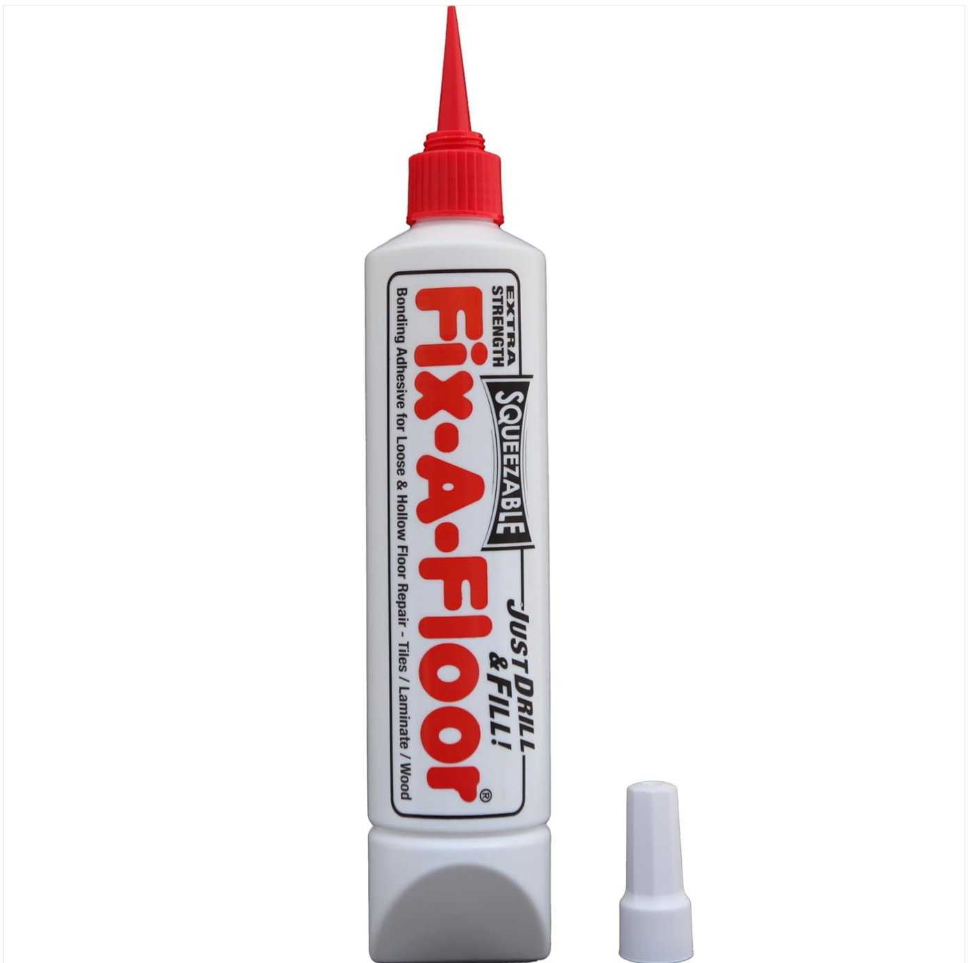
Image: The Fix-A-Floor Squeezy All-in-One Repair Adhesive bottle with its precision tip and cap.