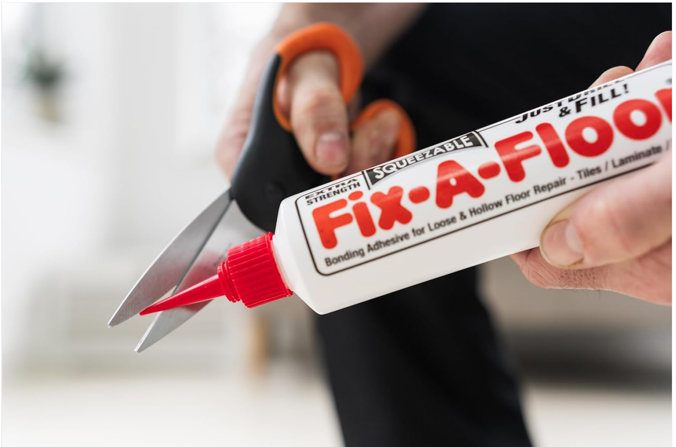
Image: Scissors being used to trim the precision tip of the adhesive bottle to the desired size.