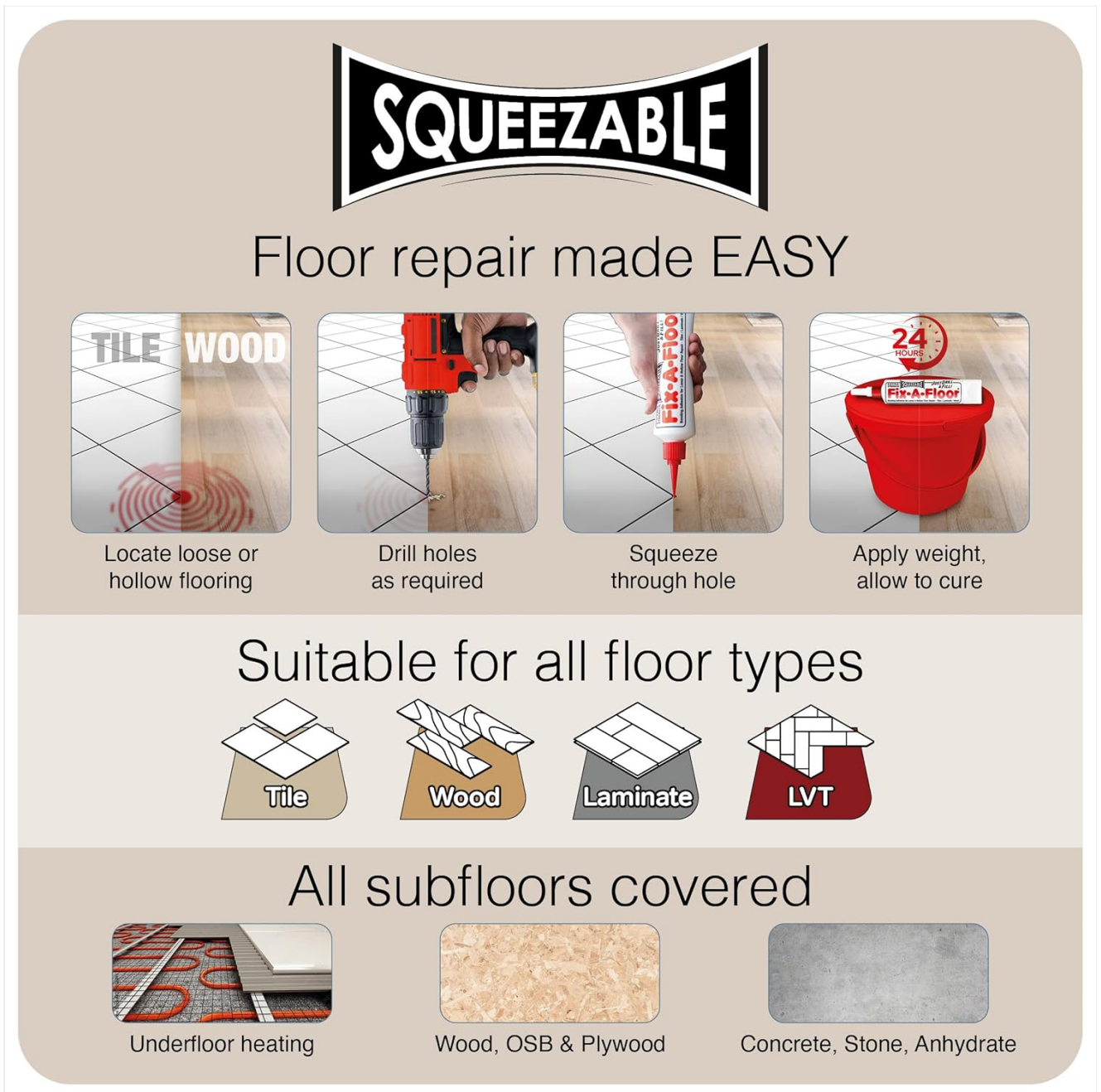
Image: A hand squeezing the Fix-A-Floor adhesive into a gap in the flooring.