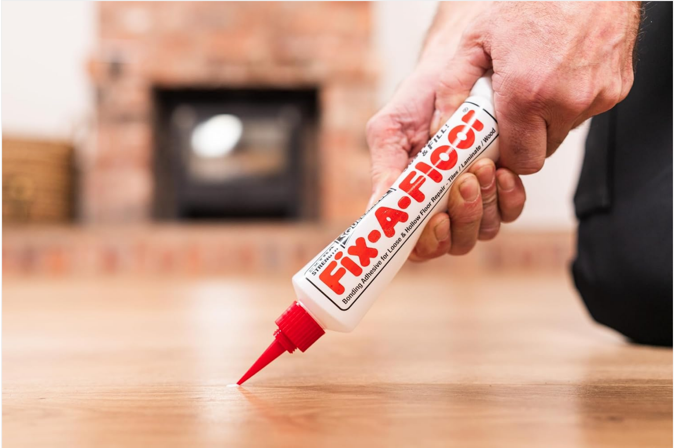
Image: A person indicating a loose or hollow area on a tiled floor.