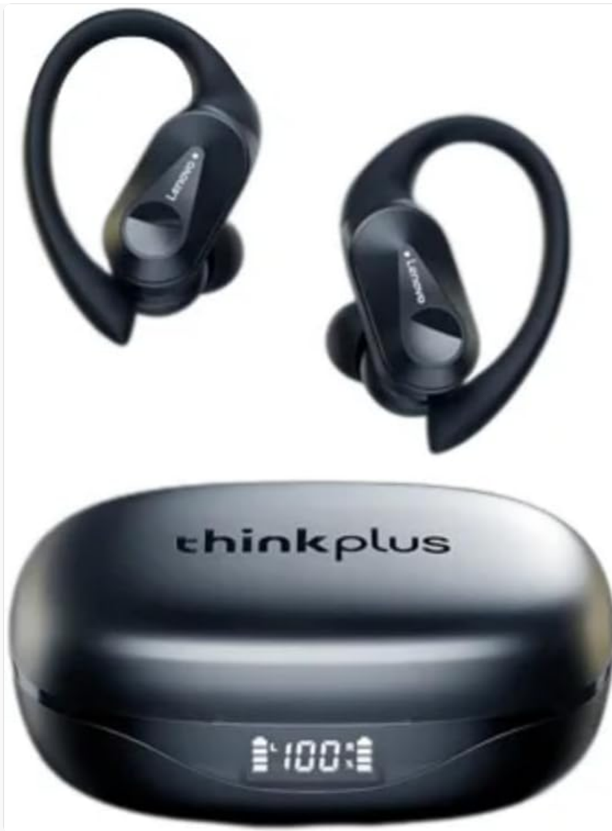
Image: Thinkplus LP75 Wireless Earbuds (left and right) with their charging case. The earbuds are black with ear hooks, and the charging case is also black with "thinkplus" branding and a digital battery indicator showing "100%".