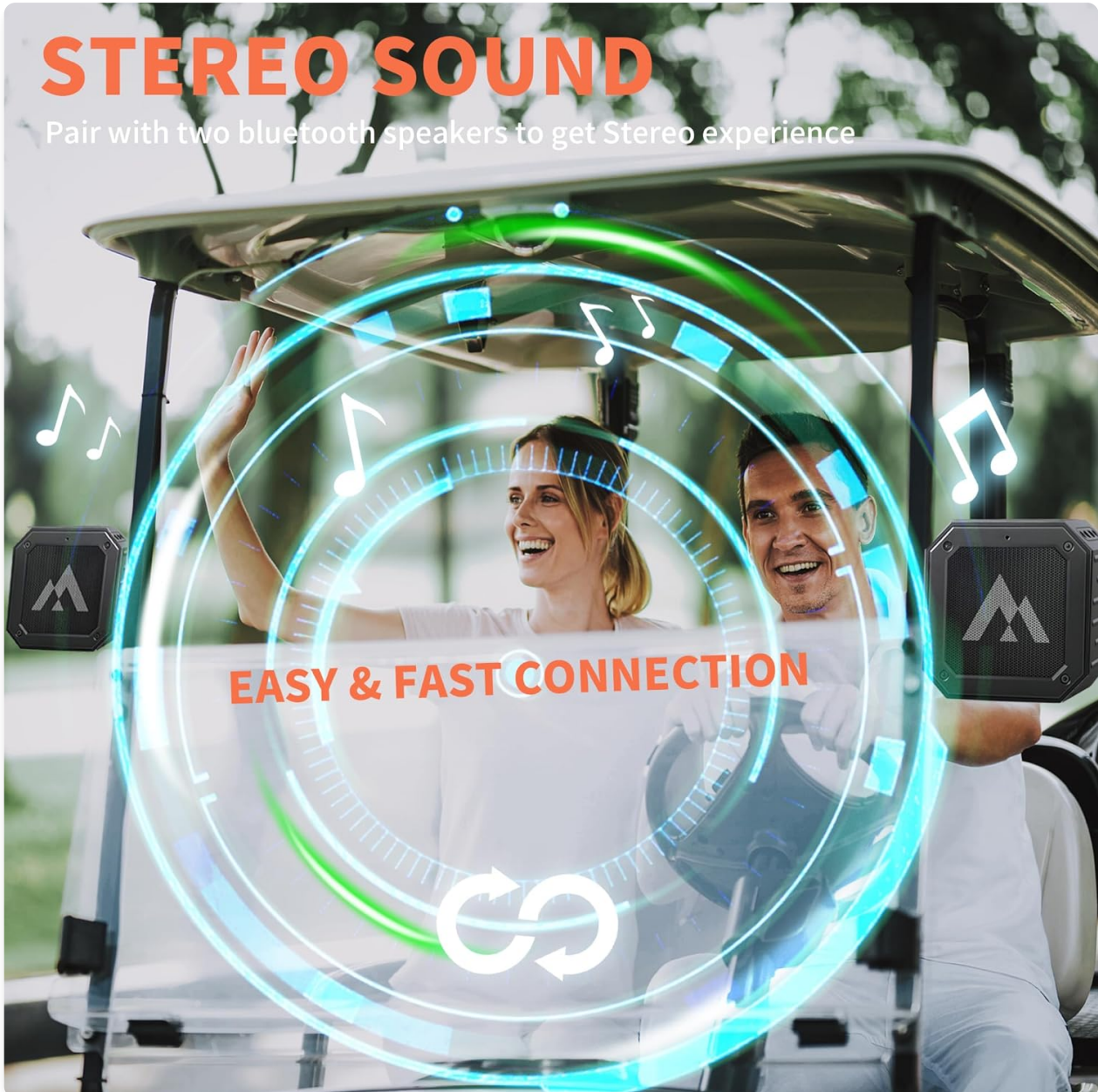
Image: Illustrates two speakers paired for stereo sound, enhancing the audio experience within a golf cart.