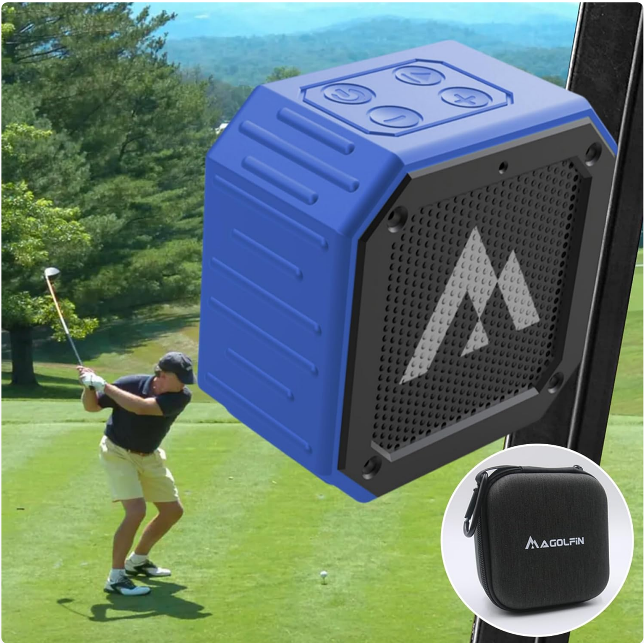
Image: The MAGOLFİN Golf Cart Speaker X10, highlighting its compact design and included storage case, set against a golf course backdrop.