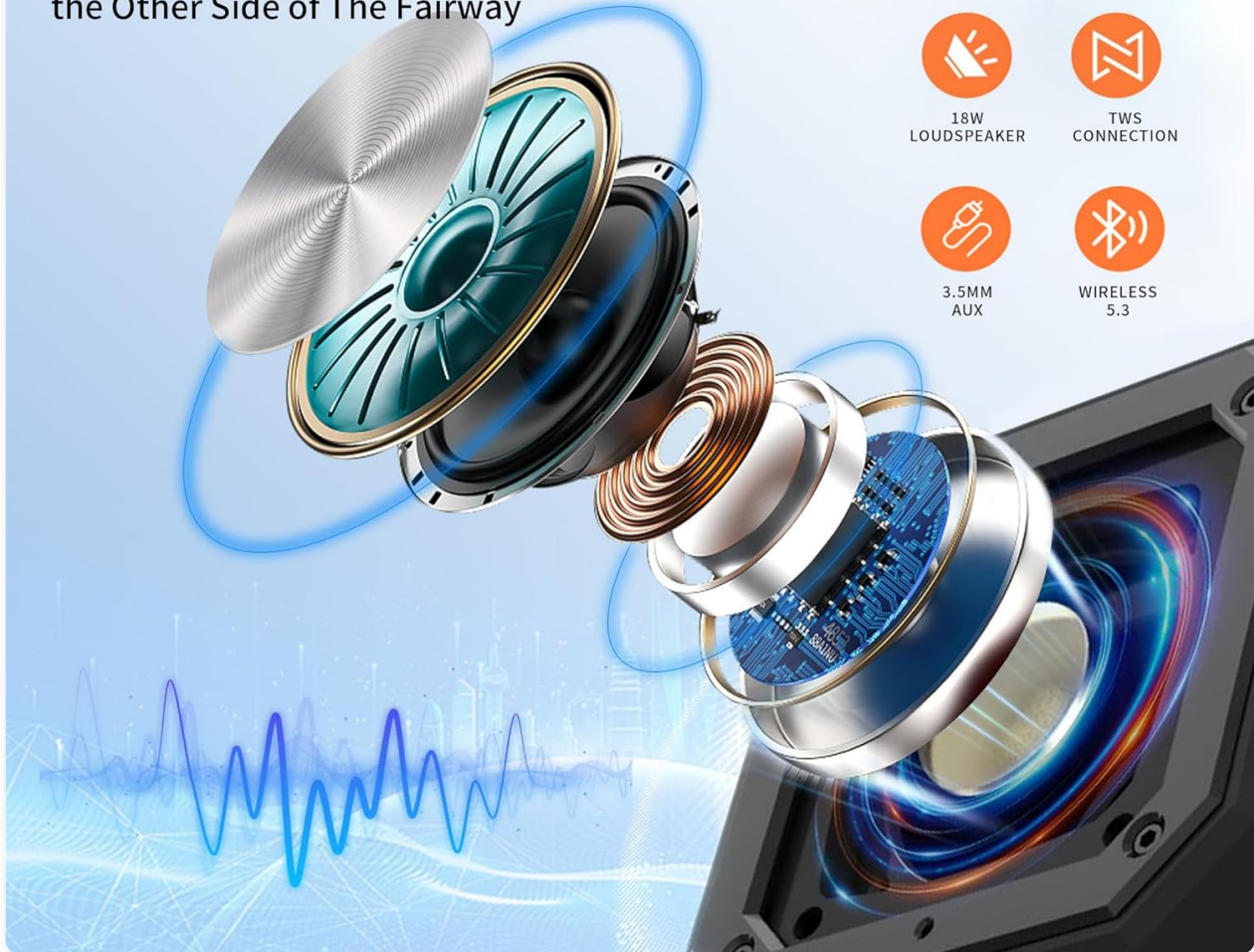
Image: An exploded view diagram illustrating the speaker's internal audio components and connectivity features like 18W loudspeaker, 3.5mm AUX, Wireless 5.3, and TWS connection.

The Sound has Bass and Loud Enough to Hear From the Other Side of The Fairway