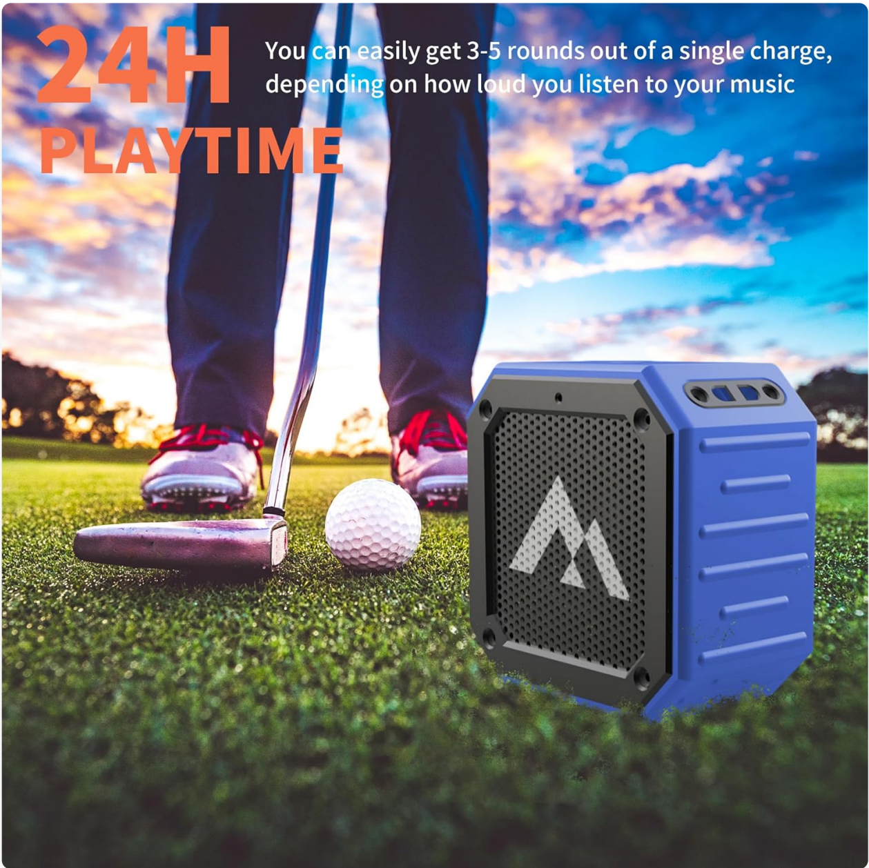
Image: The speaker positioned on a golf course, emphasizing its long battery life suitable for multiple rounds of golf.

You can easily get 3-5 rounds out of a single charge, depending on how loud you listen to your music