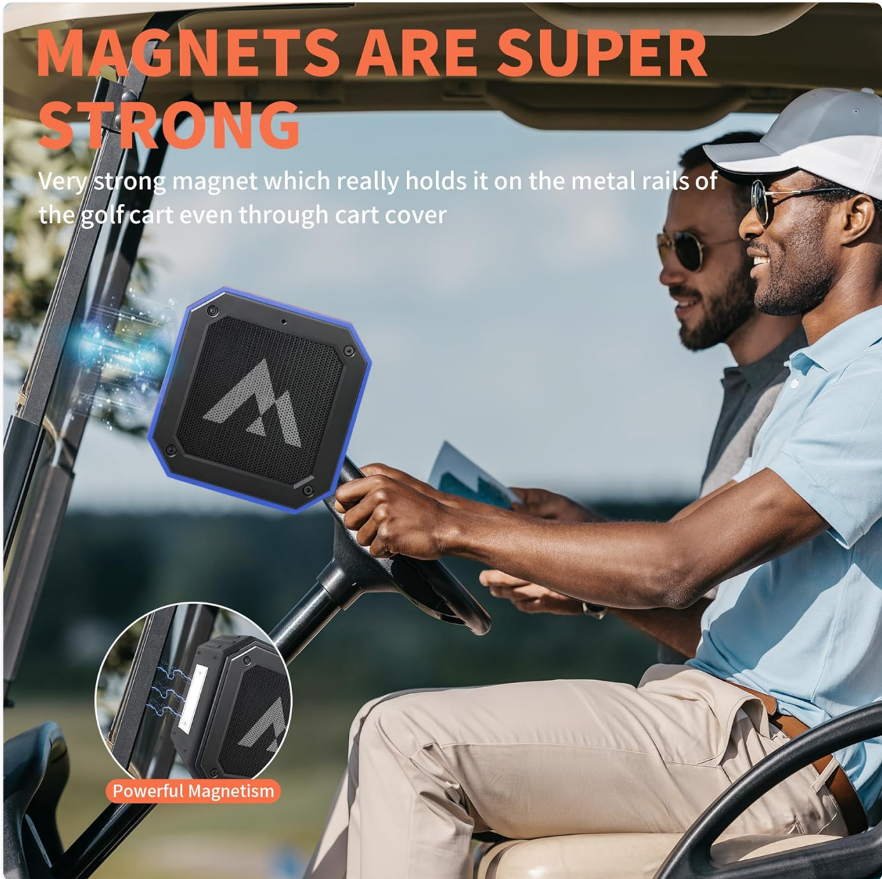
Image: Demonstrates the speaker's strong magnetic attachment to a golf cart, ensuring stability during use.