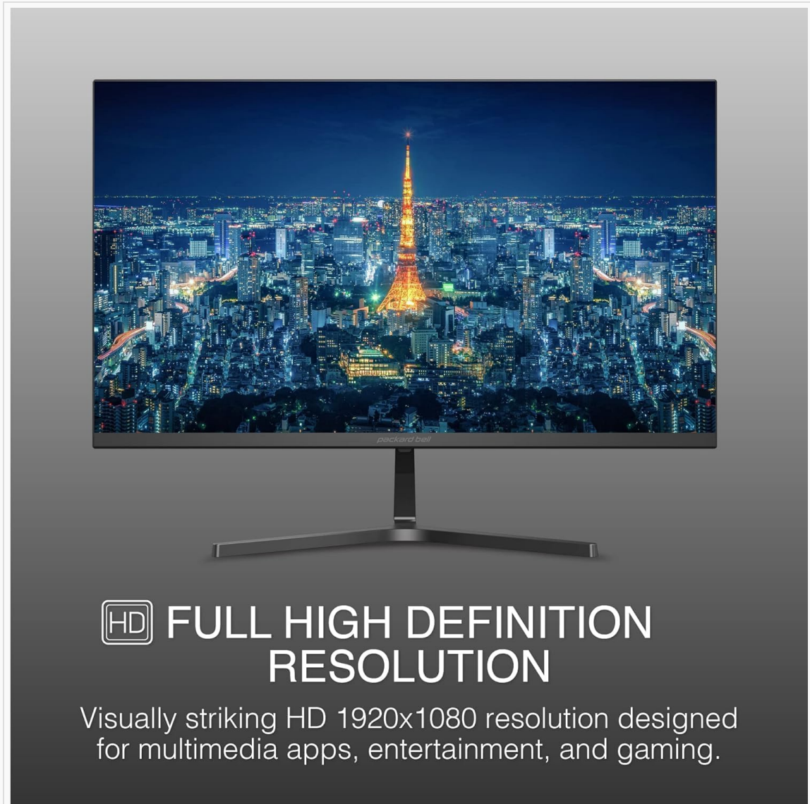
Figure 3: Full High Definition Resolution for crisp visuals.