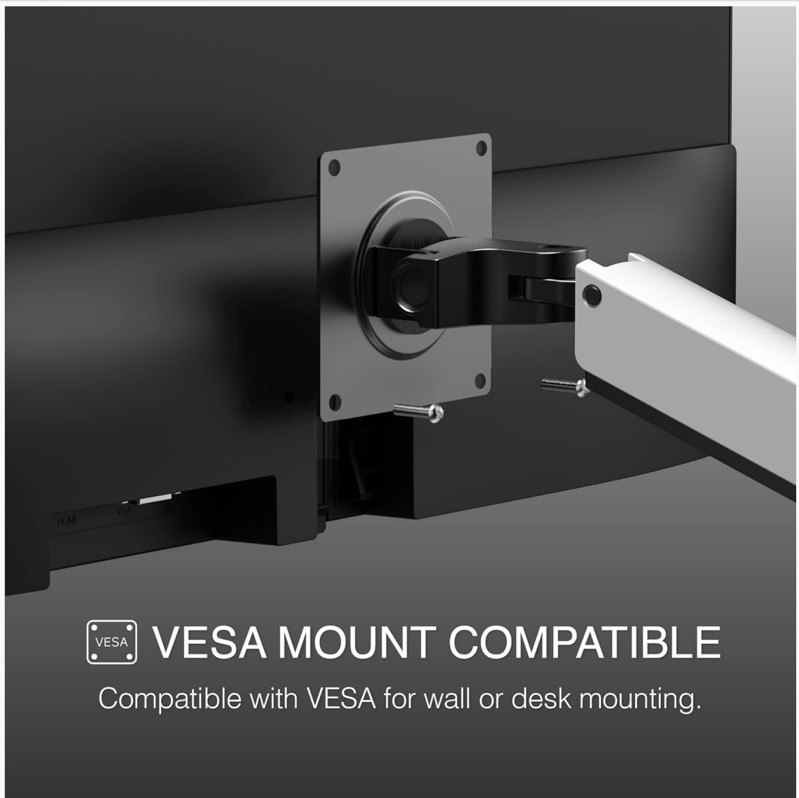
Figure 6: VESA mount compatibility for flexible setup.