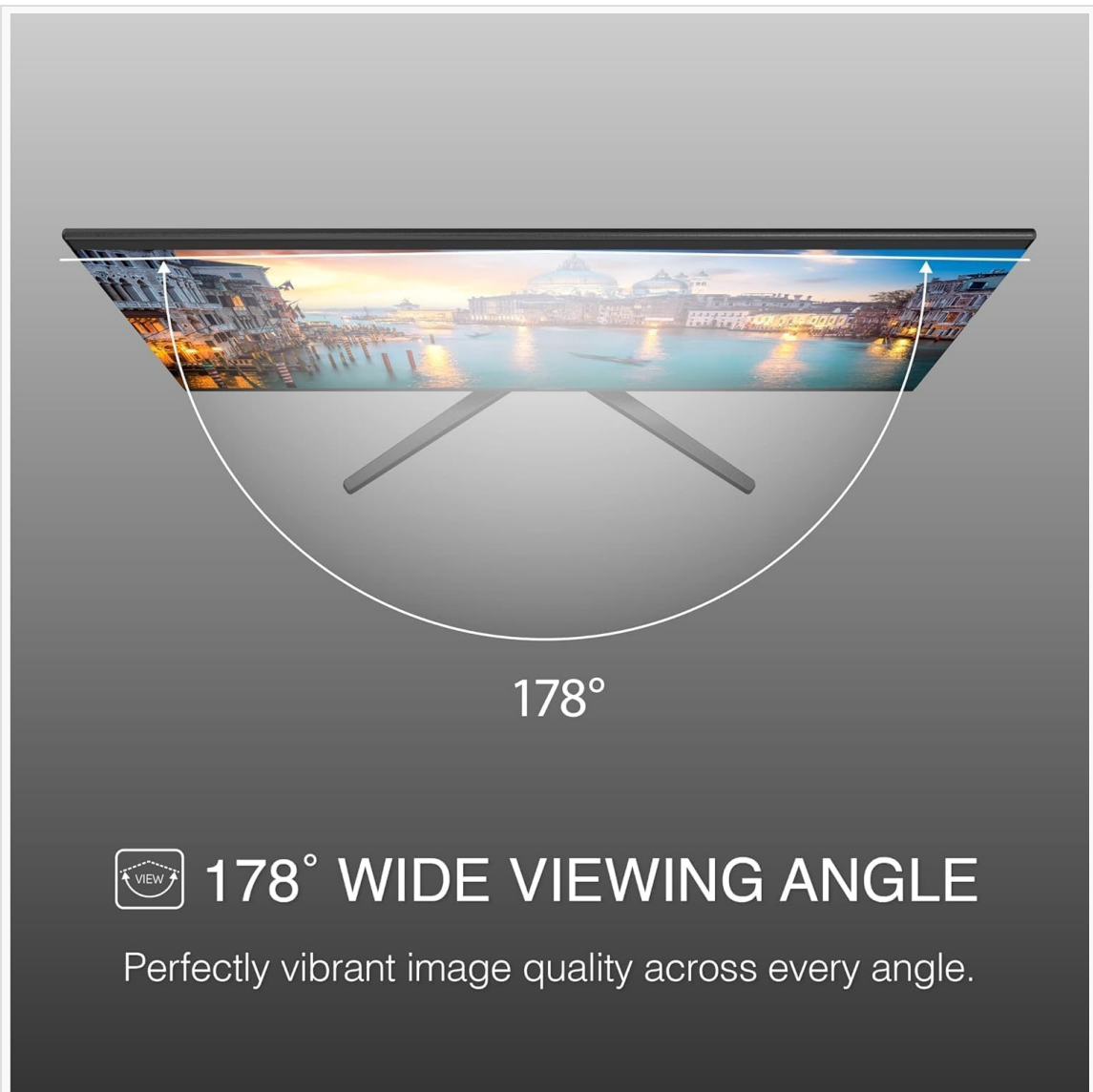
Figure 4: Wide 178-degree viewing angle.