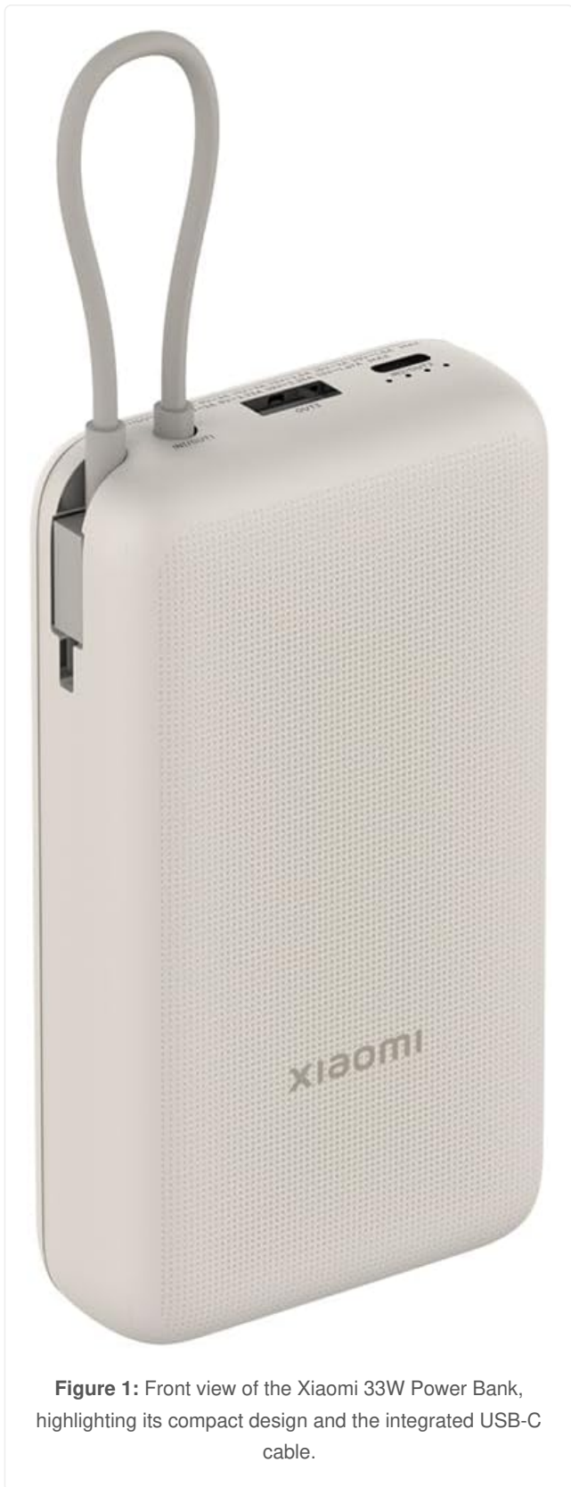
Figure 1: Front view of the Xiaomi 33W Power Bank, highlighting its compact design and the integrated USB-C cable.