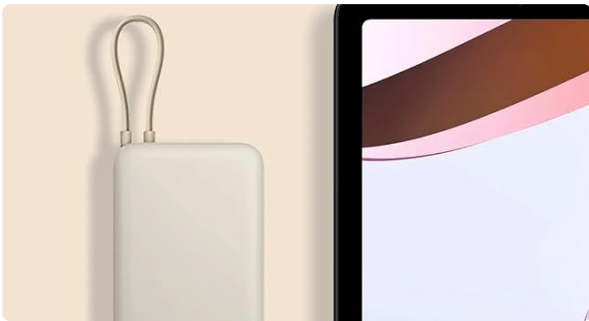
Figure 3: Illustrates the power bank being charged. Ensure a compatible power adapter is used for fast charging.