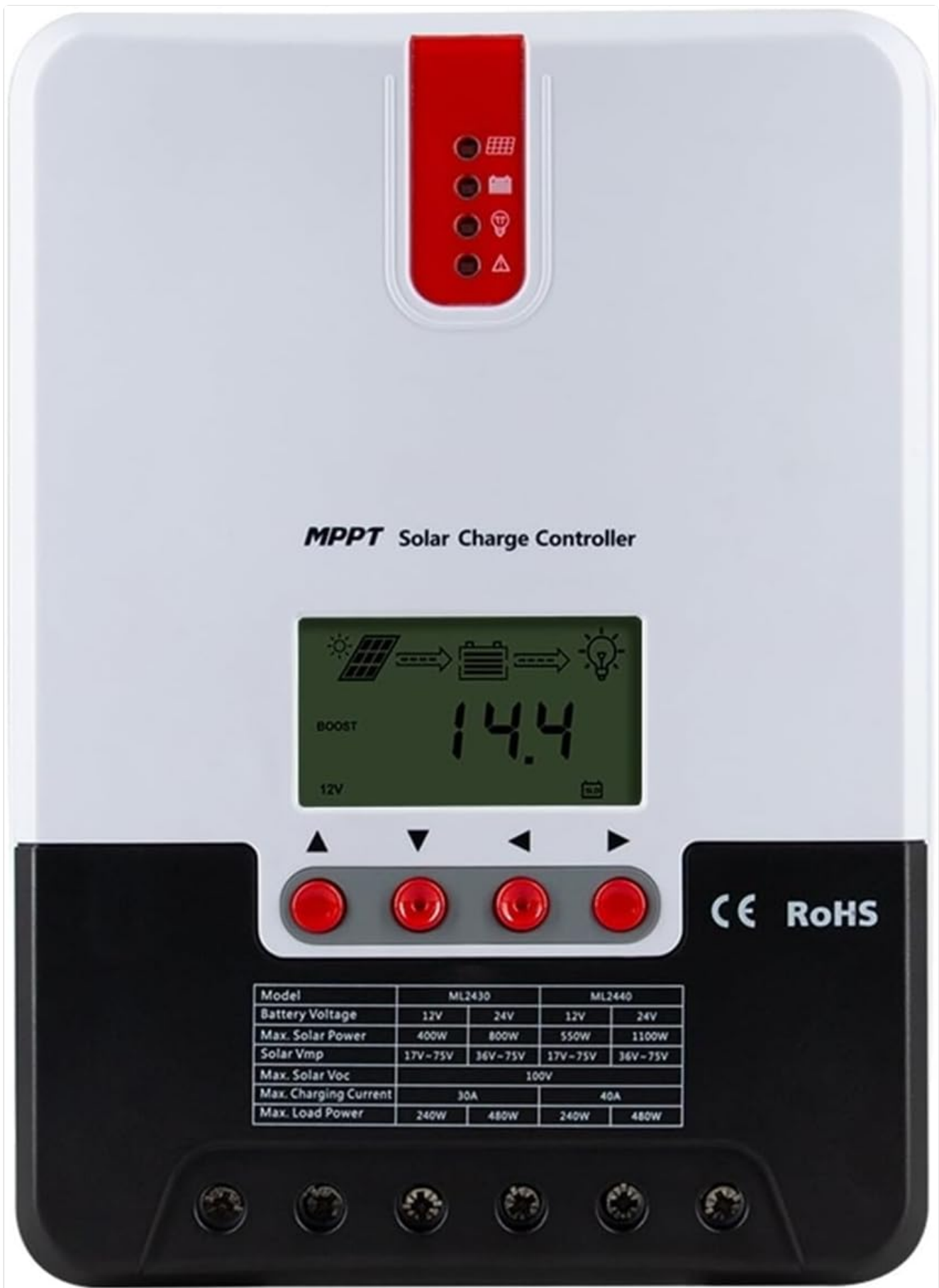
Figure 1: Front view of the ML2430/ML2440 controller, showing the LCD display, control buttons, and model specifications.