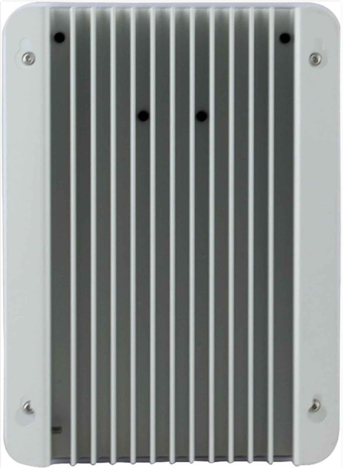
Figure 2: Rear view of the controller, highlighting the integrated heat sink fins for efficient thermal management.