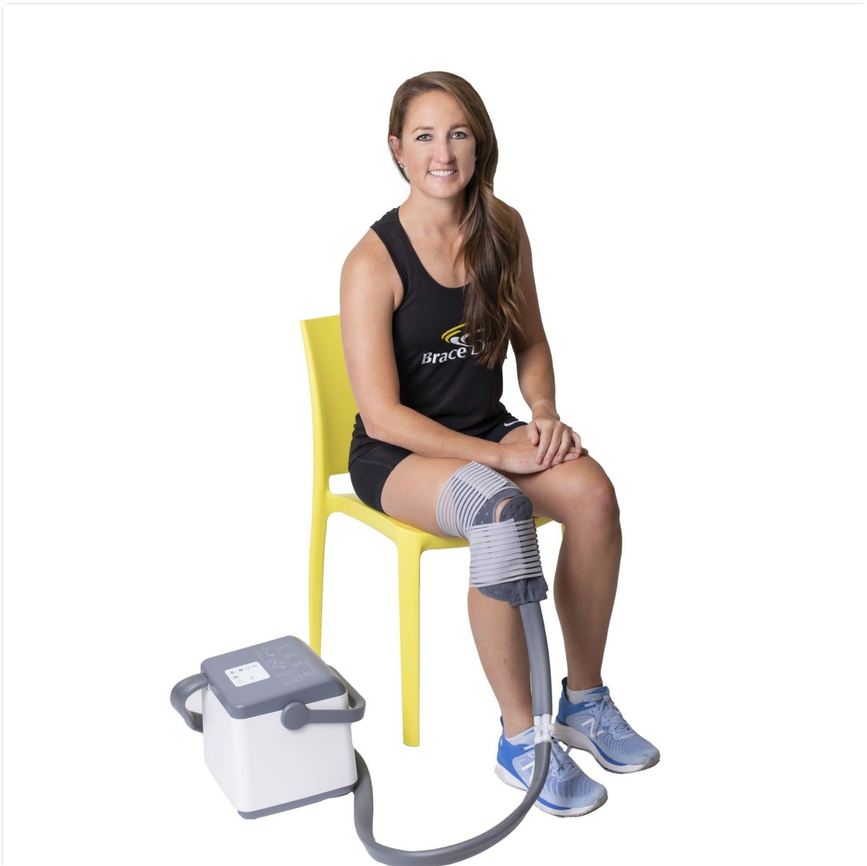
Image 1.1: The IcedHeat Digital Hot & Cold Therapy Machine with its universal pad.