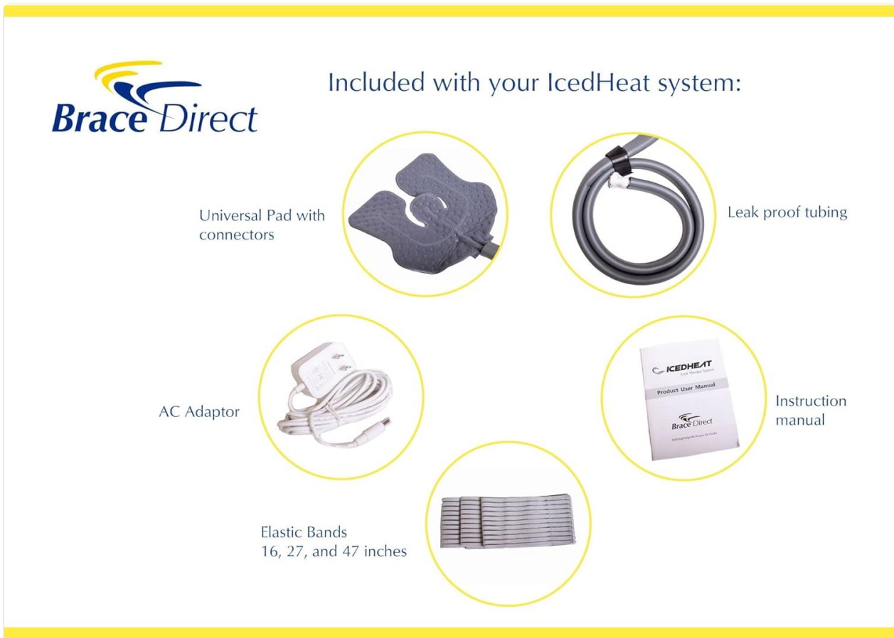
Image 2.1: Overview of all components included with your IcedHeat system.