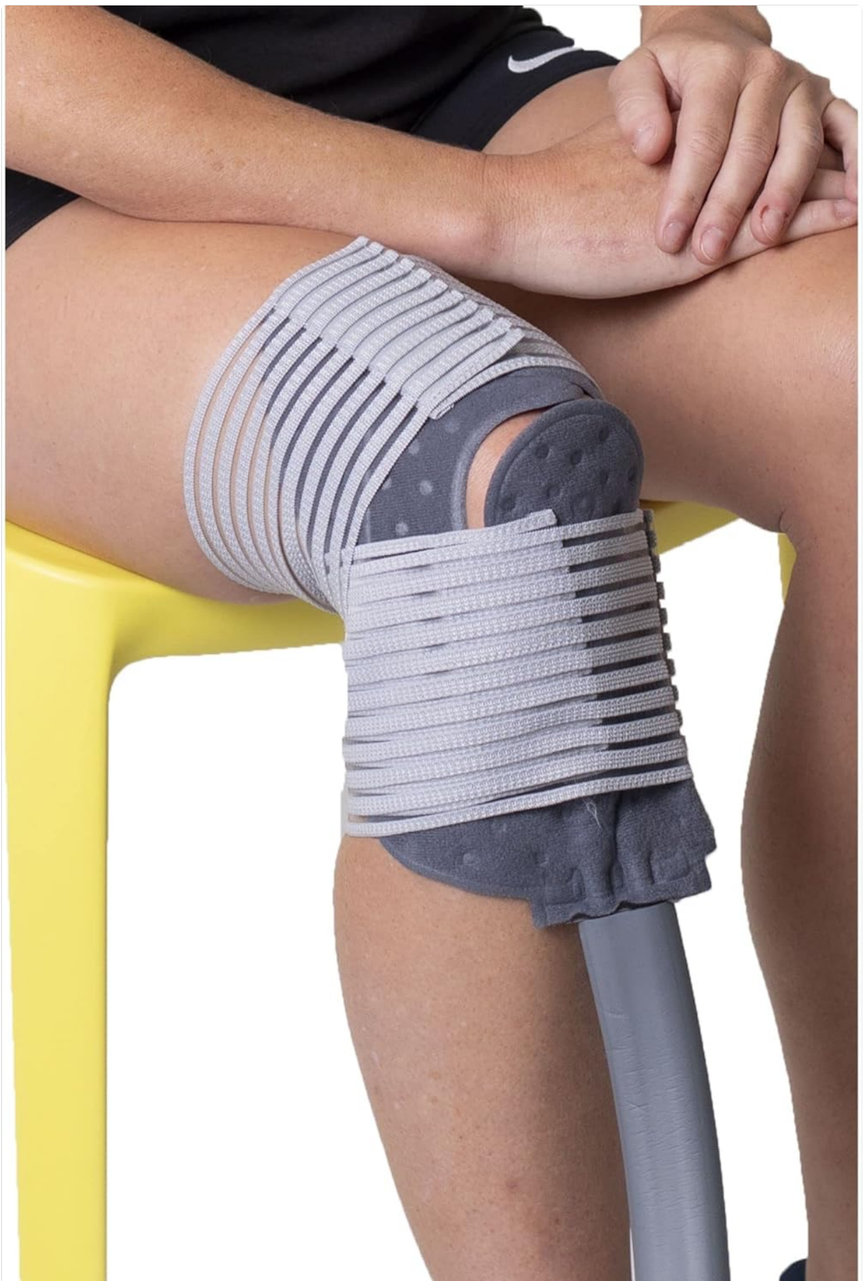
Image 3.1: Proper application of the universal pad to the knee using elastic bands.