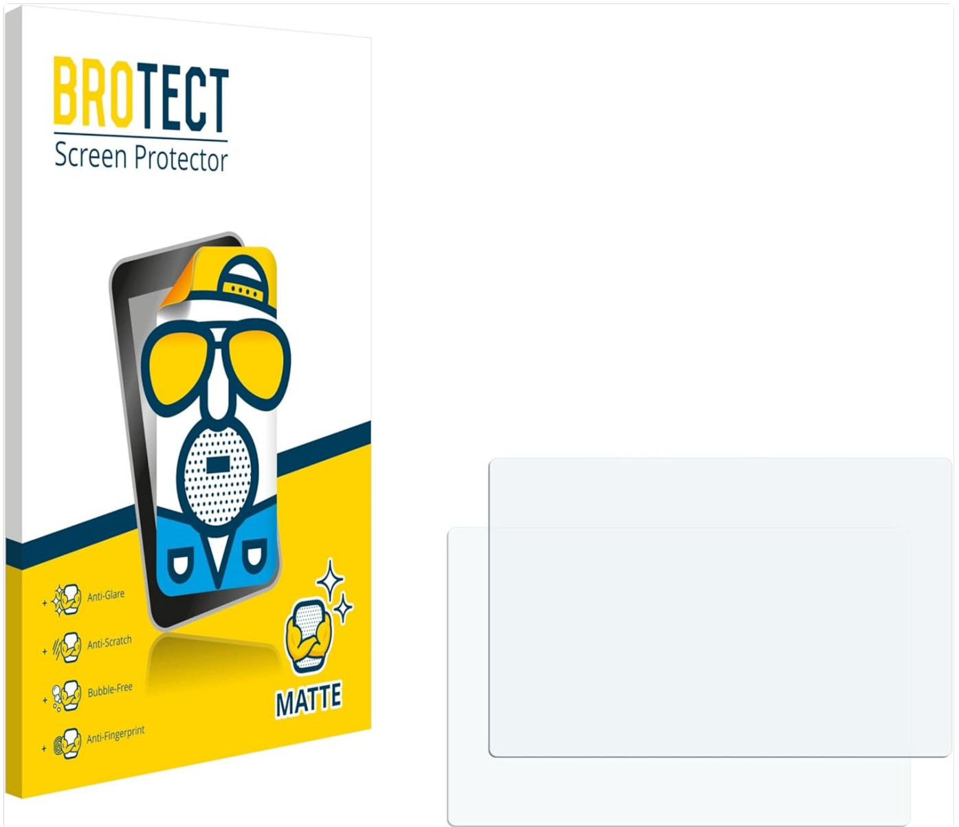
Image: The BROTECT Matte Screen Protector package alongside two individual screen protectors, illustrating the product contents.