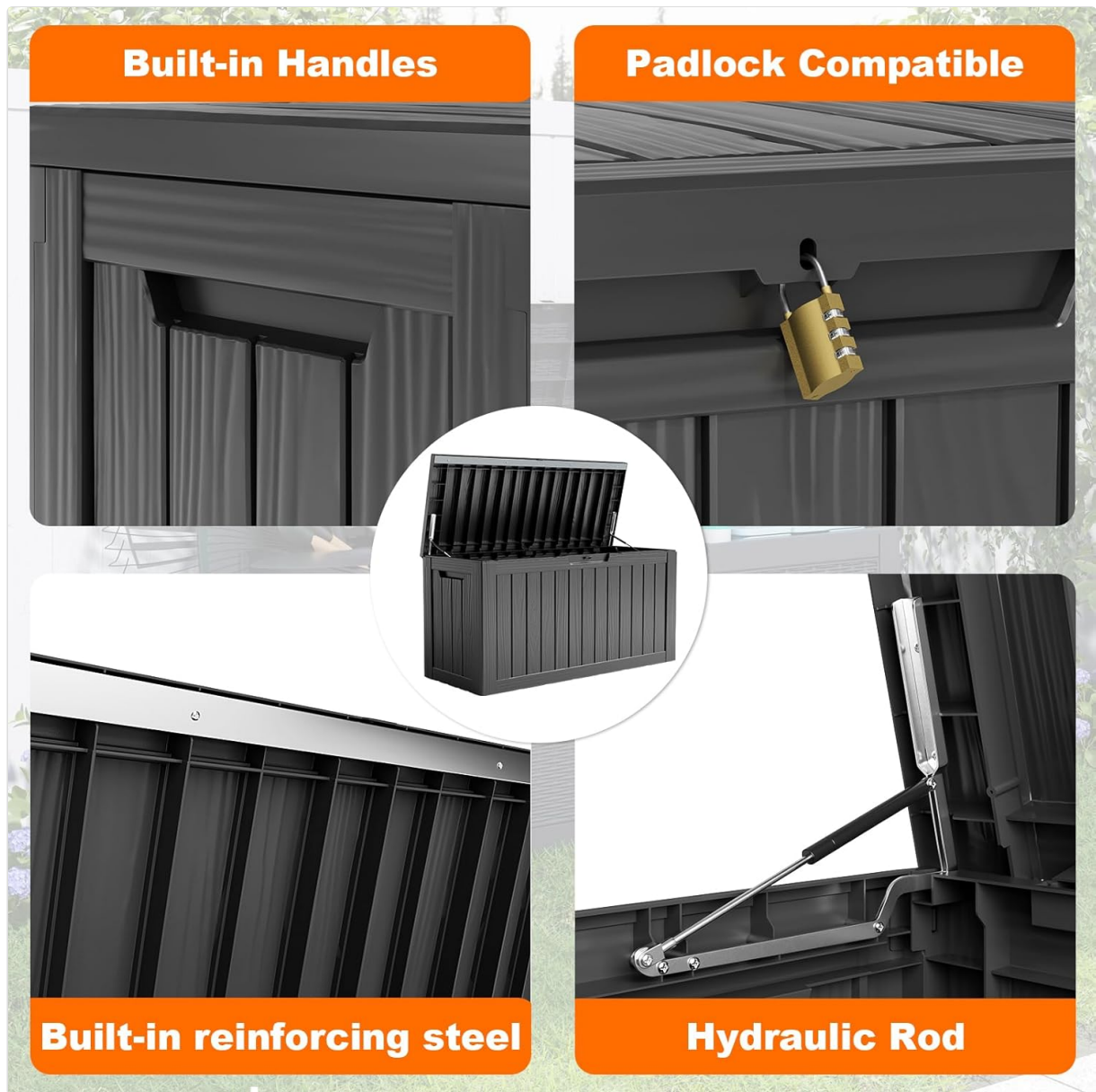
Image: Detailed view of the built-in handles, padlock-compatible latch, internal reinforcing steel, and the hydraulic rod for smooth lid operation.