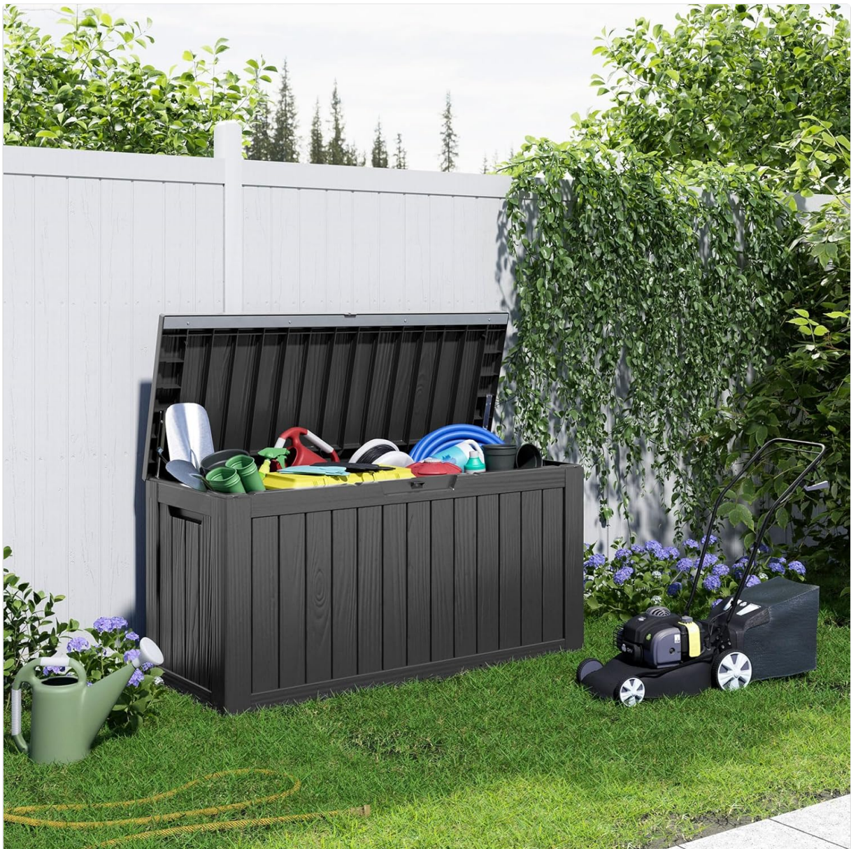
Image: The deck box open and filled with various items, demonstrating its storage capacity for patio cushions, gardening tools, and other outdoor essentials.