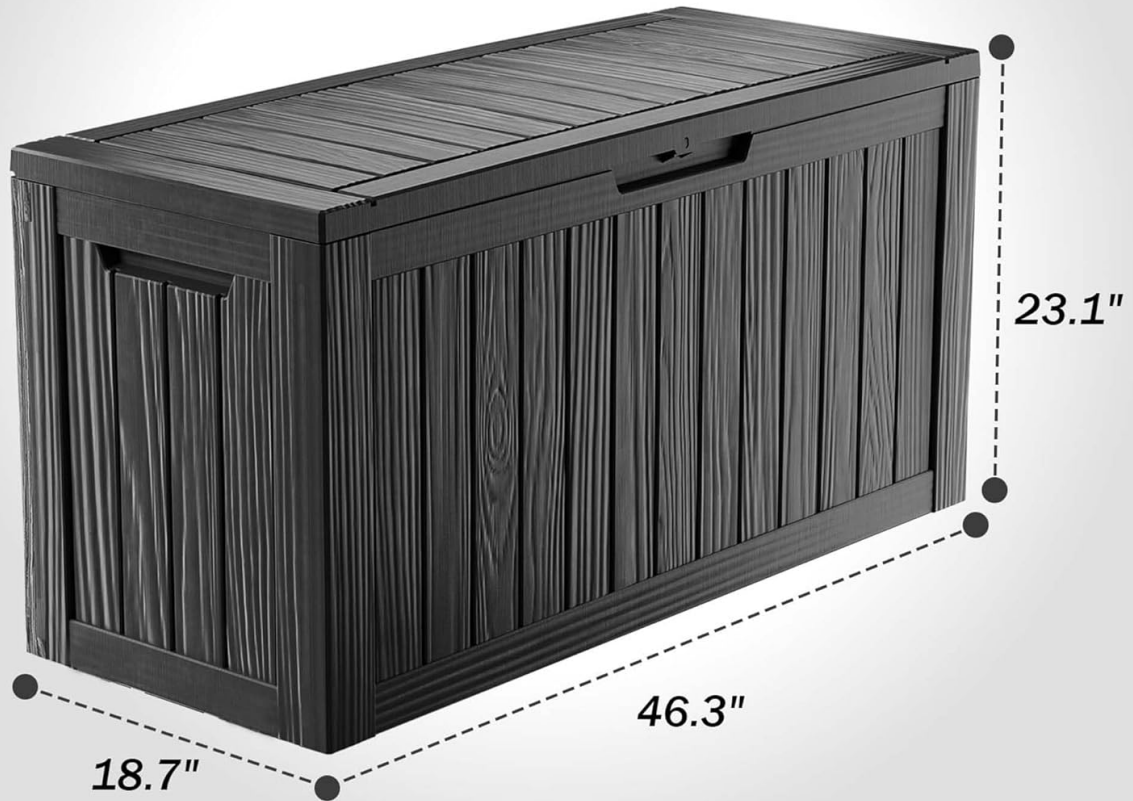
Image: Dimensional diagram of the 90 Gallon Deck Box, indicating length, width, and height.