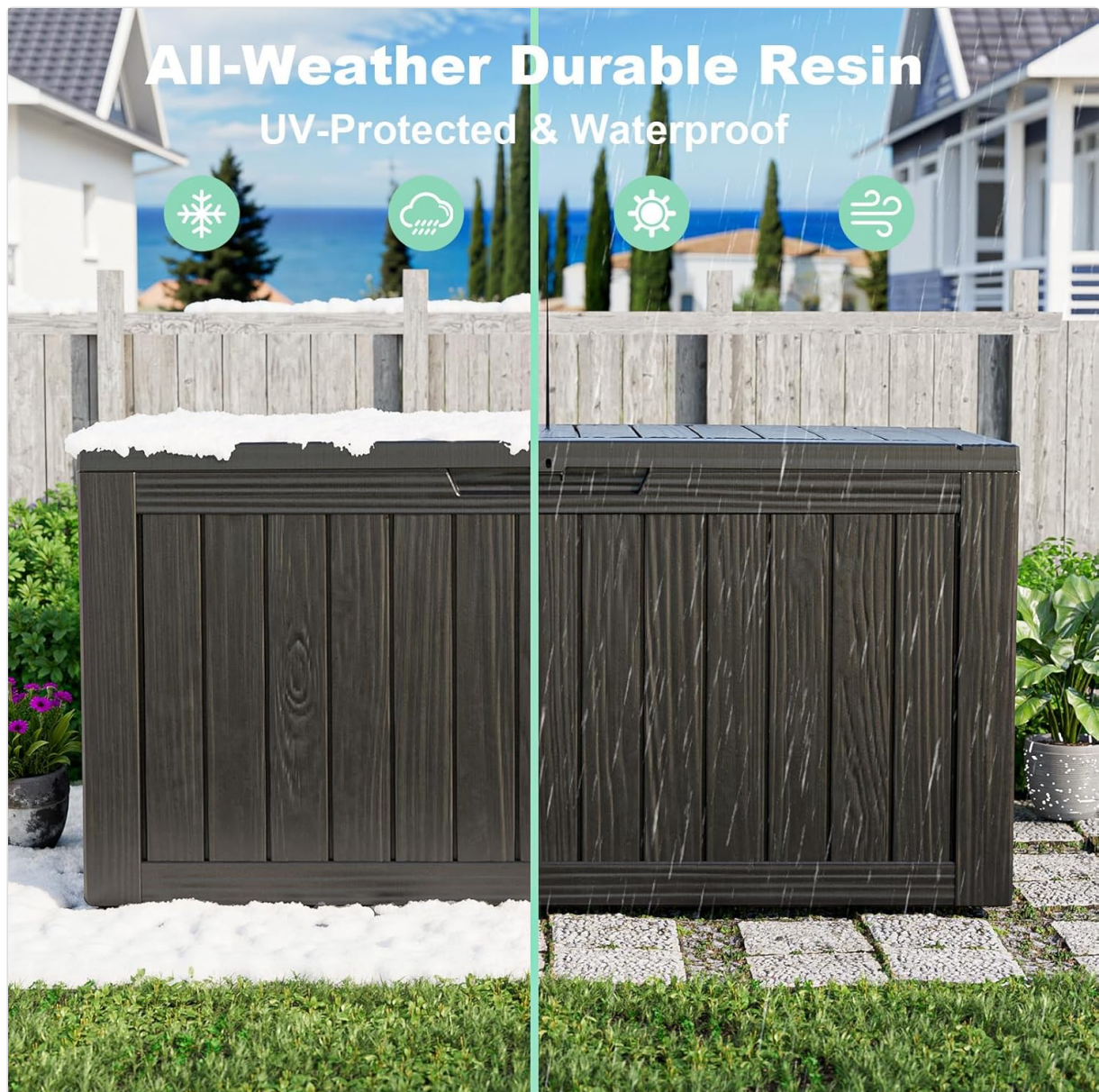
Image: The deck box is shown enduring various weather conditions, including snow and rain, highlighting its all-weather durable resin, UV protection, and waterproof properties.