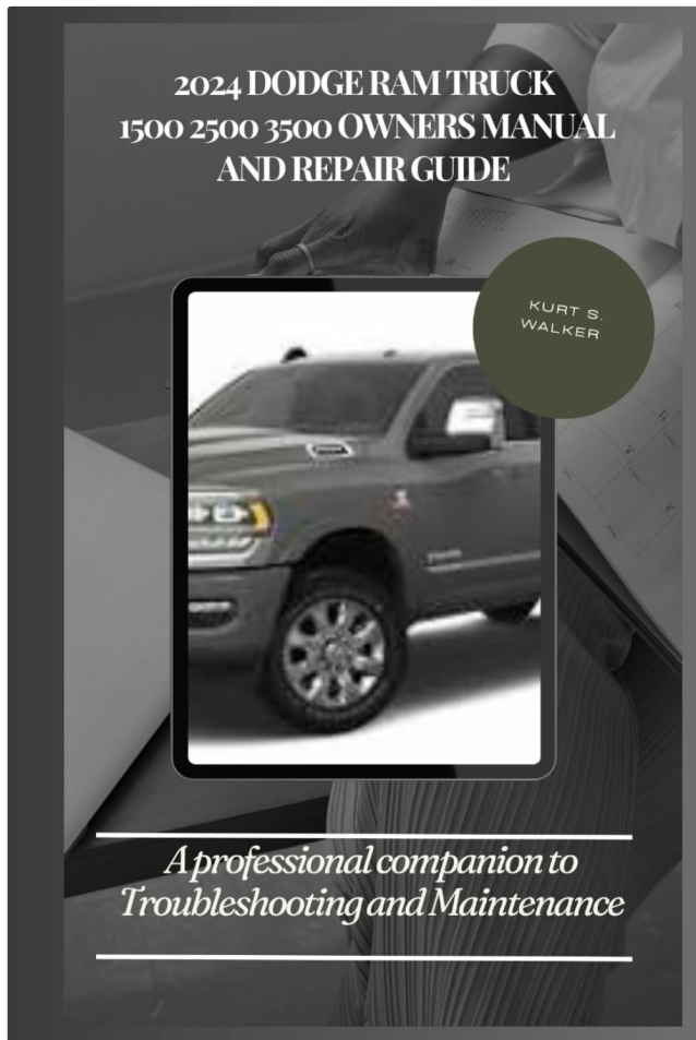
Figure 1: Front cover of the 2024 Dodge Ram Truck Owner's Manual and Repair Guide. The cover displays the title, author, and a stylized image of a Dodge Ram truck on a digital screen, indicating its focus on modern vehicle maintenance.