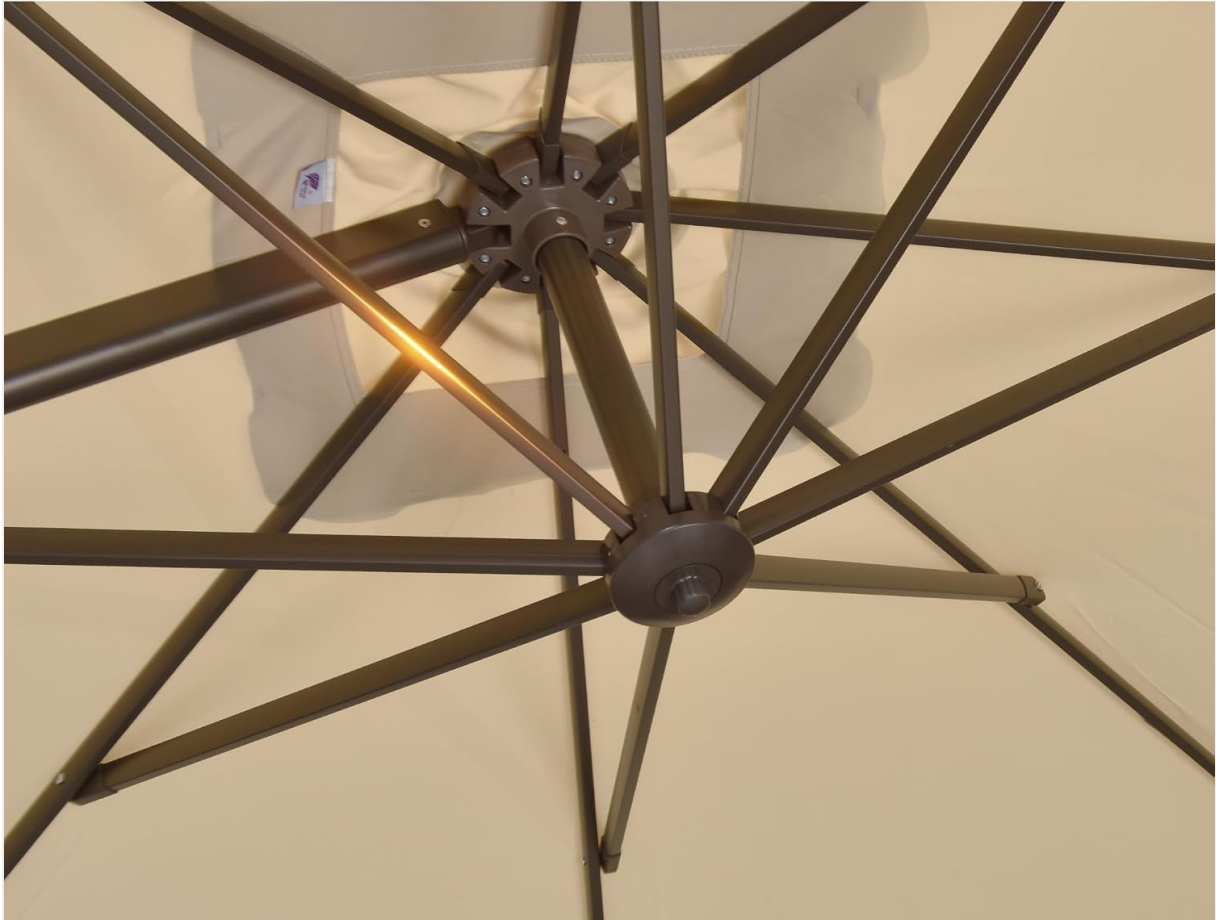
Image illustrating the 360-degree rotation capability of the umbrella, showing how the canopy can be repositioned.