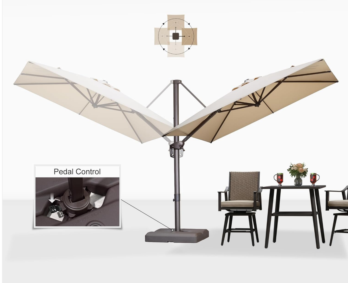
Image depicting the five adjustable tilt levels of the umbrella canopy, demonstrating its flexibility in providing shade.

Your browser does not support the video tag.