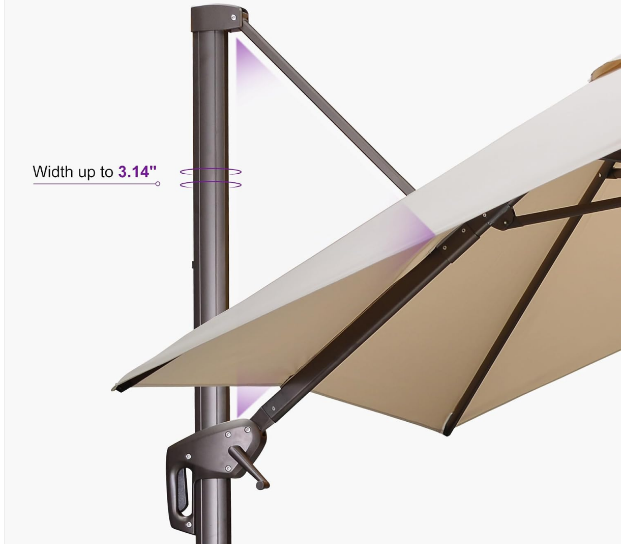
Diagram showing the product dimensions of the 8' x 8' Cantilever Patio Umbrella, including height and canopy width.