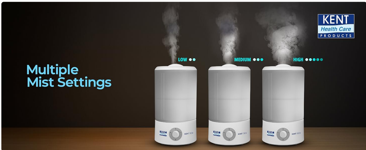
Image 5.3: The humidifier's silent operation ensures minimal disturbance, ideal for use during sleep.