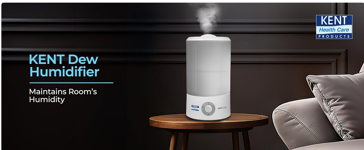
Image 1.1: The KENT Dew Humidifier in operation, releasing ultrasonic mist.

The KENT Dew Humidifier is designed to enhance indoor air quality by maintaining optimal humidity levels. It utilizes ultrasonic mist technology to release fine mist without producing water droplets, ensuring a comfortable environment. This humidifier is particularly beneficial in conditions where air can become dry, such as during the use of air conditioners or room heaters. Its integrated UV LED light helps purify the water, contributing to healthier mist output.