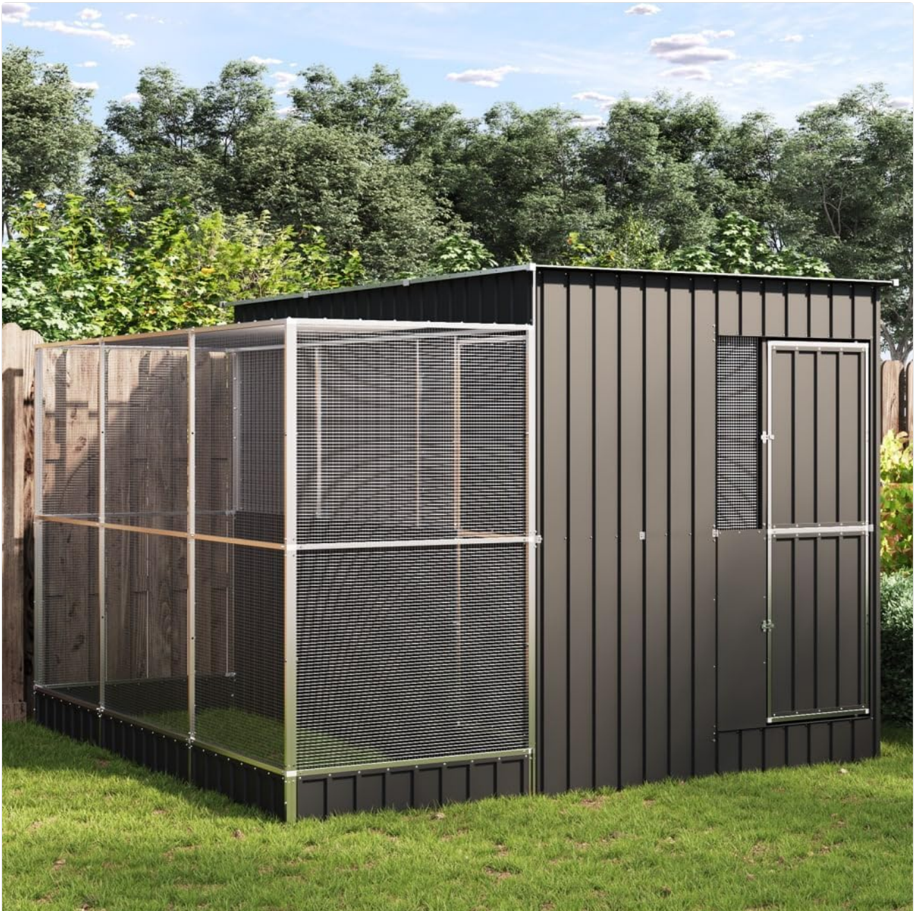
Figure 4.1: The aviary in an outdoor setting, showcasing its intended use.