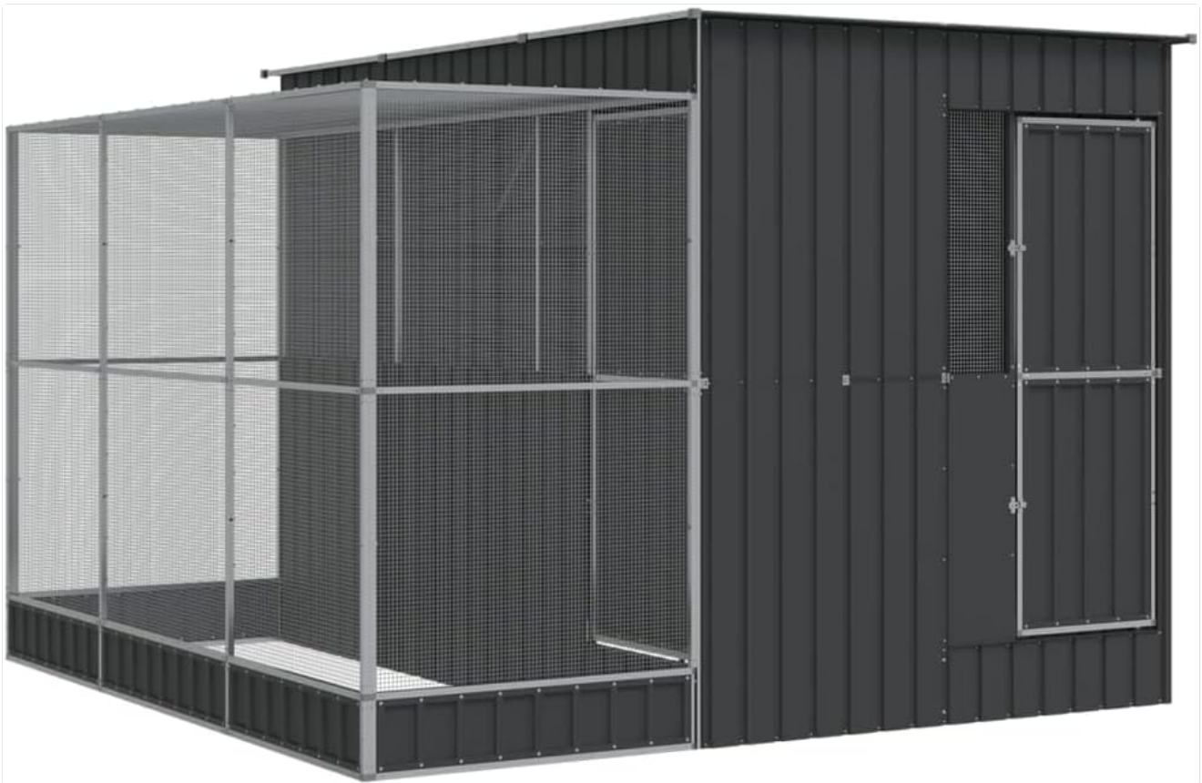
Figure 7.1: The vidaXL Aviary with Extension.