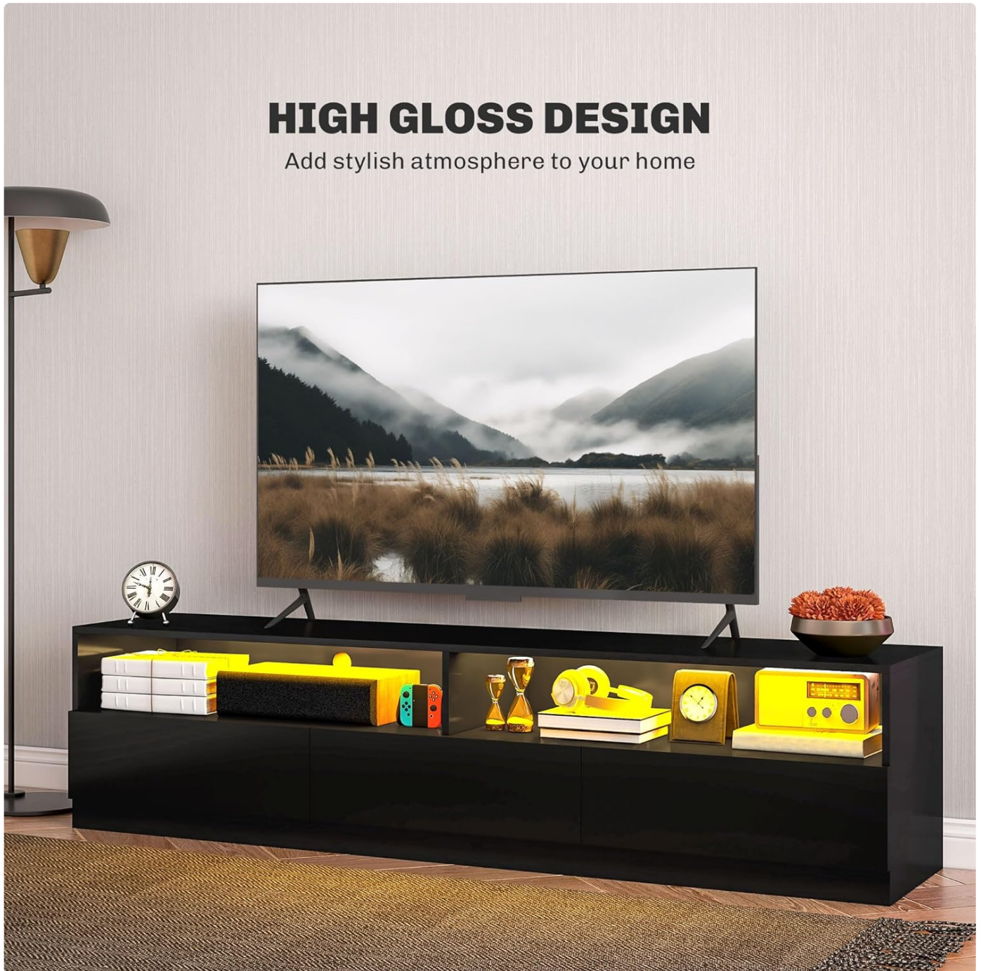
Image 3.1: The high gloss finish of the TV cabinet, designed to add a stylish atmosphere.