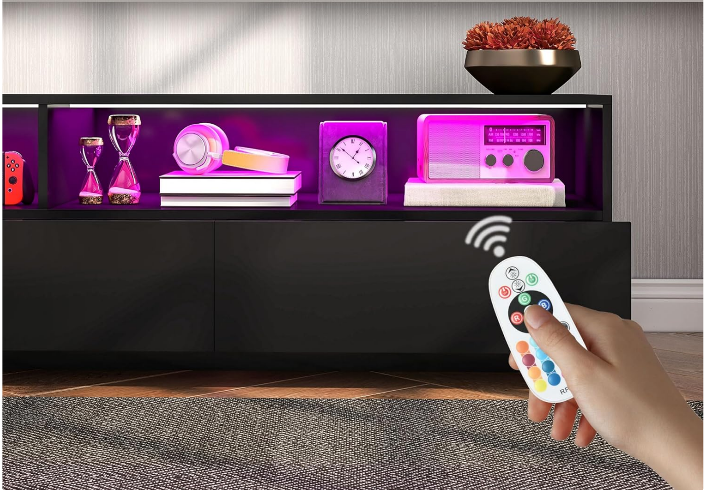
Image 6.1: Overview of the RGB LED light features, including color options, modes, and remote control functionality.