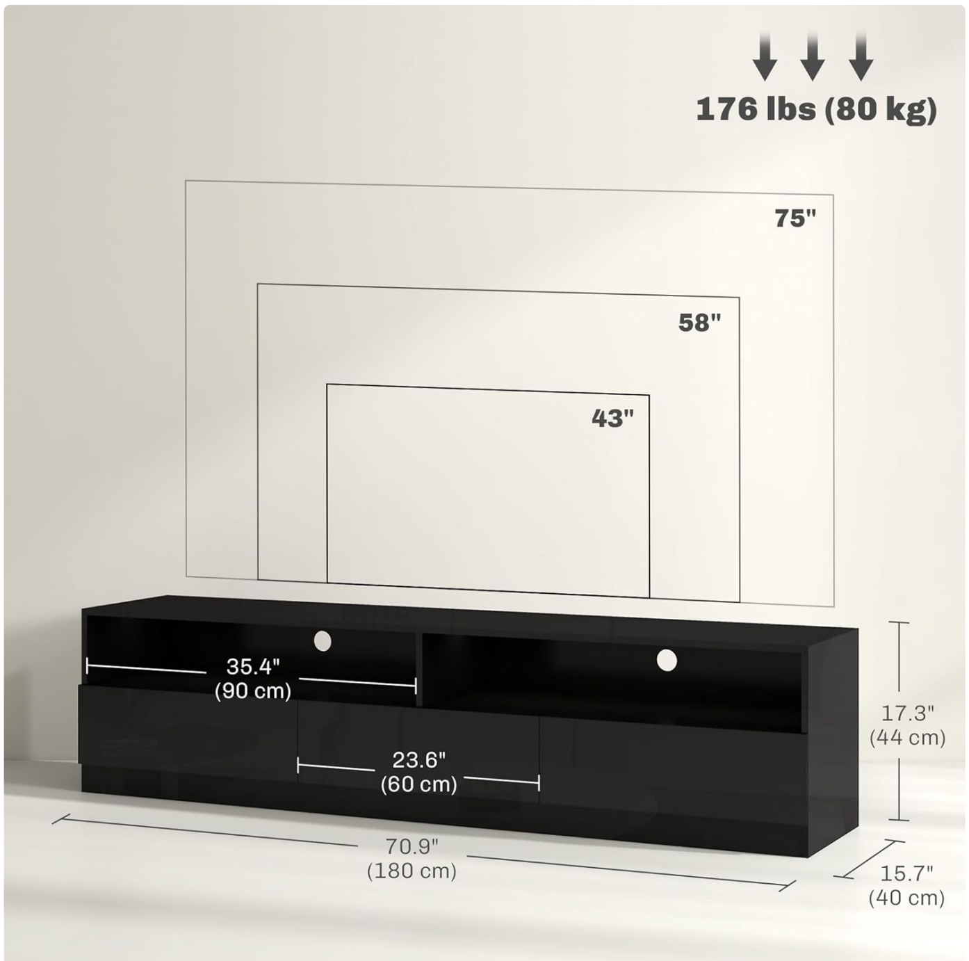
Image 4.1: Dimensional diagram of the TV cabinet, including length, width, height, and weight capacity.