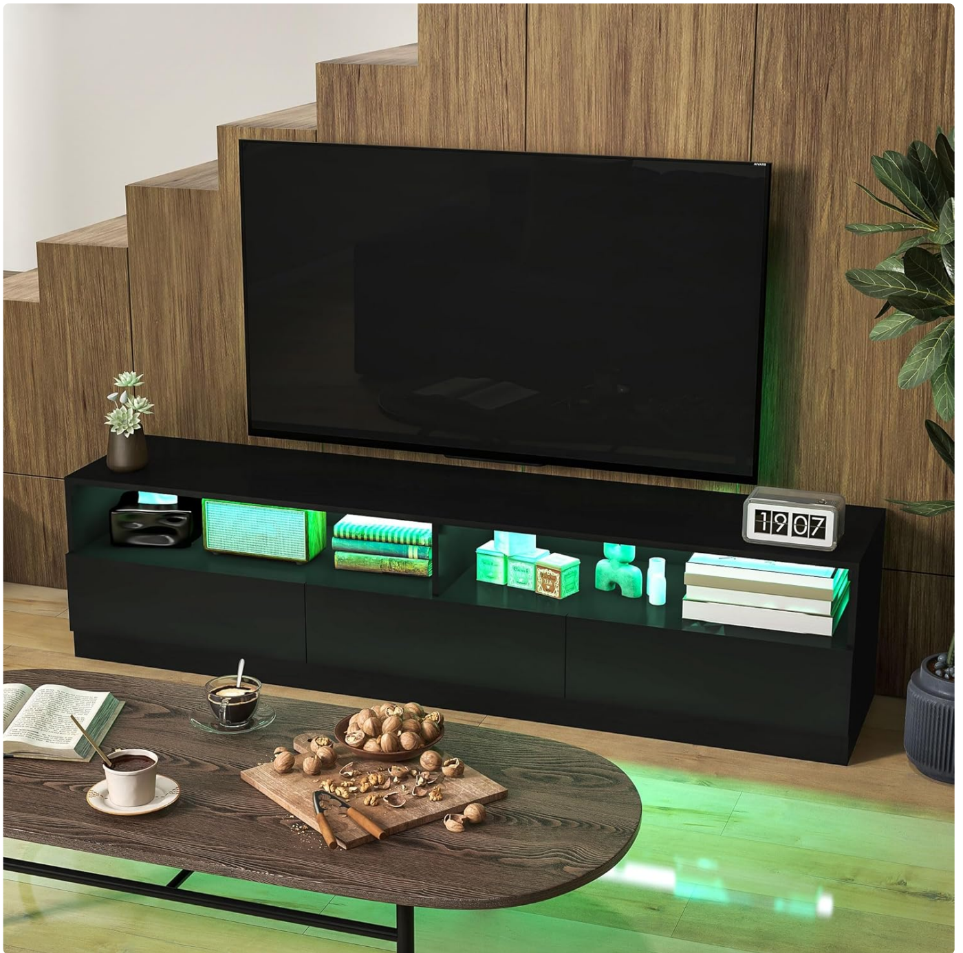
Image 6.2: The TV cabinet with its LED lights set to a vibrant green, enhancing the room's ambiance.