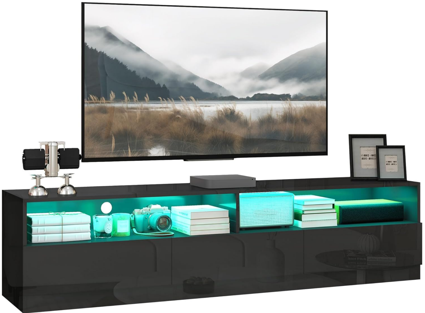
Image 1.1: The HOMCOM High Gloss LED TV Cabinet Stand in a modern living room setting, showcasing its illuminated shelves.