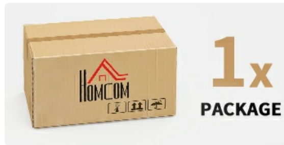
Image 5.1: The product is delivered in one package, containing all necessary components for assembly.