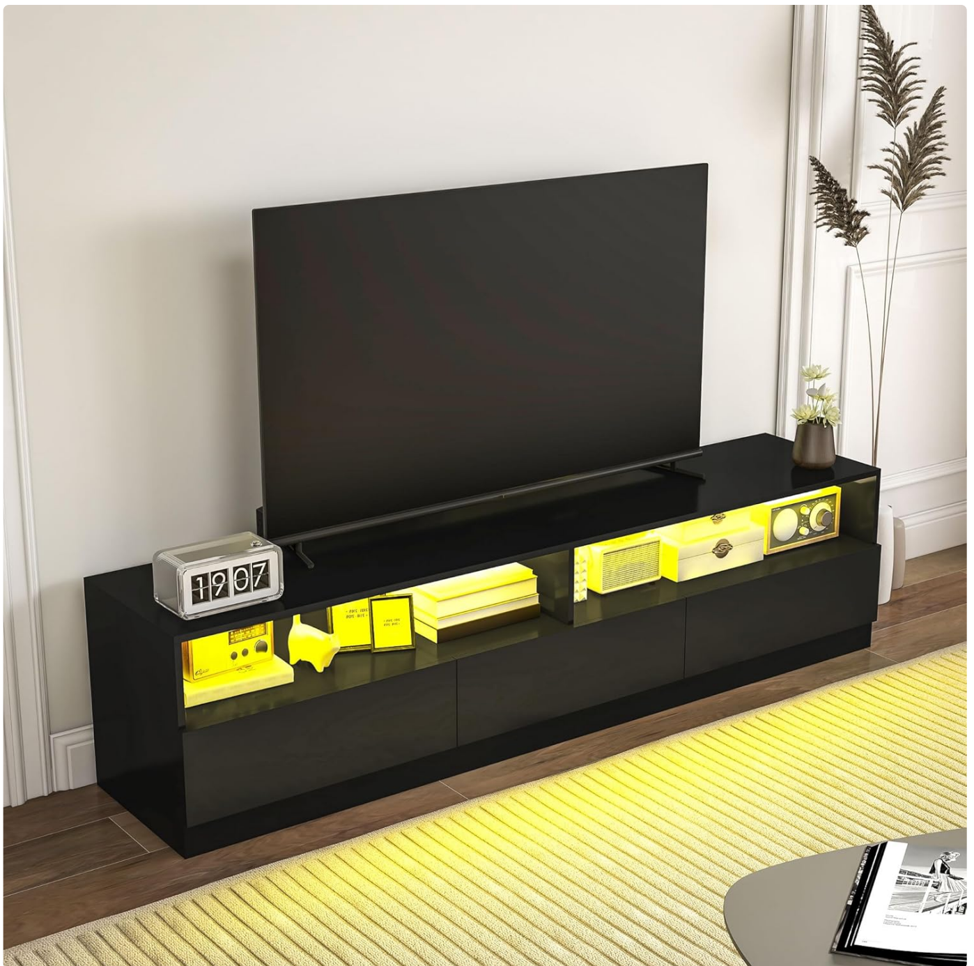
Image 6.3: The TV cabinet displaying warm yellow LED lighting, creating a cozy atmosphere.