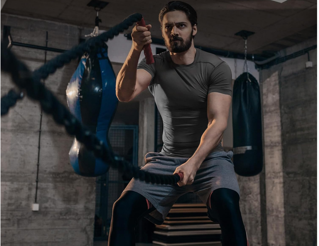
Image: A man engaged in a battle rope exercise in a gym, symbolizing the smartwatch's support for over 150 sports modes.