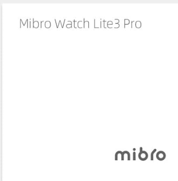
Manuale d'uso x1