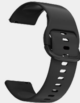
Cinturino in silicone x1