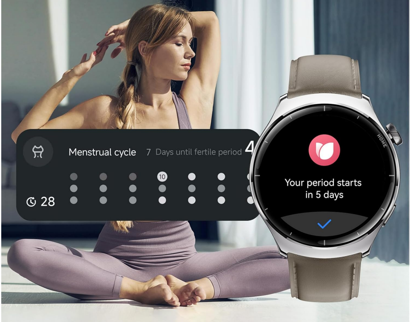
Image: A smartwatch displaying a menstrual cycle tracking interface, showing days until the next period, with a woman performing yoga in the background.