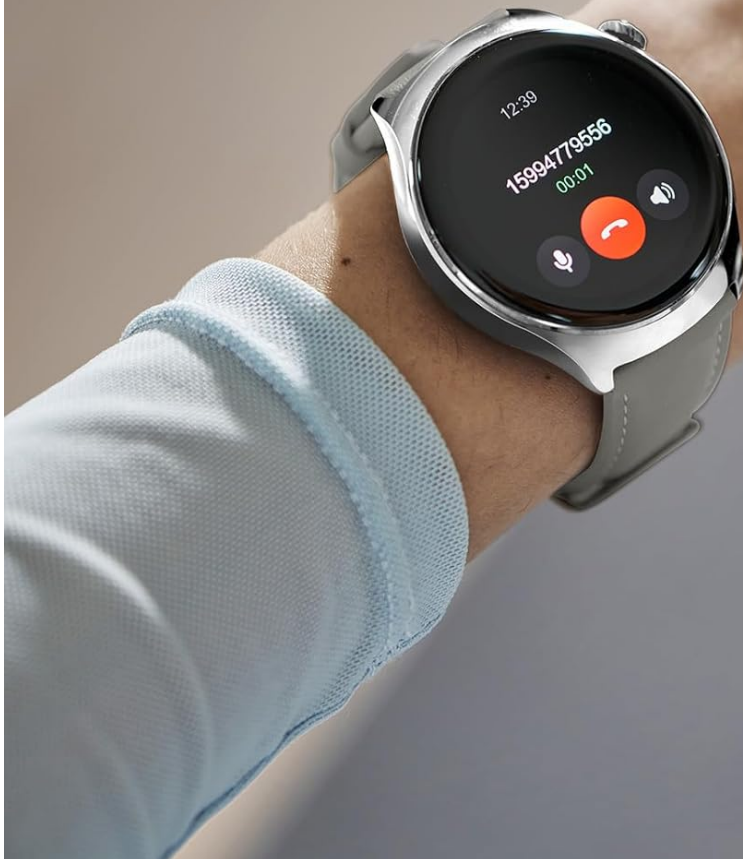
Image: A Mibro Lite3 Pro smartwatch on a wrist, showing an incoming call notification with options to answer or decline.