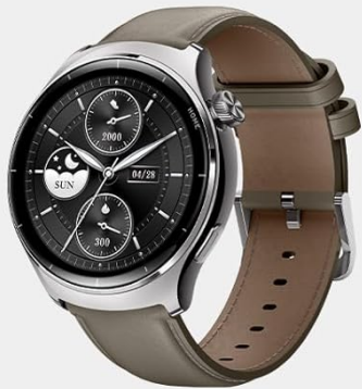
Orologio (con cinturino in pelle) x1