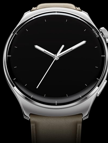
Image: Illustration of the Always-On Display feature, showing various watch face options in standby mode.

Nota: La durata della batteria si riduce se la modalità AOD è attiva. Questa modalità viene disattivata automaticamente in modalità sonno, modalità risparmio energetico e modalità batteria bassa.