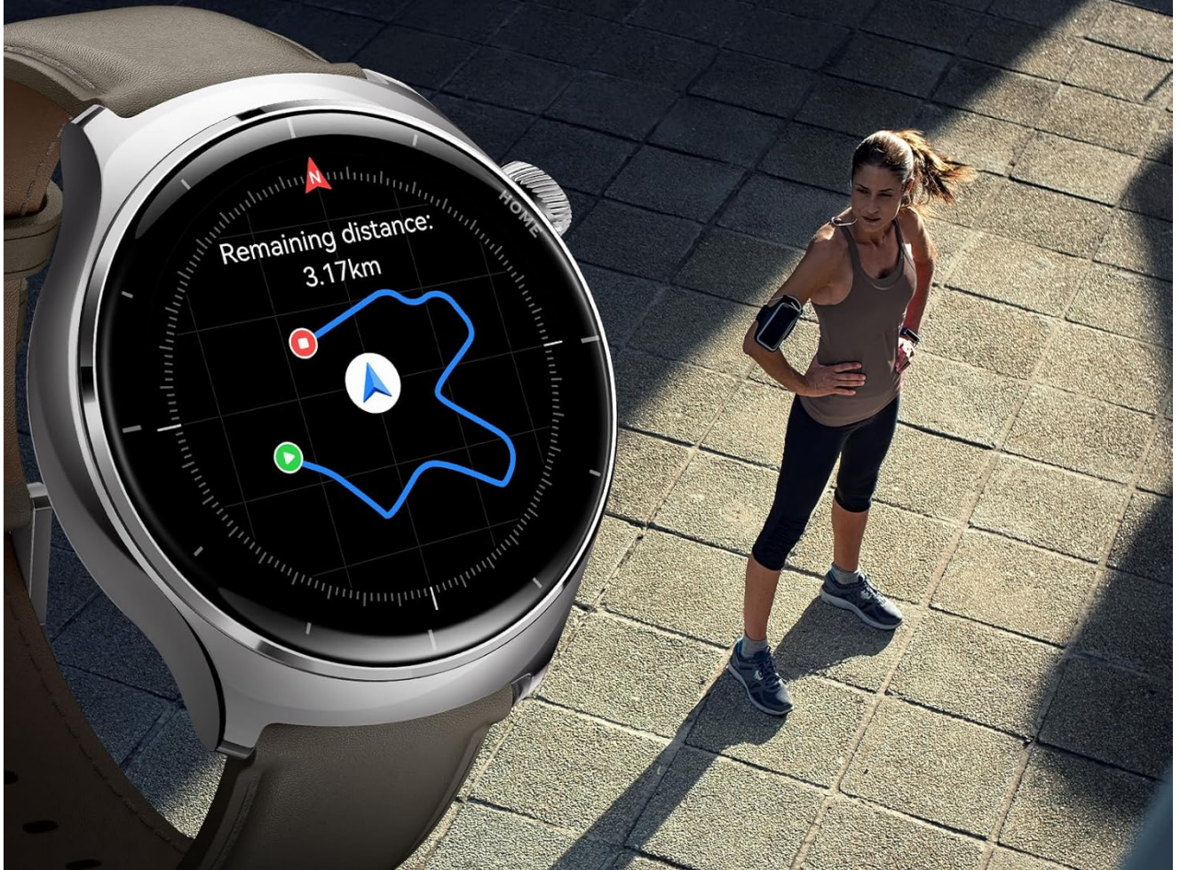
Image: A Mibro Lite3 Pro smartwatch showing a GPS route map on its display, with a person standing outdoors in the background, indicating global navigation system support.