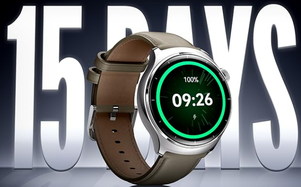
Image: A graphic illustrating the battery life of the Mibro Lite3 Pro, highlighting 15 days of normal use, 50 days in basic mode, and 15 hours in GPS mode.