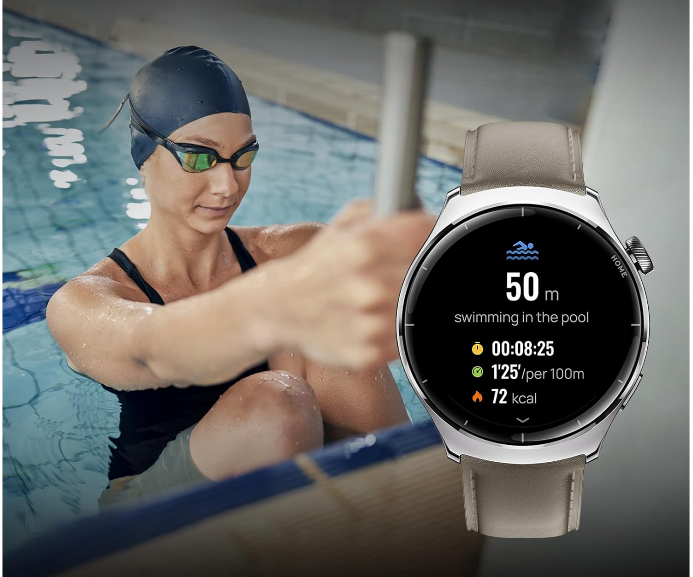
Image: A Mibro Lite3 Pro smartwatch showing swimming metrics, with a swimmer in a pool in the background, demonstrating its 5ATM water resistance.