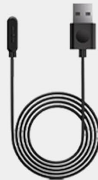
Caricatore magnetico x1

Image: Contents of the Mibro Lite3 Pro package, including the smartwatch with a leather strap, a silicone strap, a user manual, and a magnetic charger.