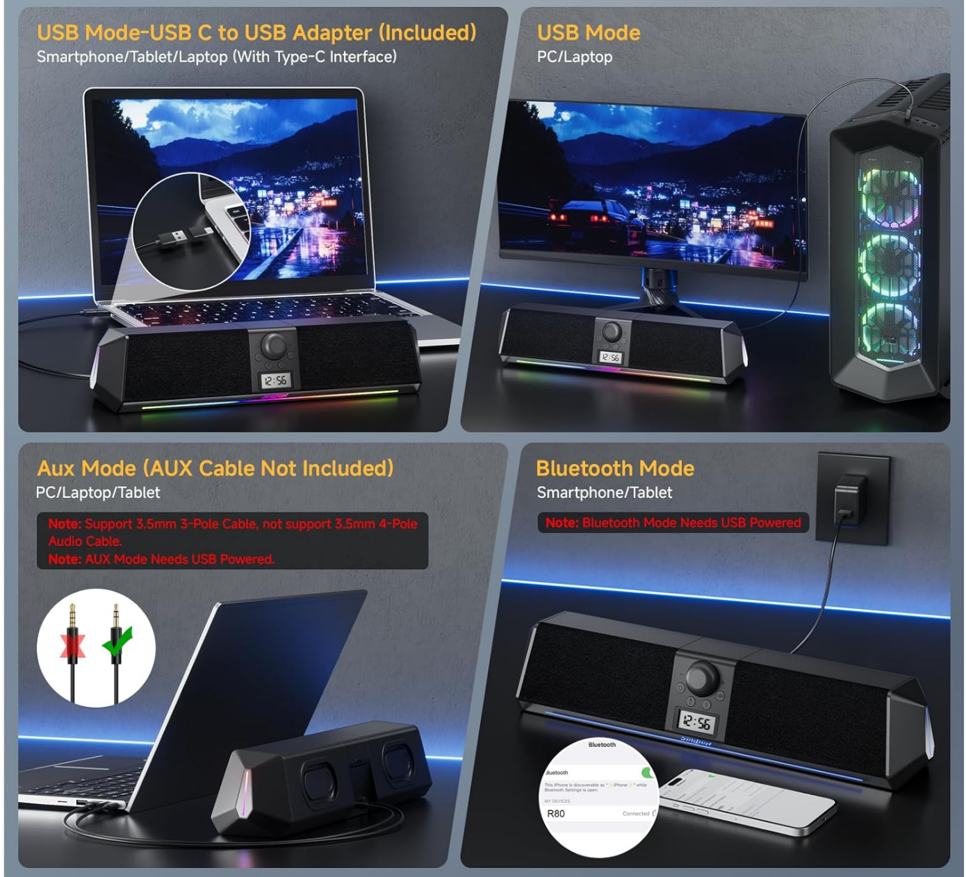
Image 5.2: Various connection methods for the SOULION R80 speaker.