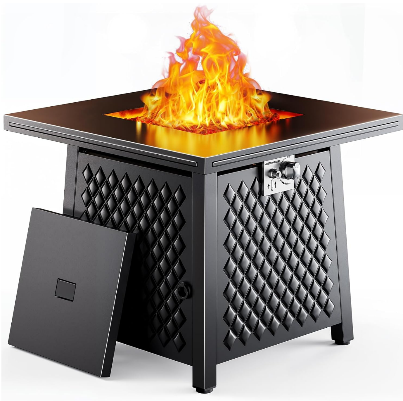
Image: The Ciays 32 Inch Propane Fire Pit, showcasing its square design and active flames, with the control knob visible on the side.