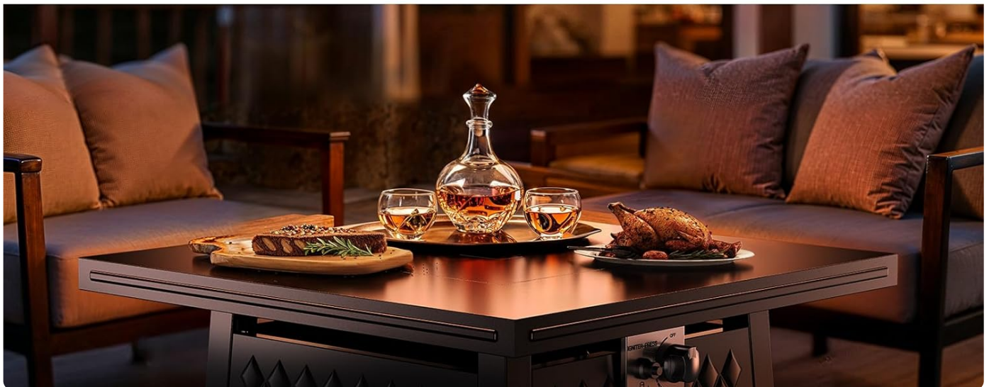
Image: The Ciays fire pit demonstrating its dual functionality: as a fire pit with active flames and as a coffee table when the lid is placed over the burner area.