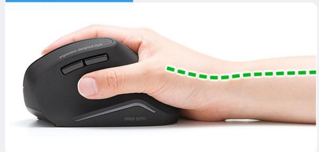
Figure 2: Ergonomic Vertical Design for Natural Hand Position