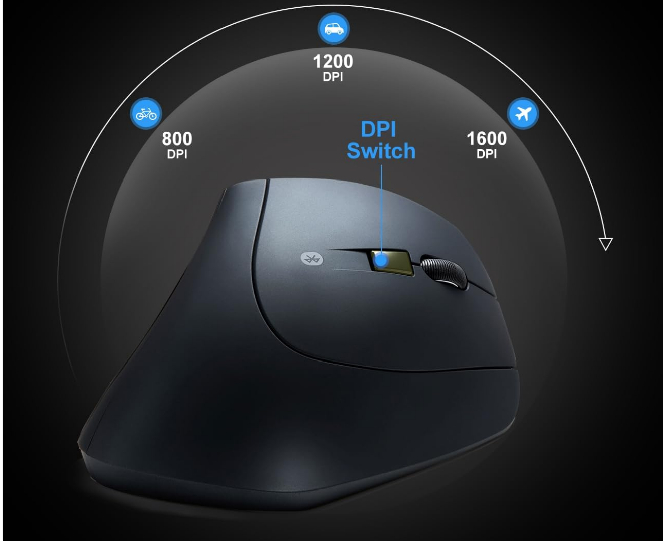
Figure 4: Adjustable DPI Settings