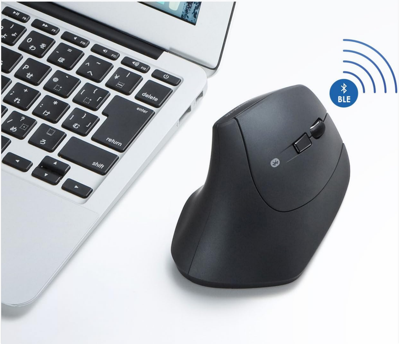
Figure 7: Bluetooth Connection

22.8ft work distance, stable data transmission