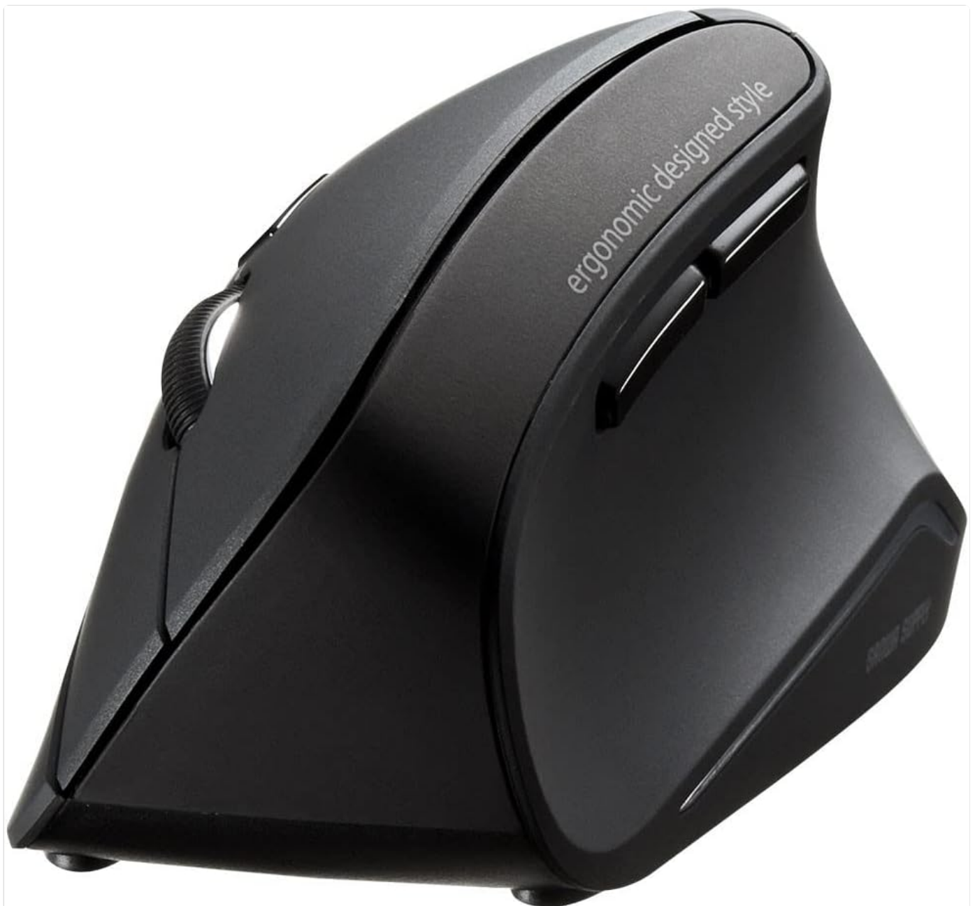
Figure 1: SANWA Bluetooth Ergonomic Mouse