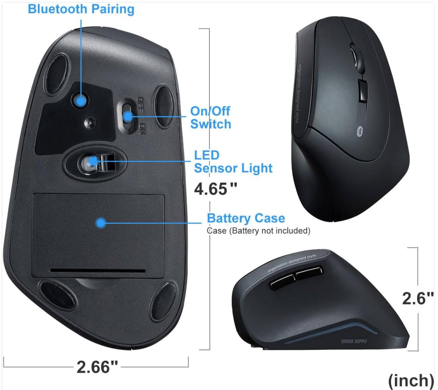
Figure 8: Mouse Underside with Battery Case and Switches