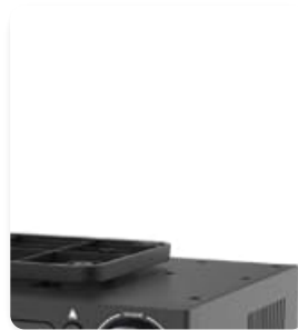
Figure 11: Step 2 - Securing the mounting plate to the cabinet.