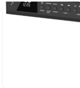
Figure 12: Step 3 - Sliding the CD player onto the mounting plate.