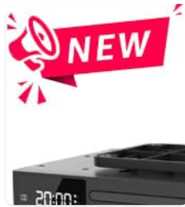
Figure 10: Step 1 - Attaching the mounting plate to the top of the CD player.