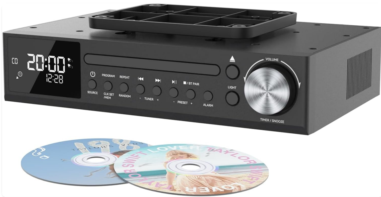
Figure 1: MONODEAL K105 Under Cabinet CD Player with included accessories.

The MONODEAL K105 is a versatile under-cabinet music system designed for kitchen environments, offering multiple audio playback options and convenient features. It integrates a CD player, FM radio, Bluetooth connectivity, and practical additions like an LED kitchen light, kitchen timer, and dual alarm clock.