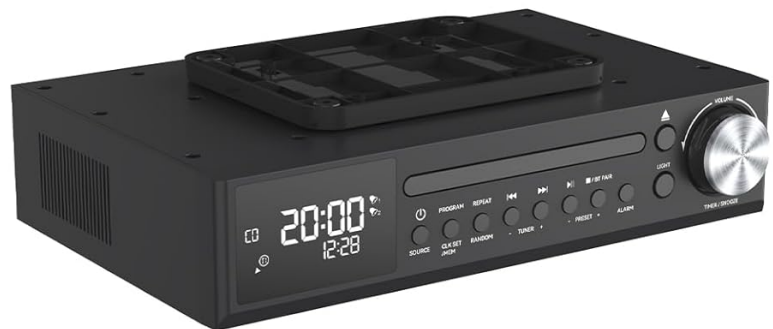
Figure 4: Energy-saving LED light to enhance the kitchen workspace.

Train to cook with the help of timer function