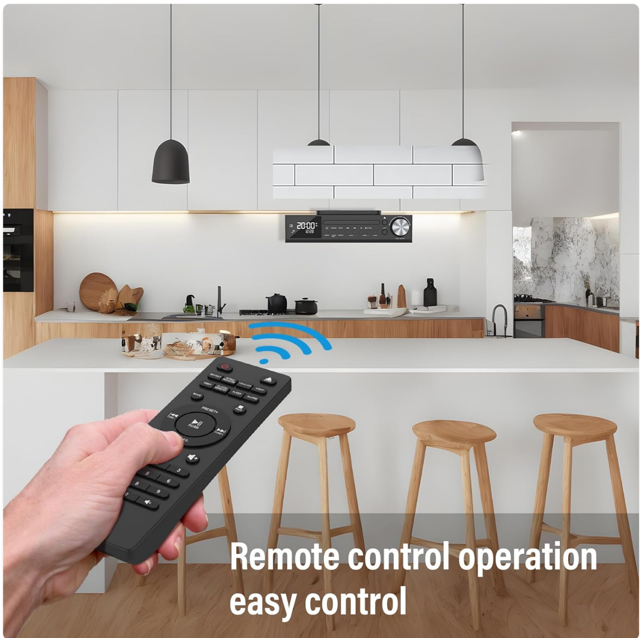
Figure 5: Remote control operation for easy command of the unit.