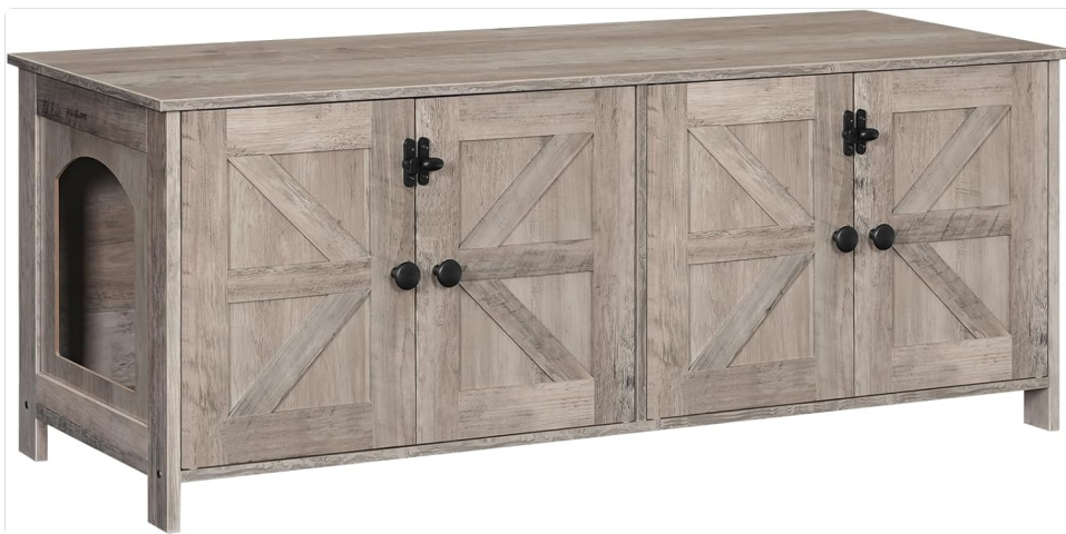
A complete view of the assembled enclosure, showcasing its design and finish.