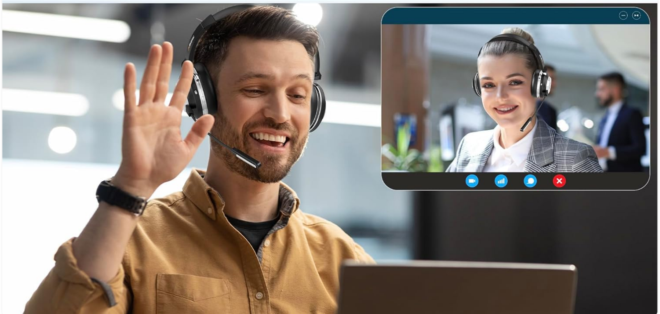
Image: A user wearing the headset, demonstrating its use in a busy office environment, highlighting the AI noise cancellation feature.