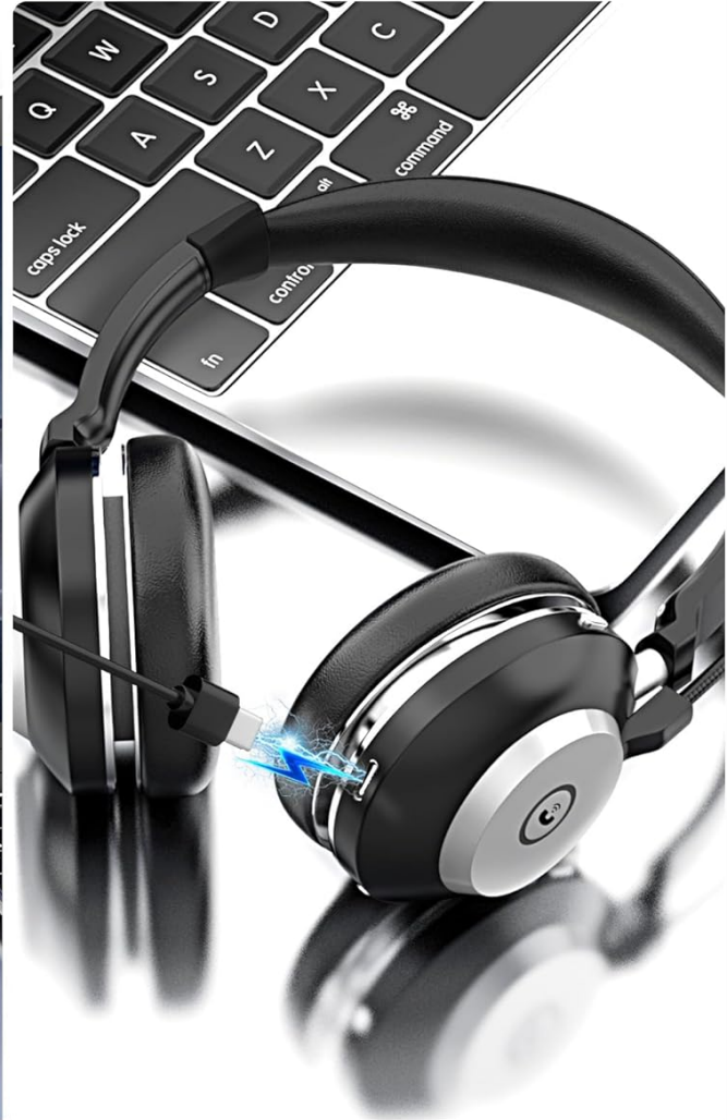
Type-C Cable Charging Mode

Image: Two charging methods for the headset are shown: one side depicts the headset charging on its dedicated base, while the other shows it charging directly with a Type-C cable.