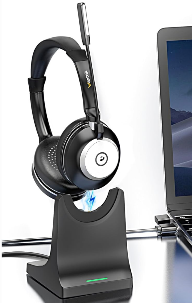
Base Charging Mode