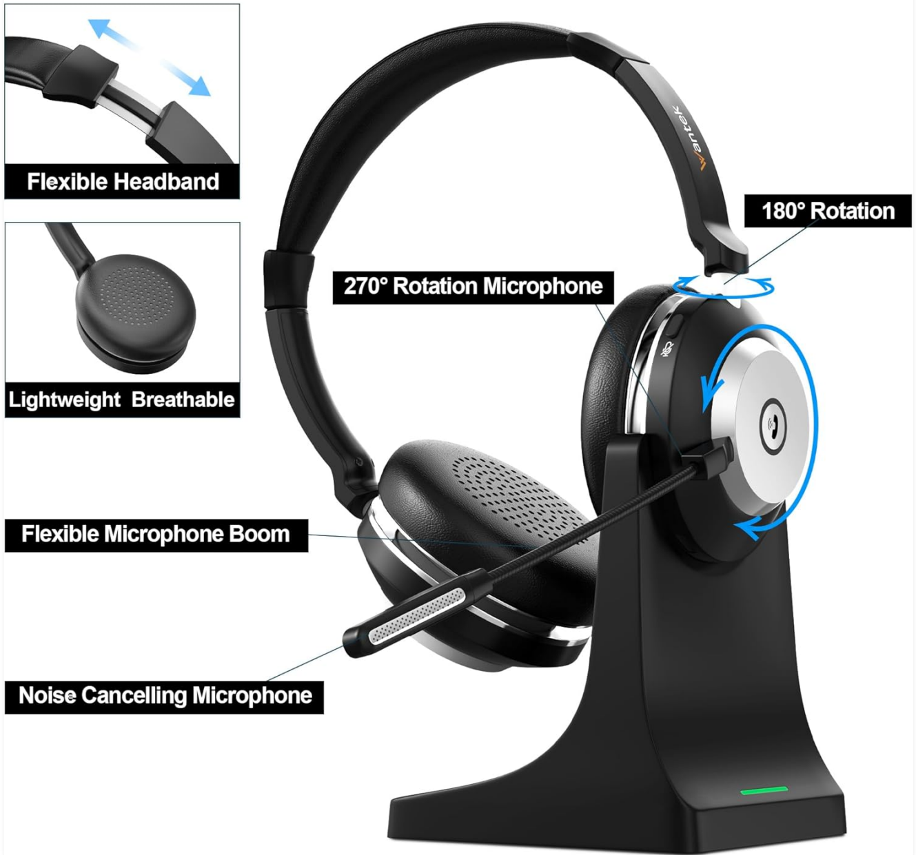
Image: A detailed view of the headset highlighting its ergonomic features, including a flexible headband, lightweight breathable ear cushions, and a 270° rotatable noise-cancelling microphone boom.