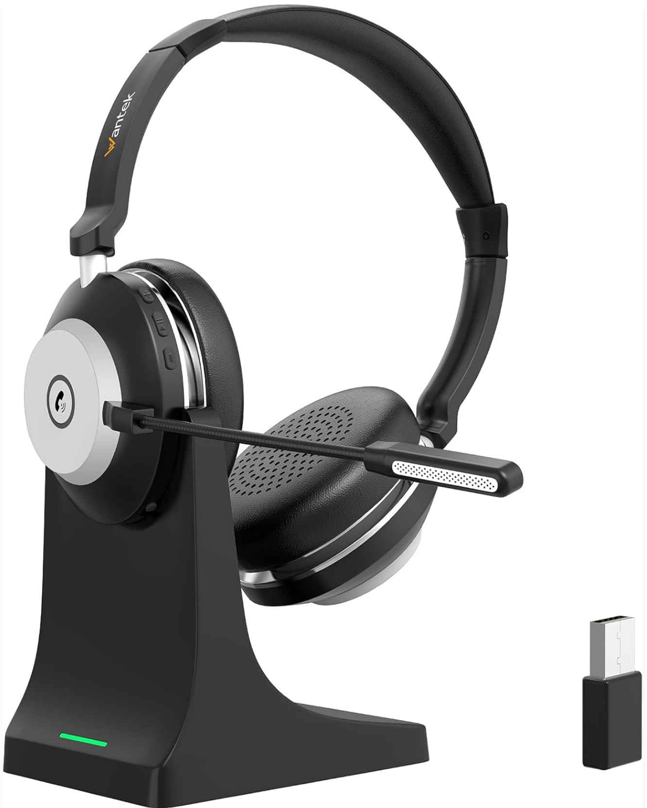
Image: The Wantek Wireless Headset, its dedicated charging base, and the USB dongle, as typically found in the product packaging.