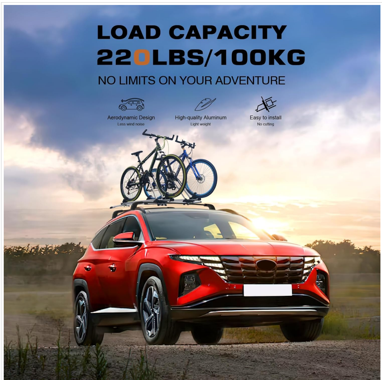
Figure 4: The cross bars can safely carry up to 220 lbs (100 kg) of cargo, such as bicycles.