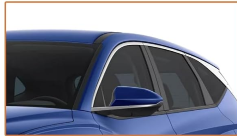
Figure 2: Ensure your Hyundai Tucson has flush side rails for proper installation.