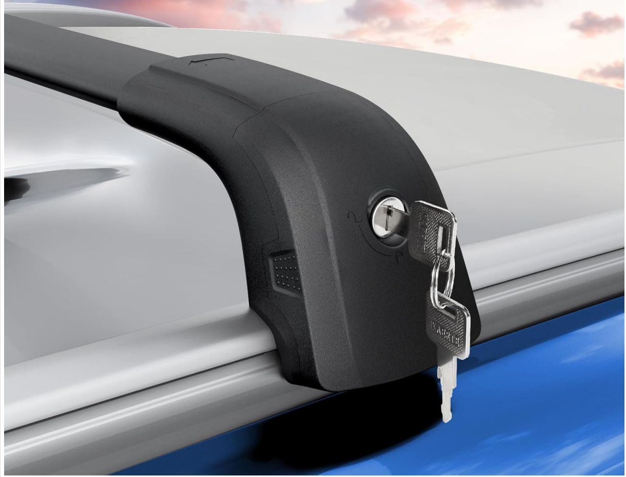
Figure 3: The metal locking mechanism provides enhanced security for the cross bars.