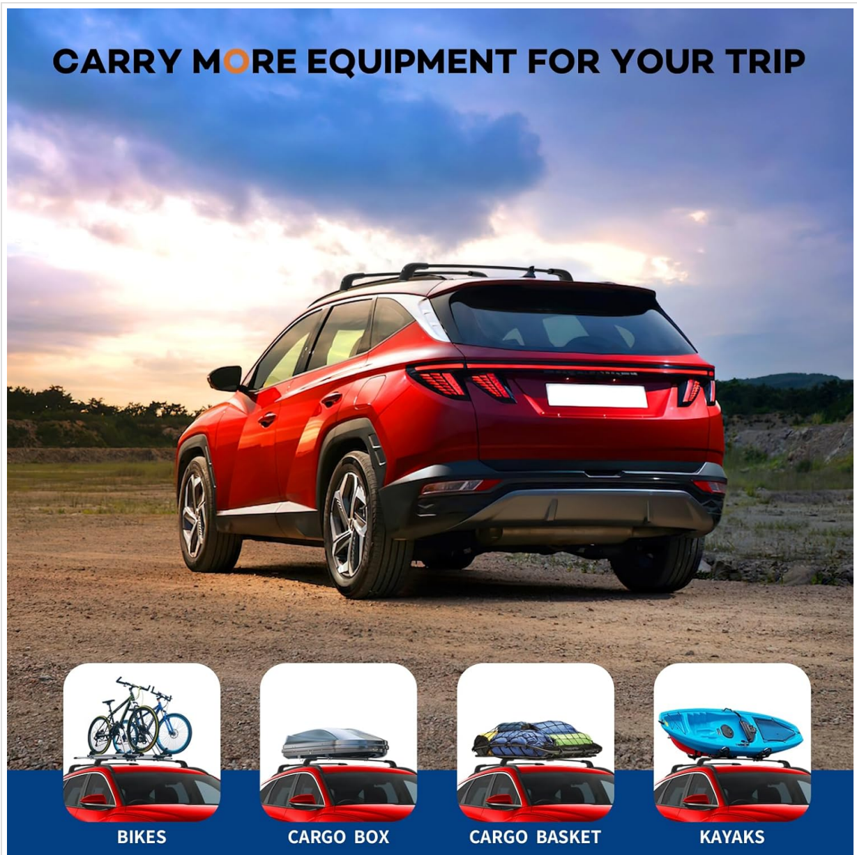
Figure 1: Included components for the Wonderdriver Roof Rack Cross Bars.