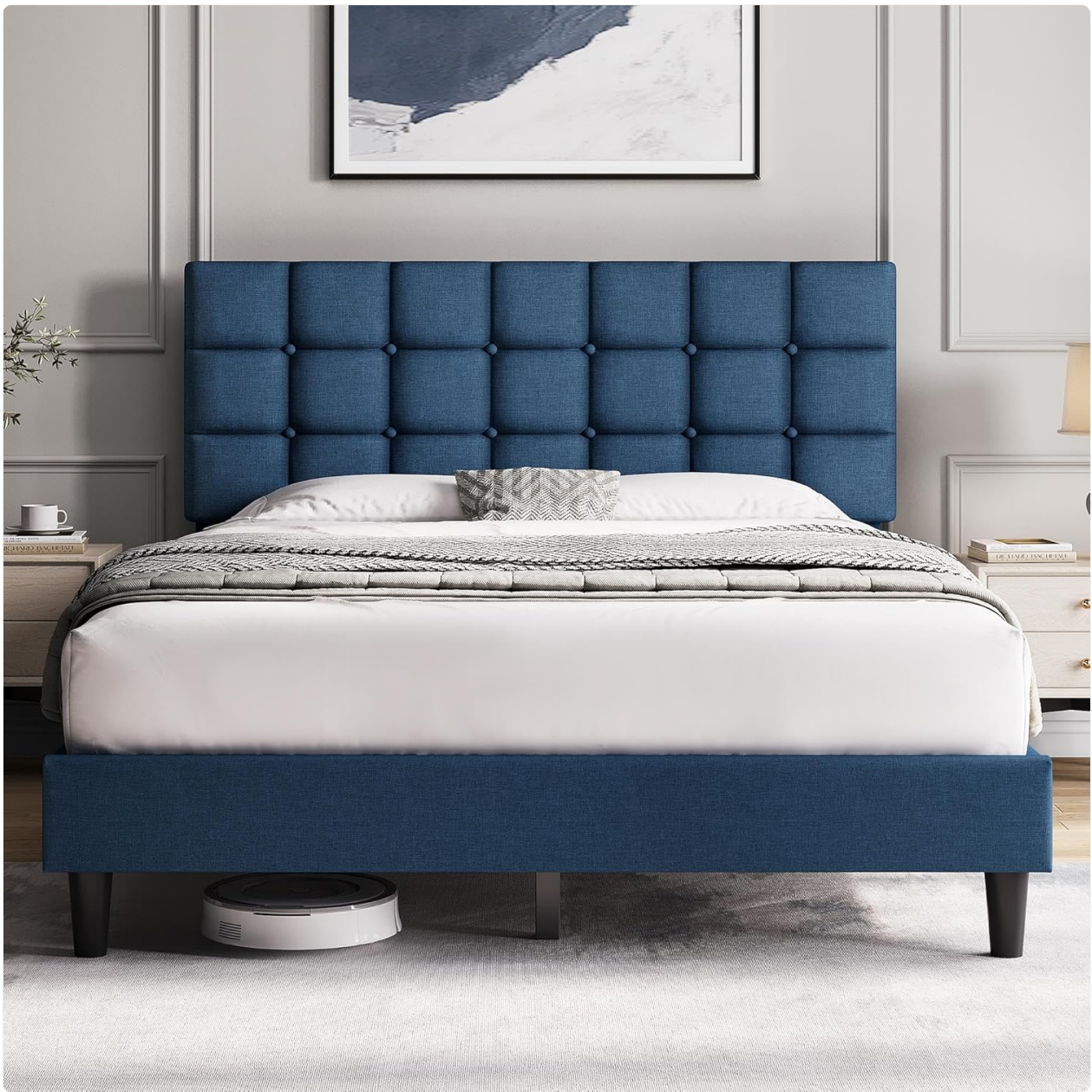
Figure 1.1: Fully assembled Yaheetech Upholstered Bed Frame in Navy Blue.