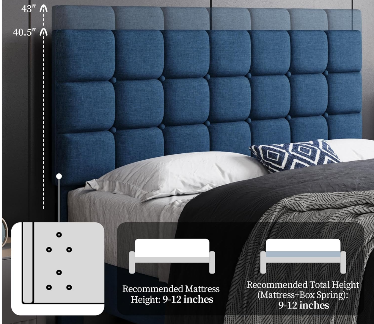
Figure 2.2: Illustration of the headboard's height adjustment options (41" and 43").