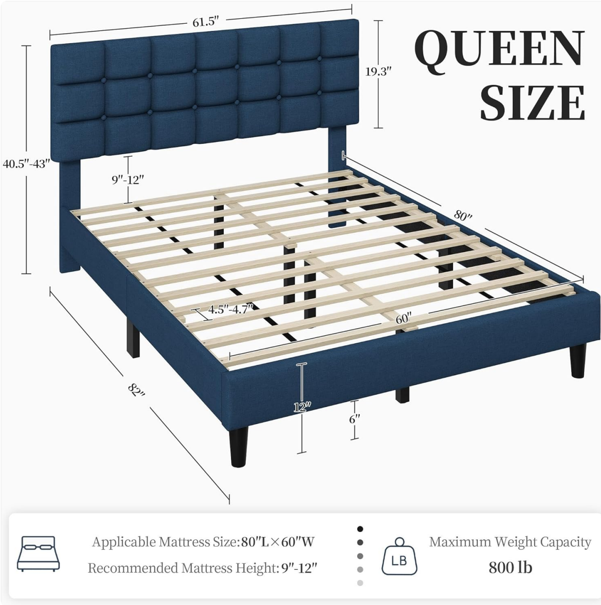
Figure 3.1: Overview of bed frame dimensions and key assembly points.

Follow the step-by-step instructions provided in the included Installation Manual. Ensure all screws and fasteners are tightened securely, but do not overtighten to avoid damaging the materials.