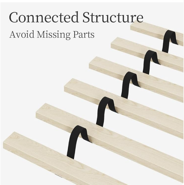
Figure 2.3: The robust wooden slat system and multi-support legs providing strong foundation.