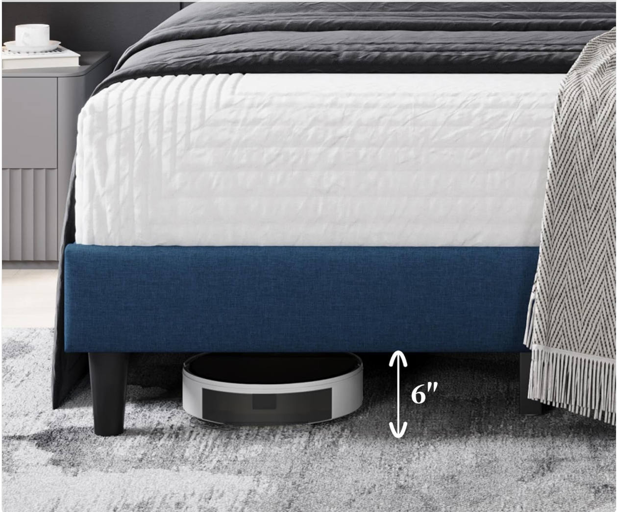
Figure 2.5: The 6-inch ground clearance allows for easy cleaning underneath the bed frame.

6" ground clearance allows robot cleaner to pass freely.