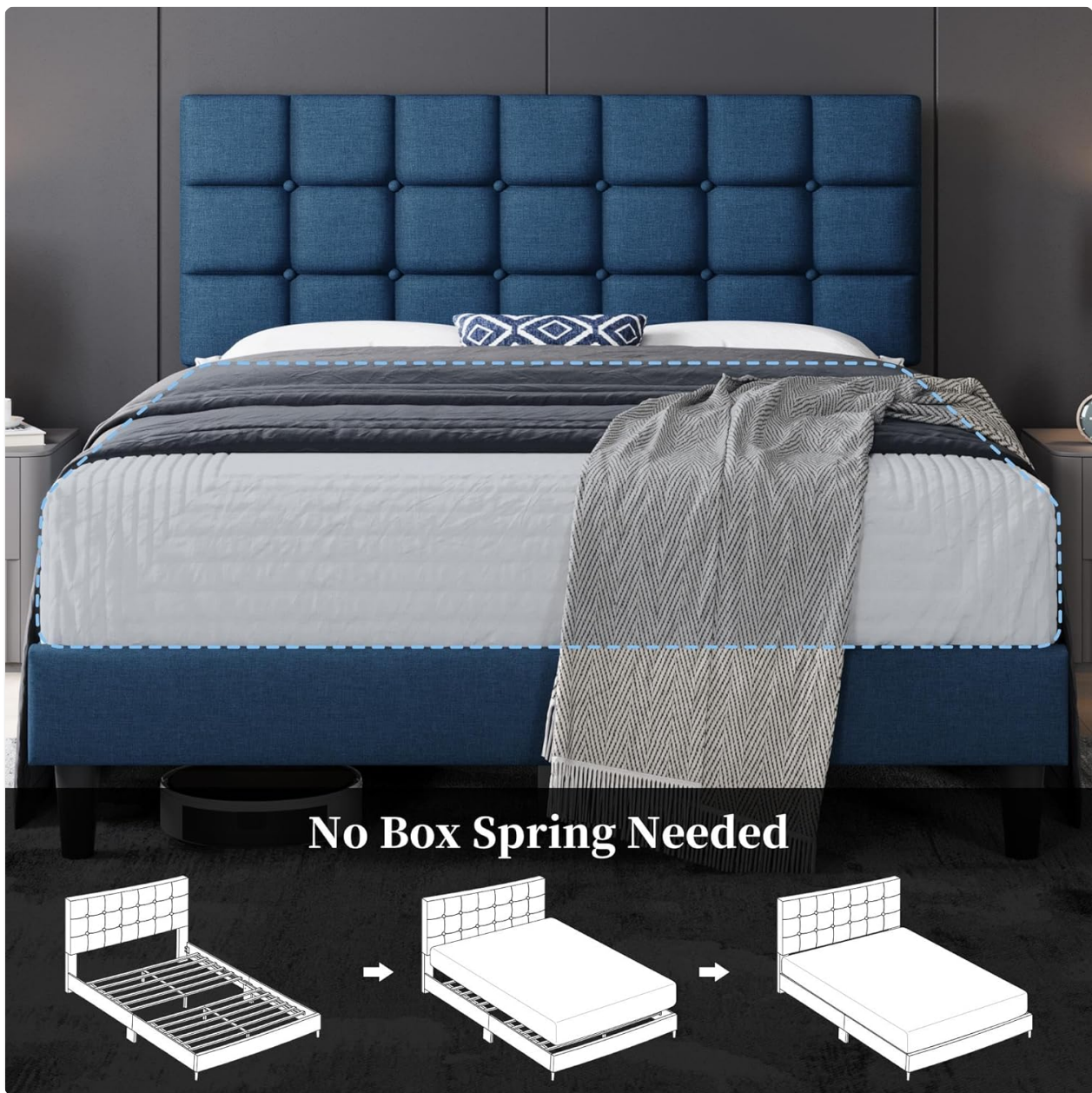
Figure 2.4: The bed frame's design eliminates the need for a box spring, simplifying mattress setup.