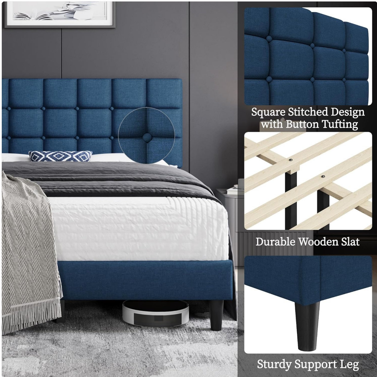
Figure 2.1: Detail of the square stitched and button tufted headboard design.