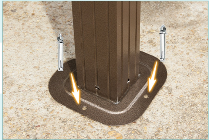
Figure 4.4: The anchor base ensures secure attachment to the ground for enhanced stability.