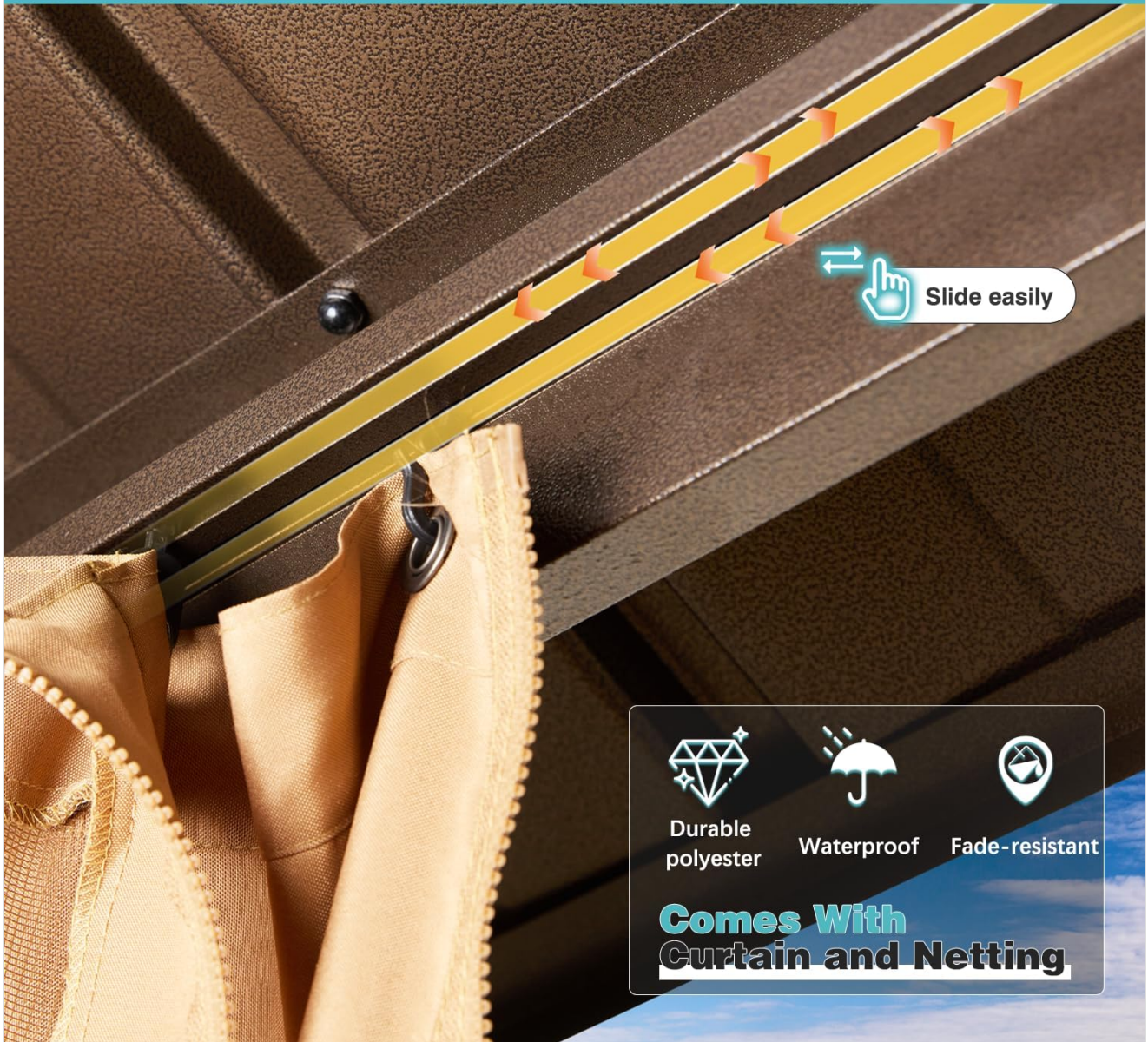
Figure 5.1: The dual track design allows for smooth operation of the curtains and netting.