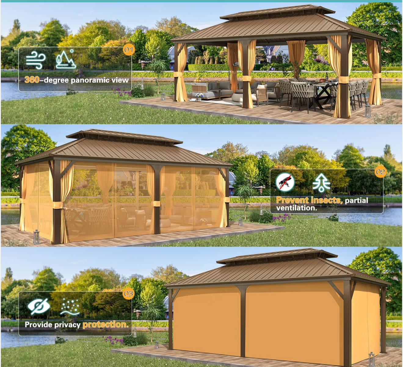
Figure 5.2: The detachable curtains and netting offer flexible options for privacy and airflow.