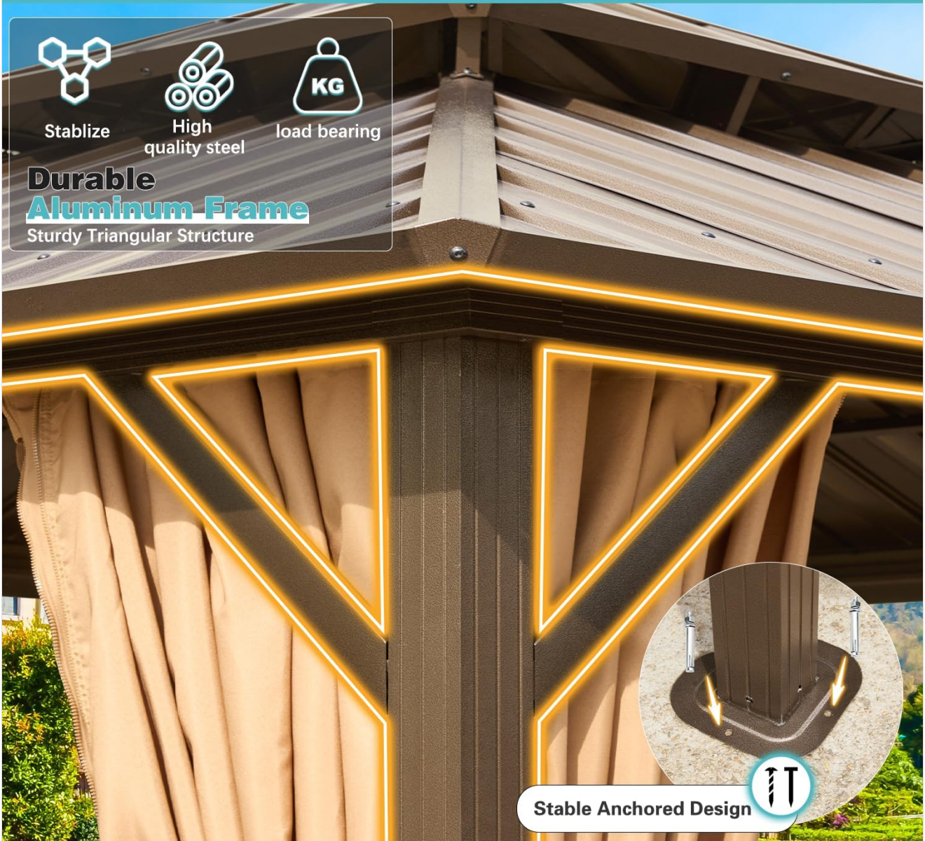
Figure 4.2: Detail of the durable aluminum frame and sturdy triangular structure, designed for stability.