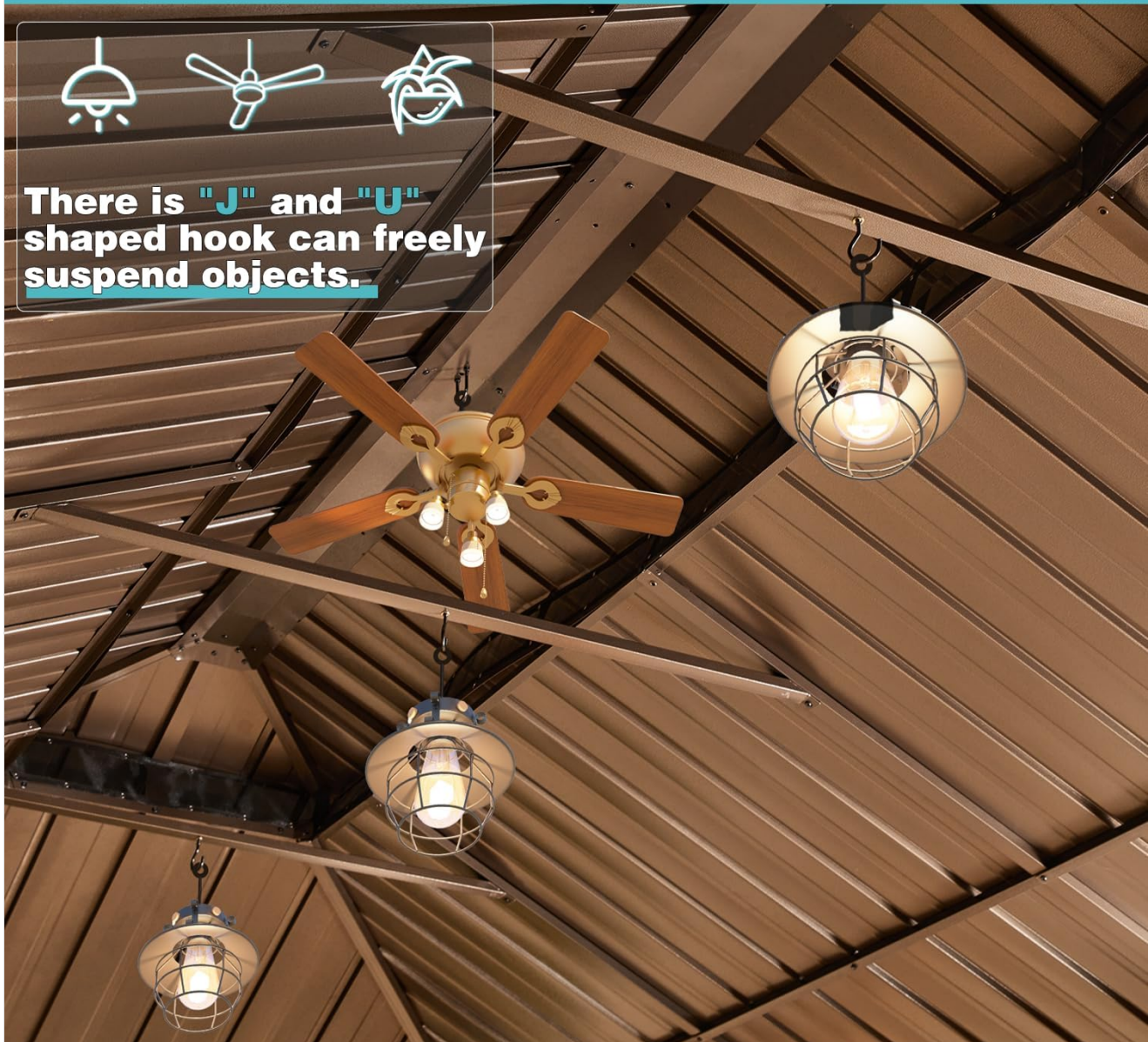
Figure 5.3: Integrated hooks provide options for hanging fans or lighting fixtures.