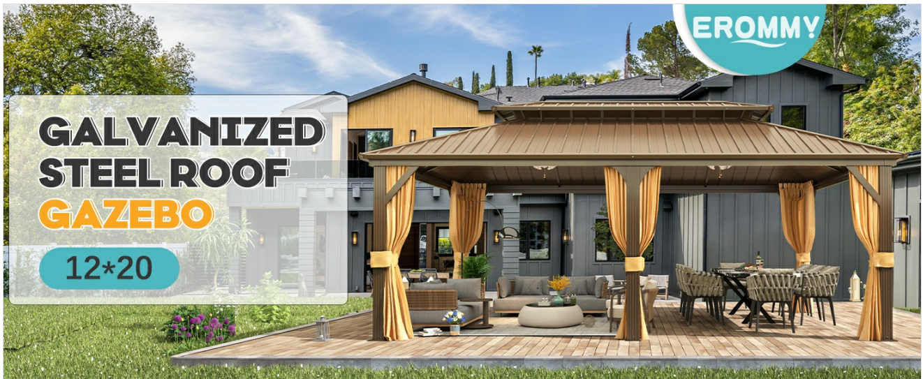
Figure 4.1: Overall view of the EROMMY 12'x20' Gazebo with key dimensions and features highlighted.

The EROMMY gazebo manual includes detailed picture examples to guide you through the assembly process. With 2-3 people, assembly typically takes approximately 3 hours. Follow the steps outlined in the provided manual carefully.