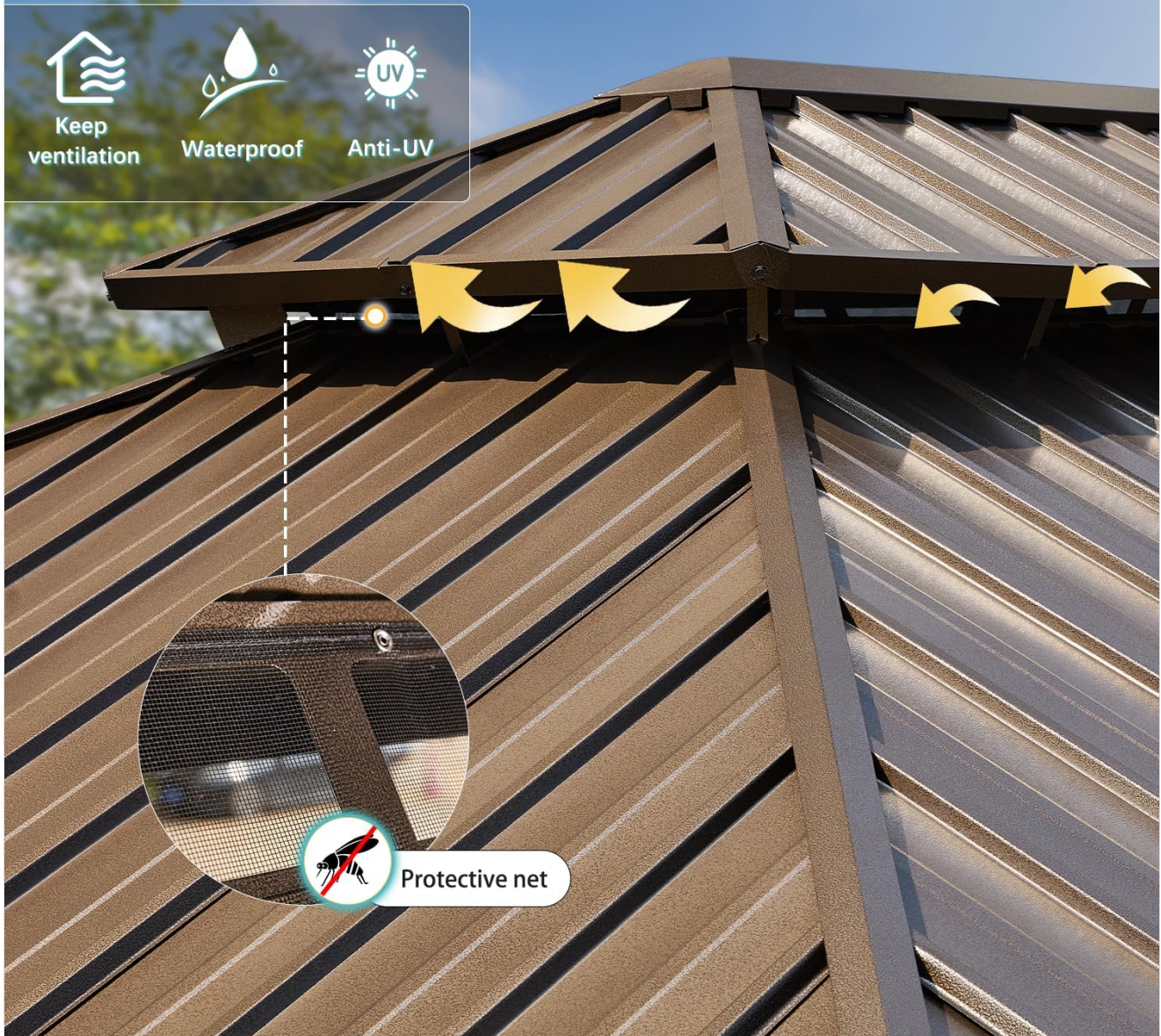
Figure 4.3: The galvanized steel double roof features mesh screens for ventilation and insect protection.