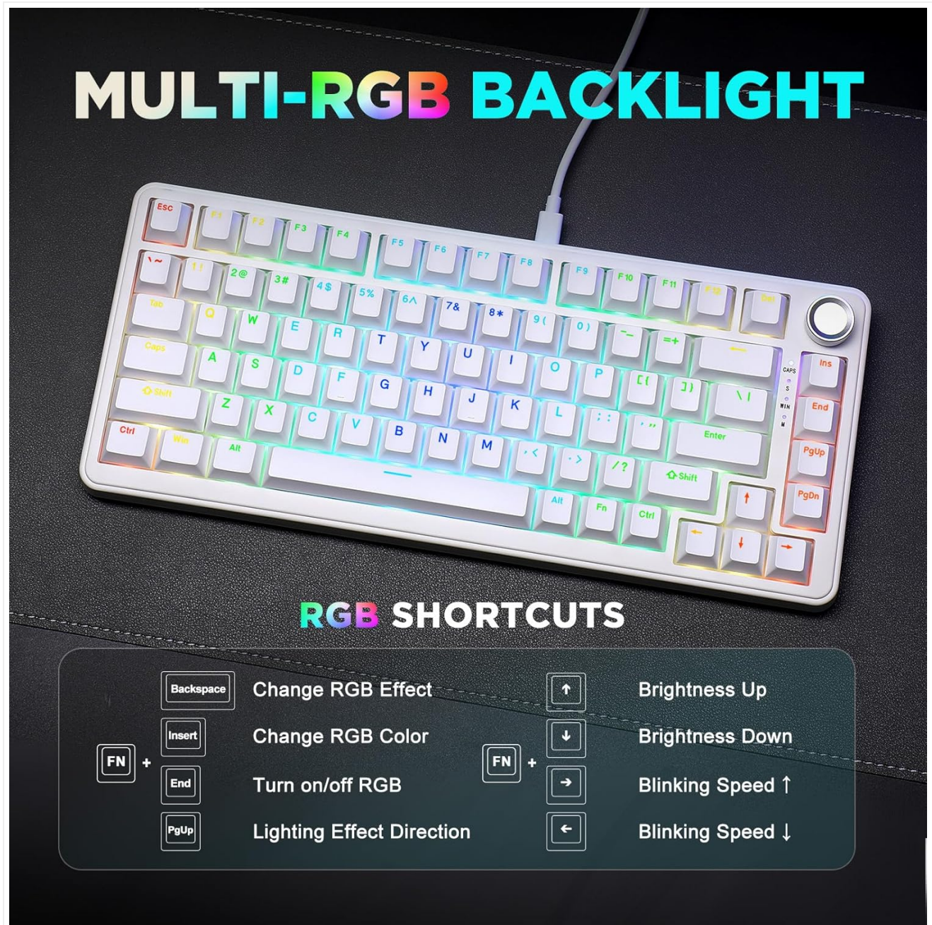
Figure 5.2: RGB Shortcuts