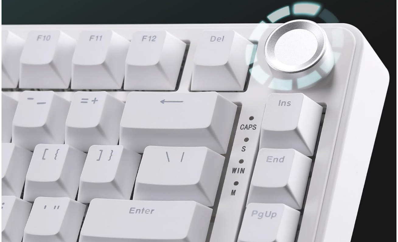
Figure 5.1: Knob Control Functions