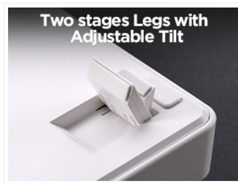
Figure 4.2: Adjustable Tilt Legs

The keyboard features dual-stage adjustable tilt legs on the underside. Gently pull out the legs to set your preferred typing angle for ergonomic comfort.