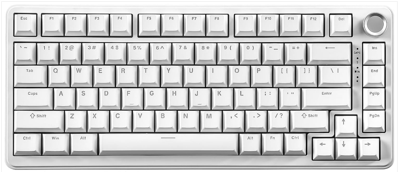
Figure 1.1: YUNZII B75 Mechanical Keyboard (White, Blue Grey Tactile Switch)

This manual provides detailed instructions for the setup, operation, maintenance, and troubleshooting of your YUNZII B75 Mechanical Keyboard. Please read this manual thoroughly before using the product to ensure proper functionality and to maximize your user experience.