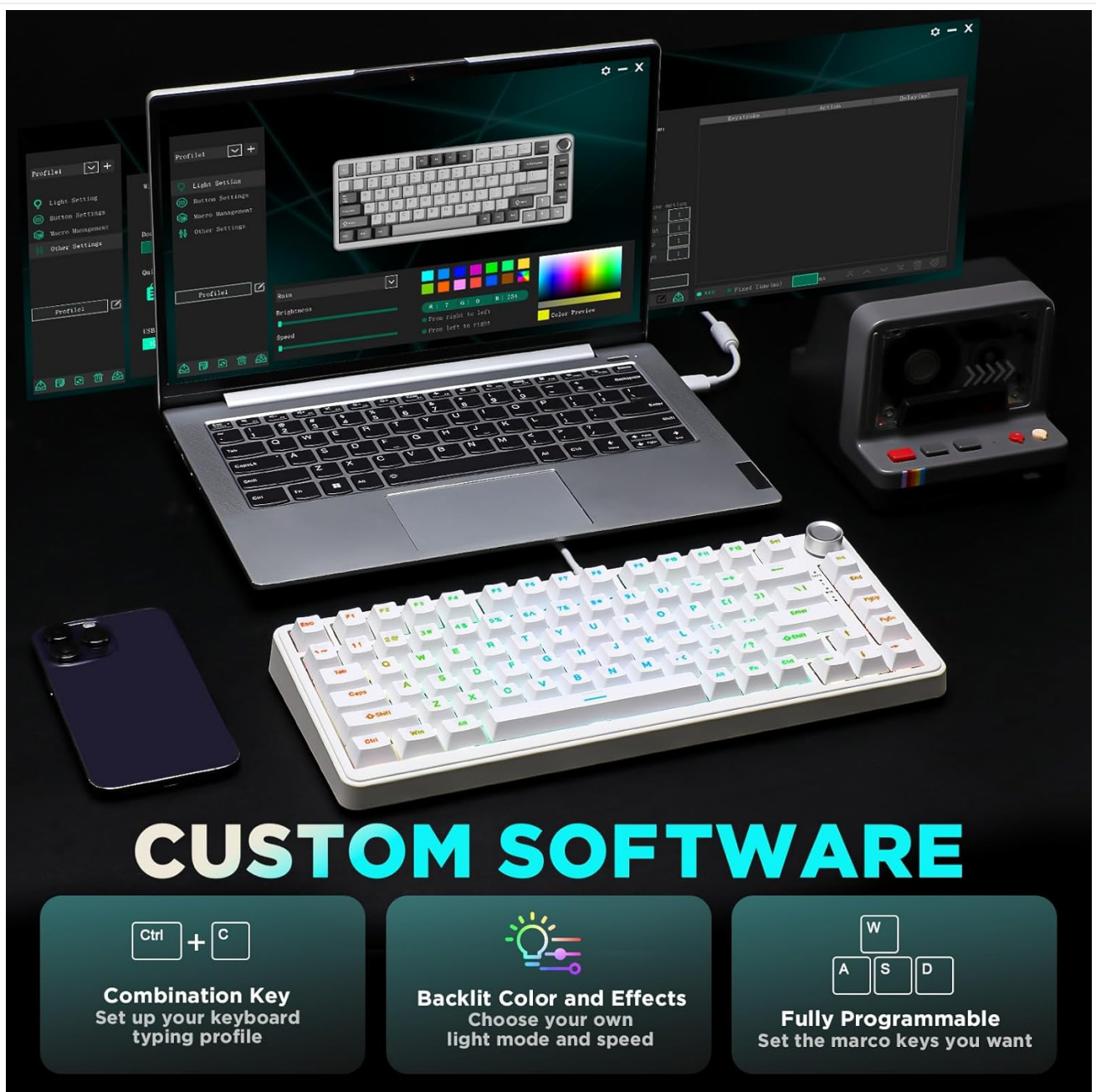
Figure 5.4: Custom Software Interface