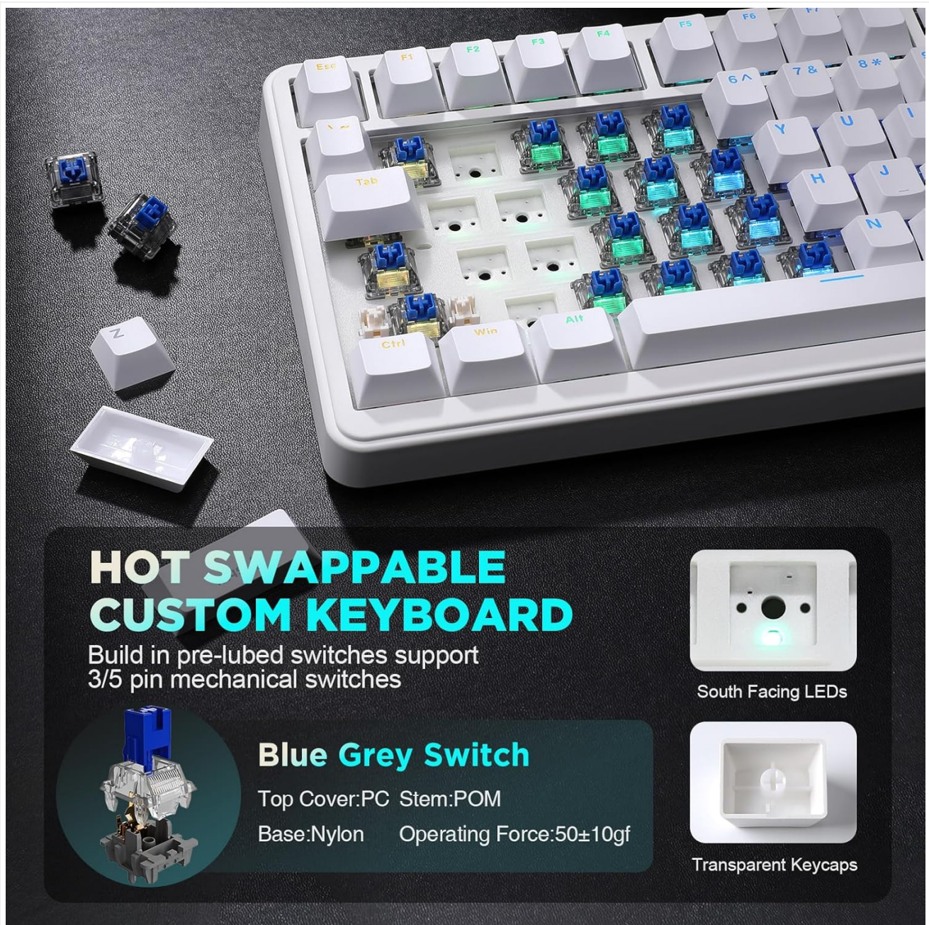
Figure 6.1: Hot-Swappable Switches