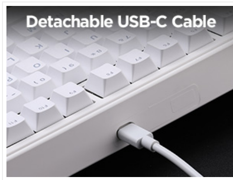
Figure 4.1: Detachable USB-C Cable Connection