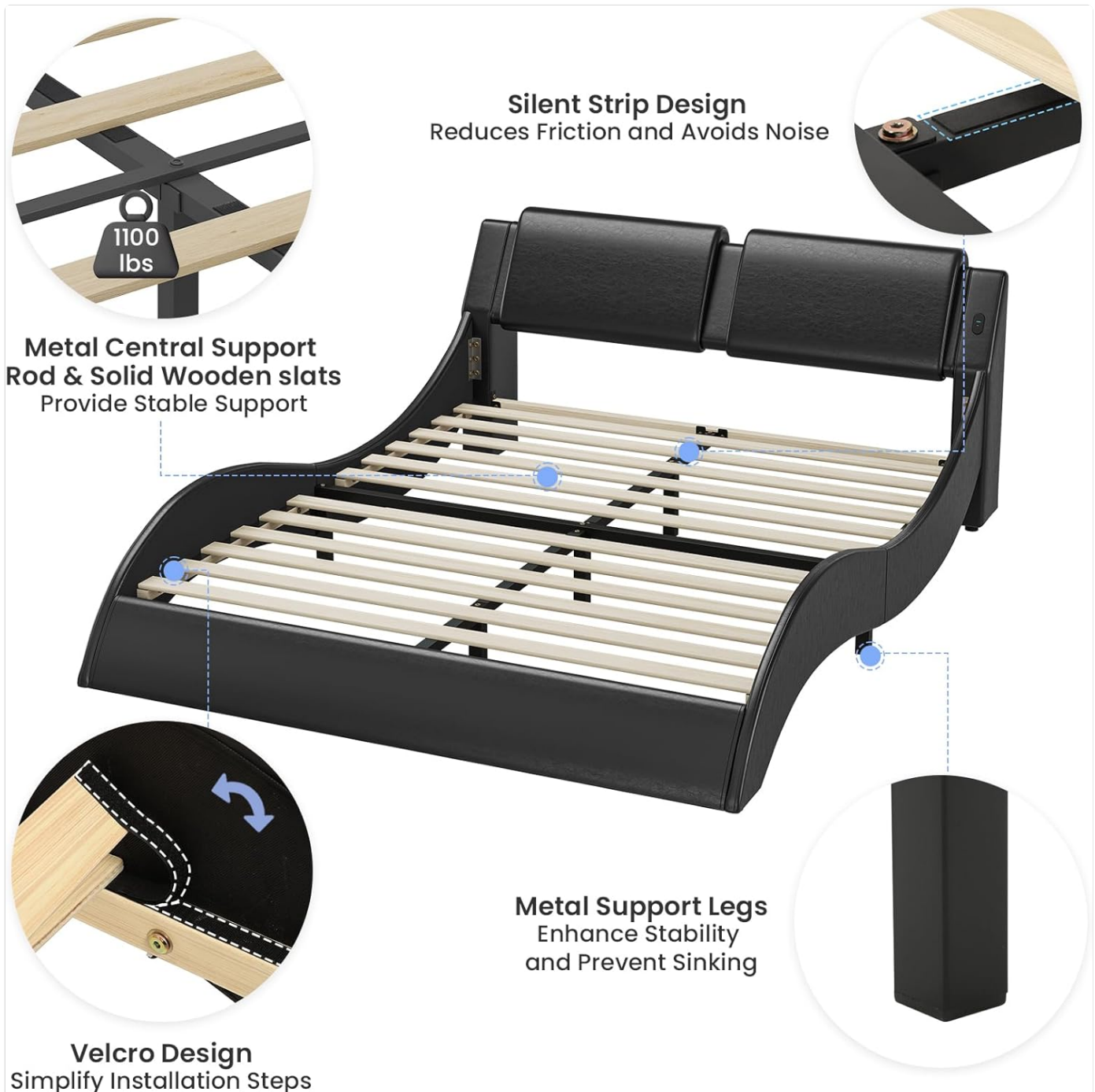
Figure 5.1: Overview of the bed frame's sturdy construction and key assembly points, including metal central support rod, solid wooden slats, and metal support legs.

Your browser does not support the video tag.