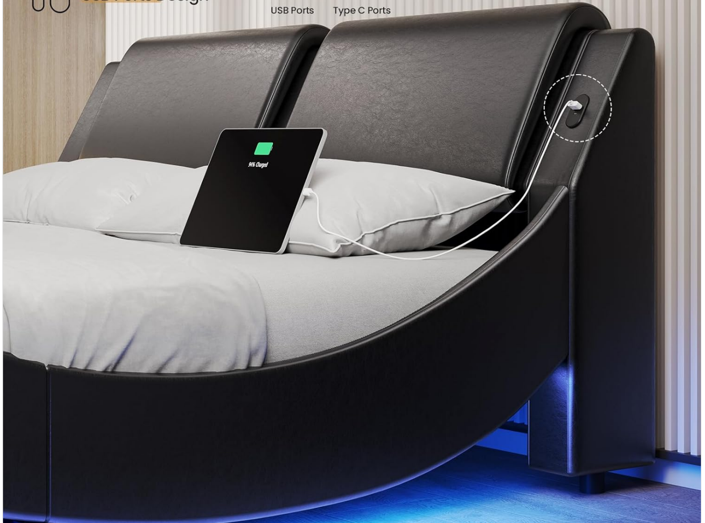
Figure 4.2: Headboard featuring integrated USB and Type-C charging ports.