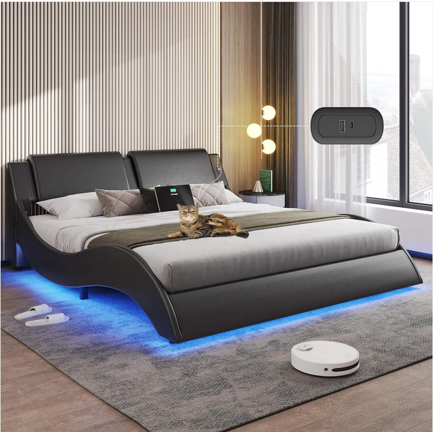
Figure 1.1: DICTAC Queen Bed Frame with LED lights and charging ports.