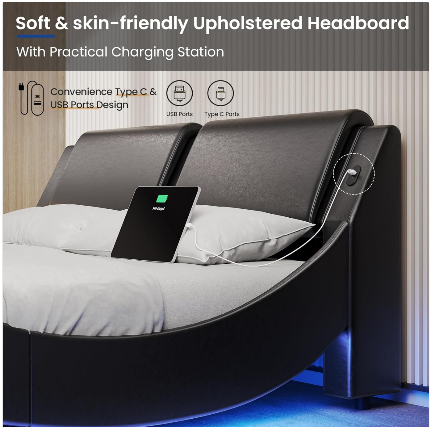
Figure 6.2: Close-up of the headboard showing the integrated USB and Type-C charging ports.