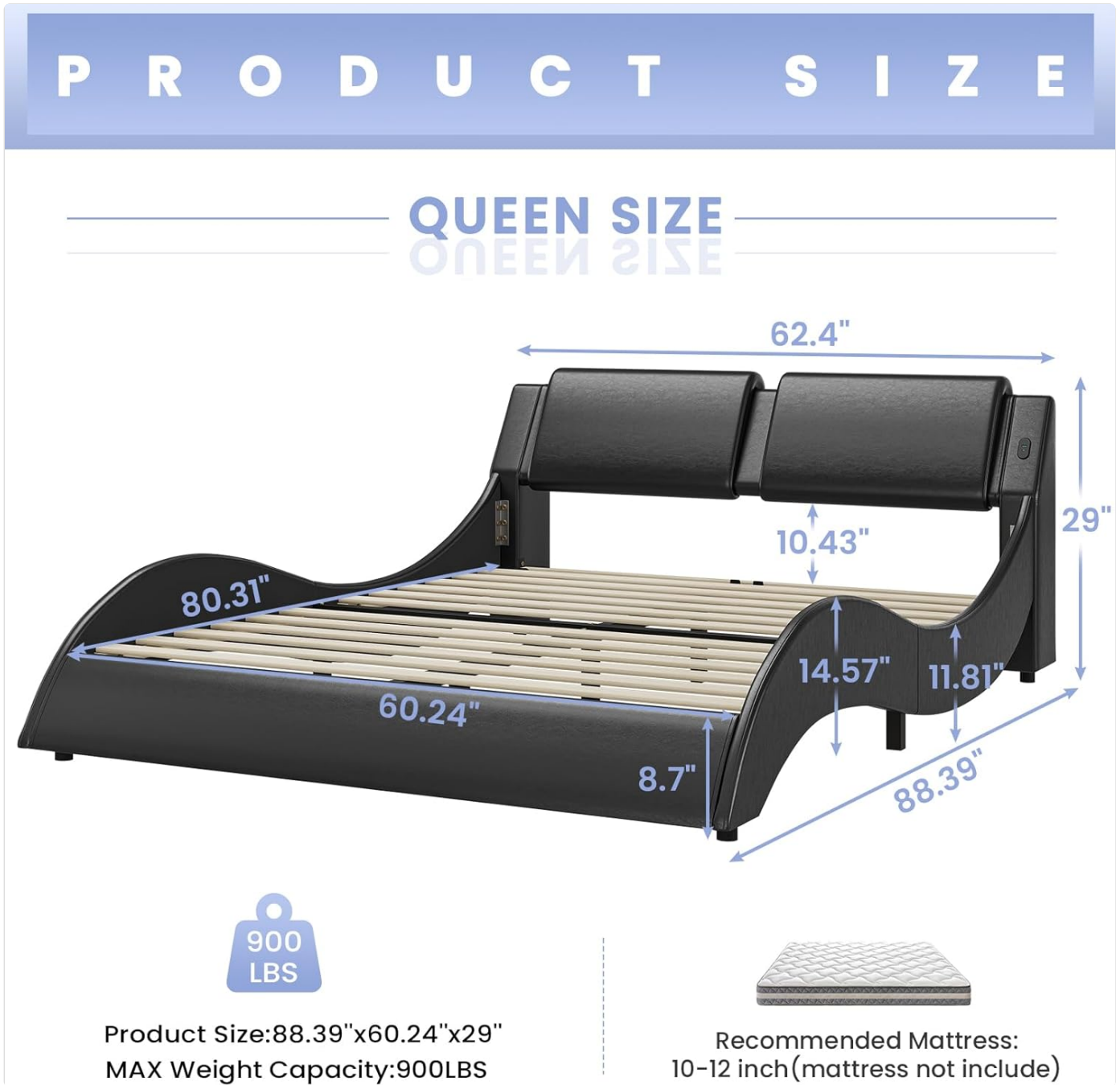
Figure 9.1: Detailed dimensions of the DICTAC Queen Bed Frame.