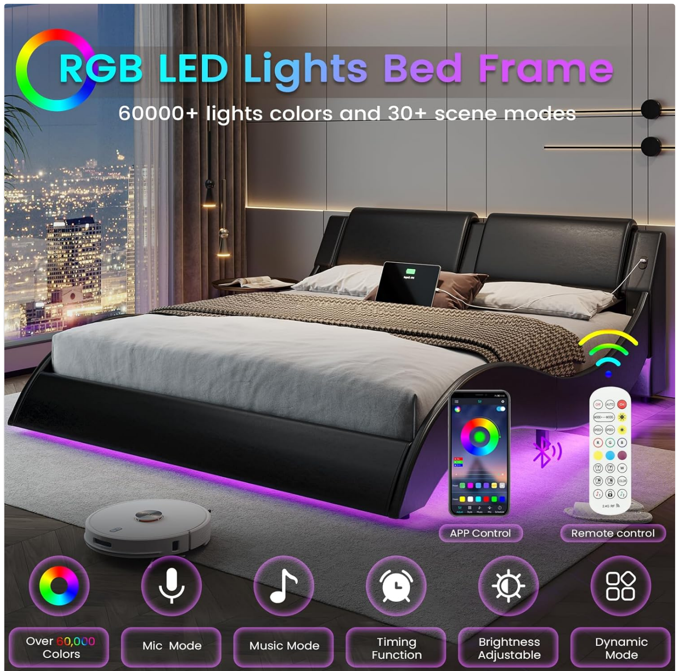
Figure 6.1: Visual representation of LED light control options via remote and smartphone app.