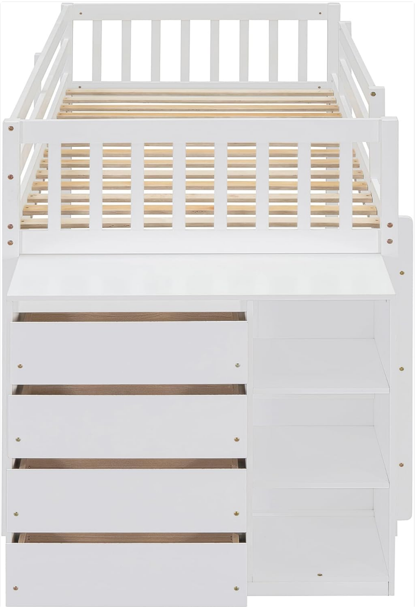
Image: Close-up view of the integrated storage unit, highlighting the four pull-out drawers and three open shelves. This unit provides convenient storage for various items.