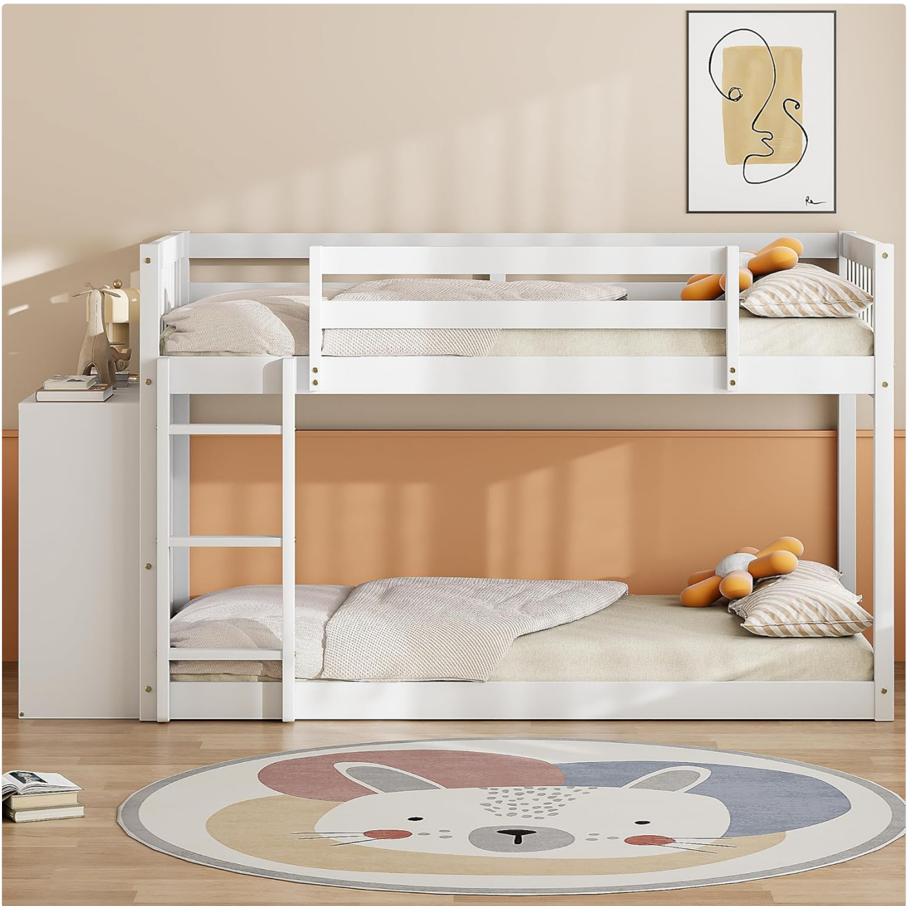
Image: DNYN Twin Over Twin Bunk Bed in a furnished room, demonstrating its space-saving design and aesthetic appeal. The bed is shown with mattresses and bedding.