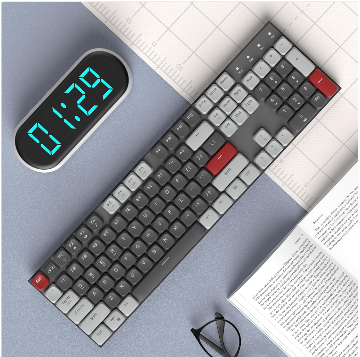
Image: A full-size view of the MageGee Moon104 keyboard, highlighting its 104-key layout including the numeric pad and function row.