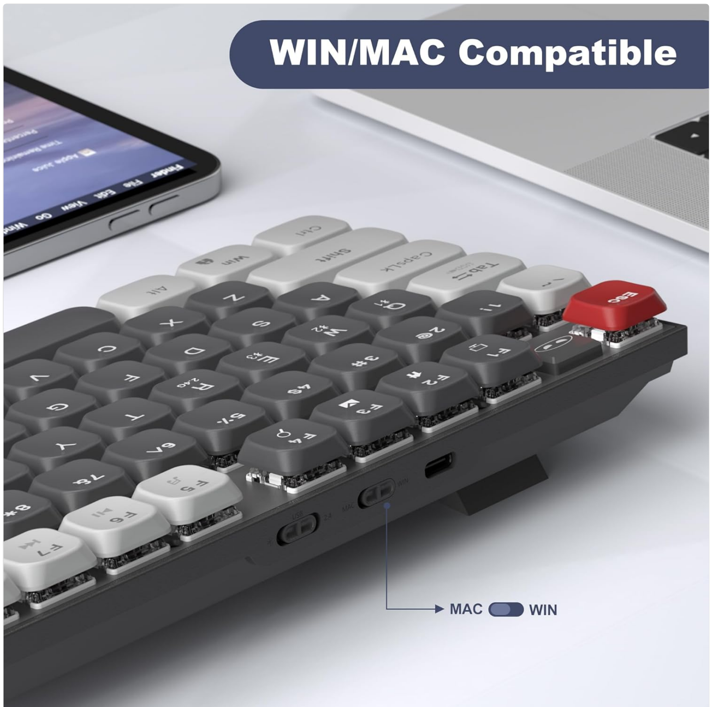
Image: A detailed view of the keyboard's side, showing the physical switch to select between WIN (Windows) and MAC operating system modes.

A dedicated switch on the side of the keyboard allows you to toggle between Windows and Mac compatibility modes for optimal key mapping.