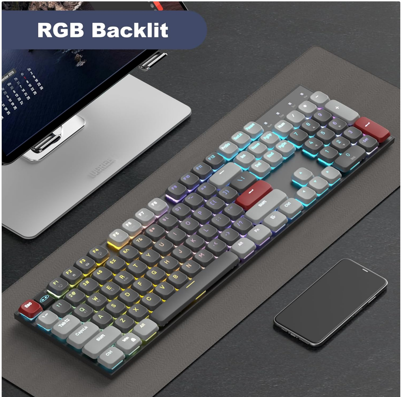
Image: The MageGee Moon104 keyboard displaying its RGB backlighting in a colorful pattern, enhancing visibility in low-light conditions.