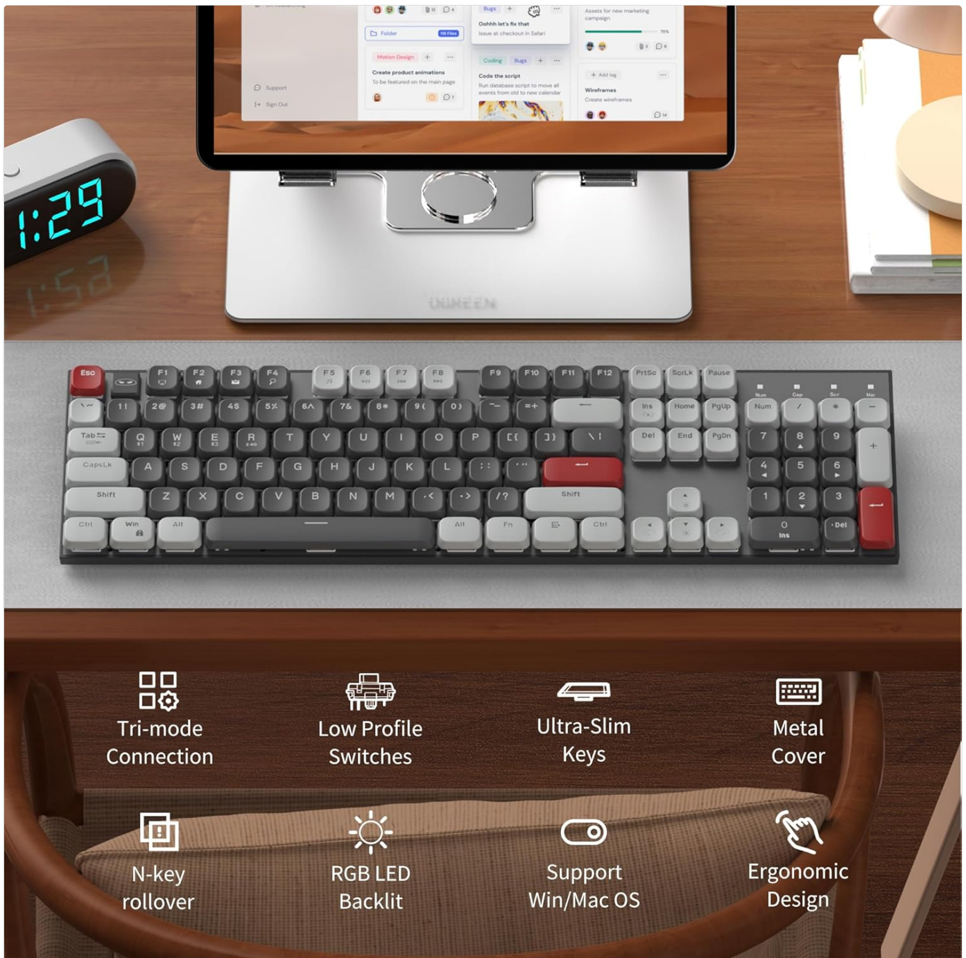
Image: The MageGee Moon104 keyboard in a grey and black color scheme, featuring RGB backlighting, positioned on a desk with a laptop and other office accessories.