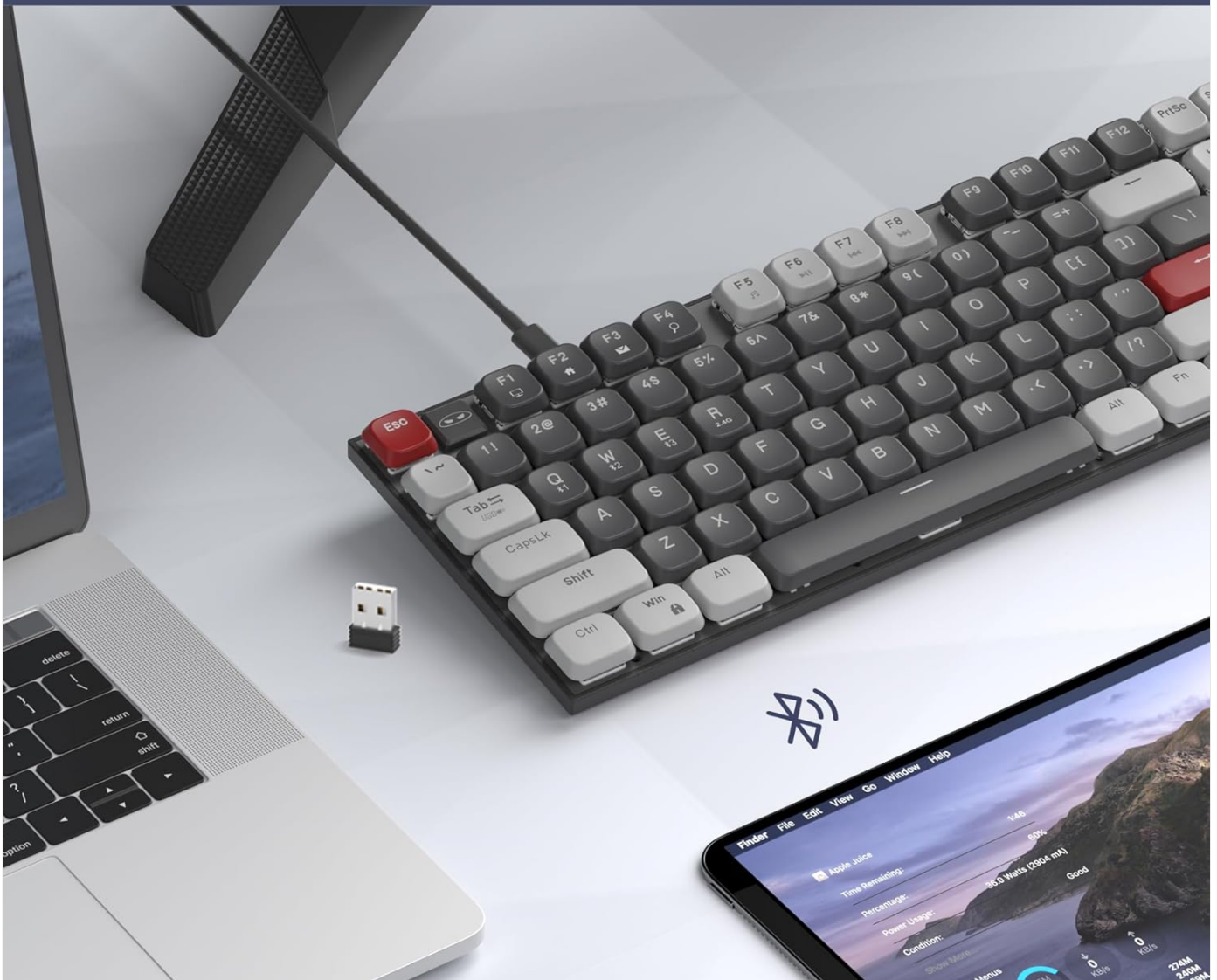
Image: The MageGee Moon104 keyboard shown with a 2.4GHz USB receiver plugged into a laptop, illustrating its wireless connectivity options.