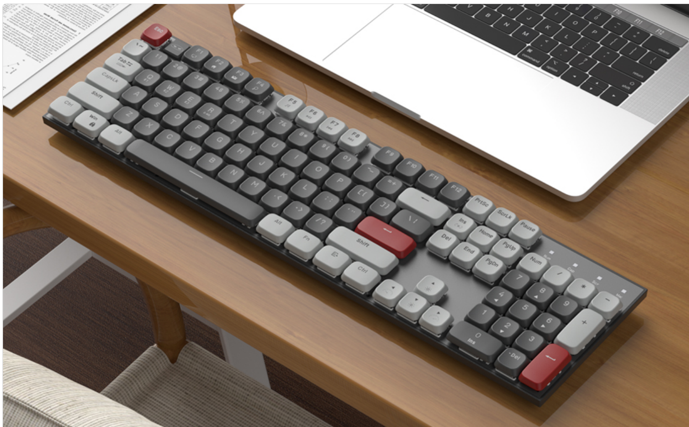
Image: A visual representation of the N-key rollover feature, showing multiple keys being pressed simultaneously and registered.