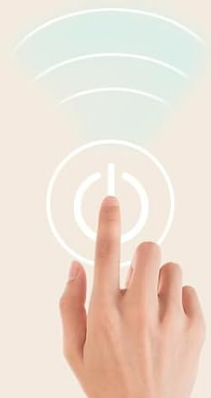
Image: Three light color modes for the LED mirror: Warm, Natural, and Cold Light with brightness adjustment.

Long press the switch to adjust different brightness modes