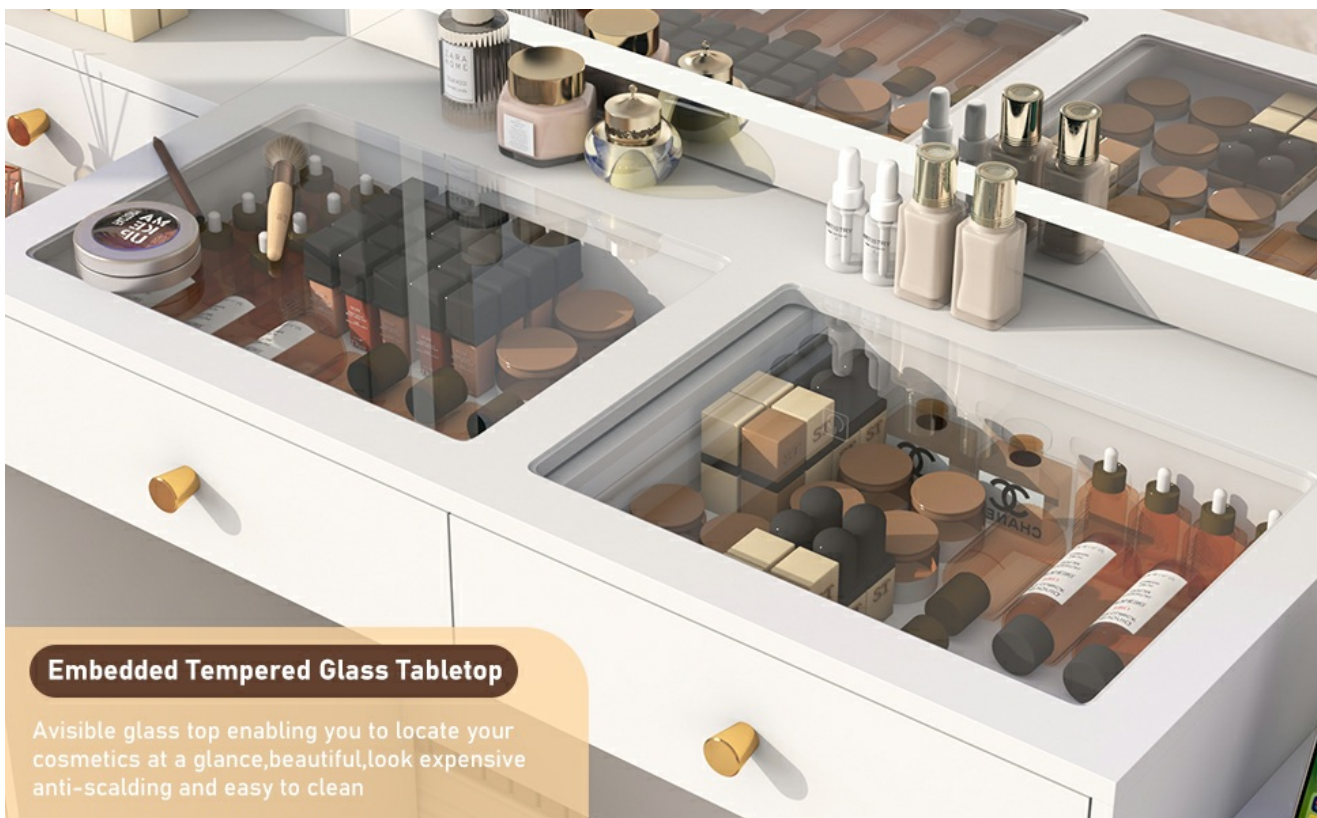
Image: Embedded tempered glass tabletop showing organized cosmetics.