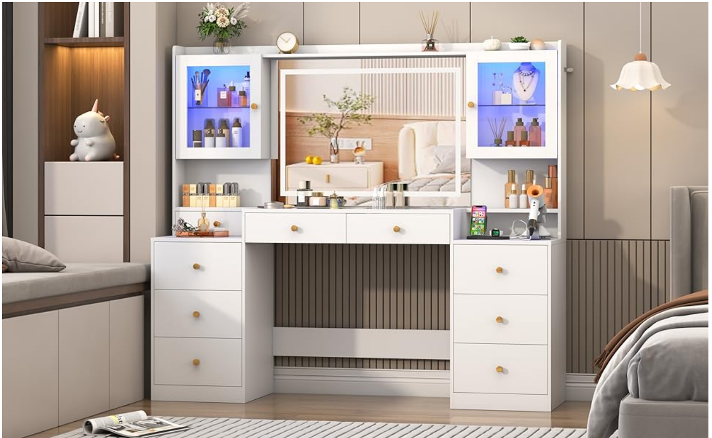
Image: LED Ambient Lighting with music sync and app control features.