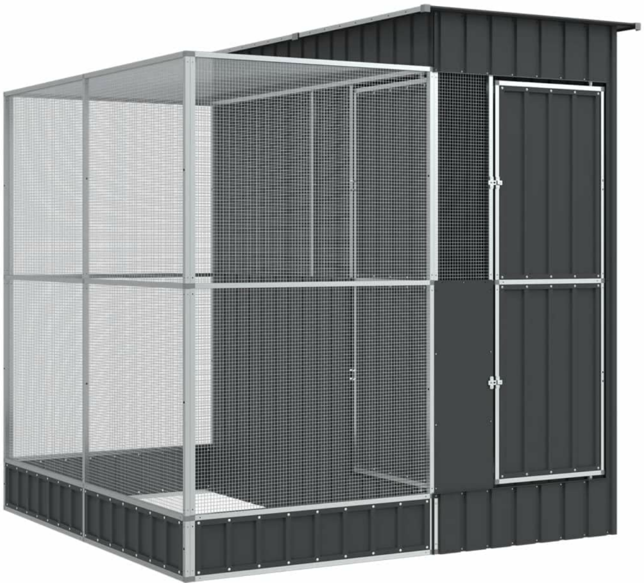
Figure 2: Fully assembled aviary with its extension, situated in a garden, showcasing its design and size.