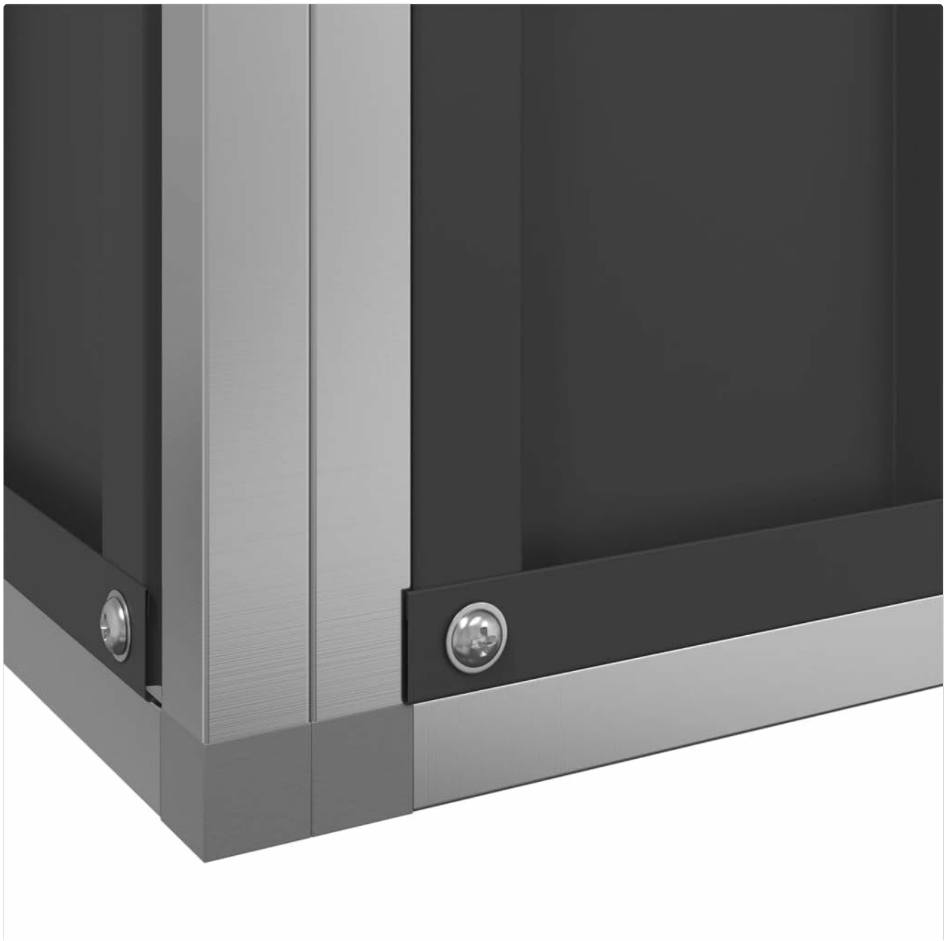
Figure 4: Close-up view of the aviary's base and corner, highlighting the construction and material.