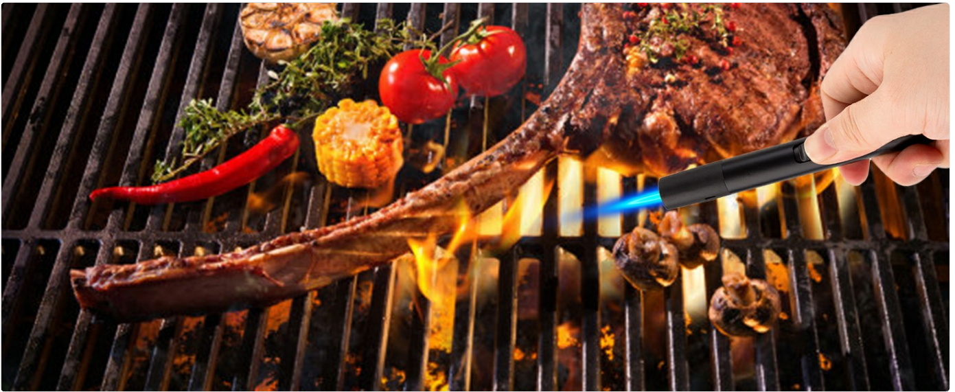
Figure 3: Visible fuel window for easy monitoring of butane levels.