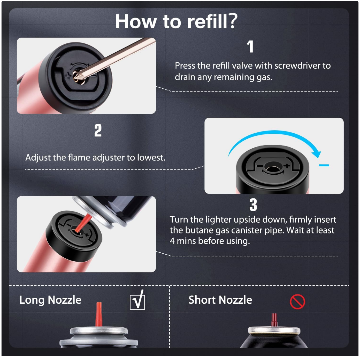
Figure 2: Step-by-step guide for refilling the torch lighter with butane fuel.

The visible fuel window (Figure 1, part 3) allows you to monitor the butane level, making it easy to know when a refill is needed.