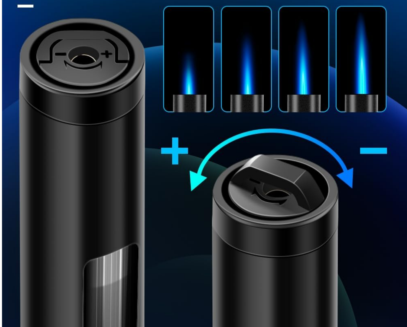
Figure 4: Adjusting the flame height for various applications.

Easily turn the flame adjuster to adjust the flame to your needs