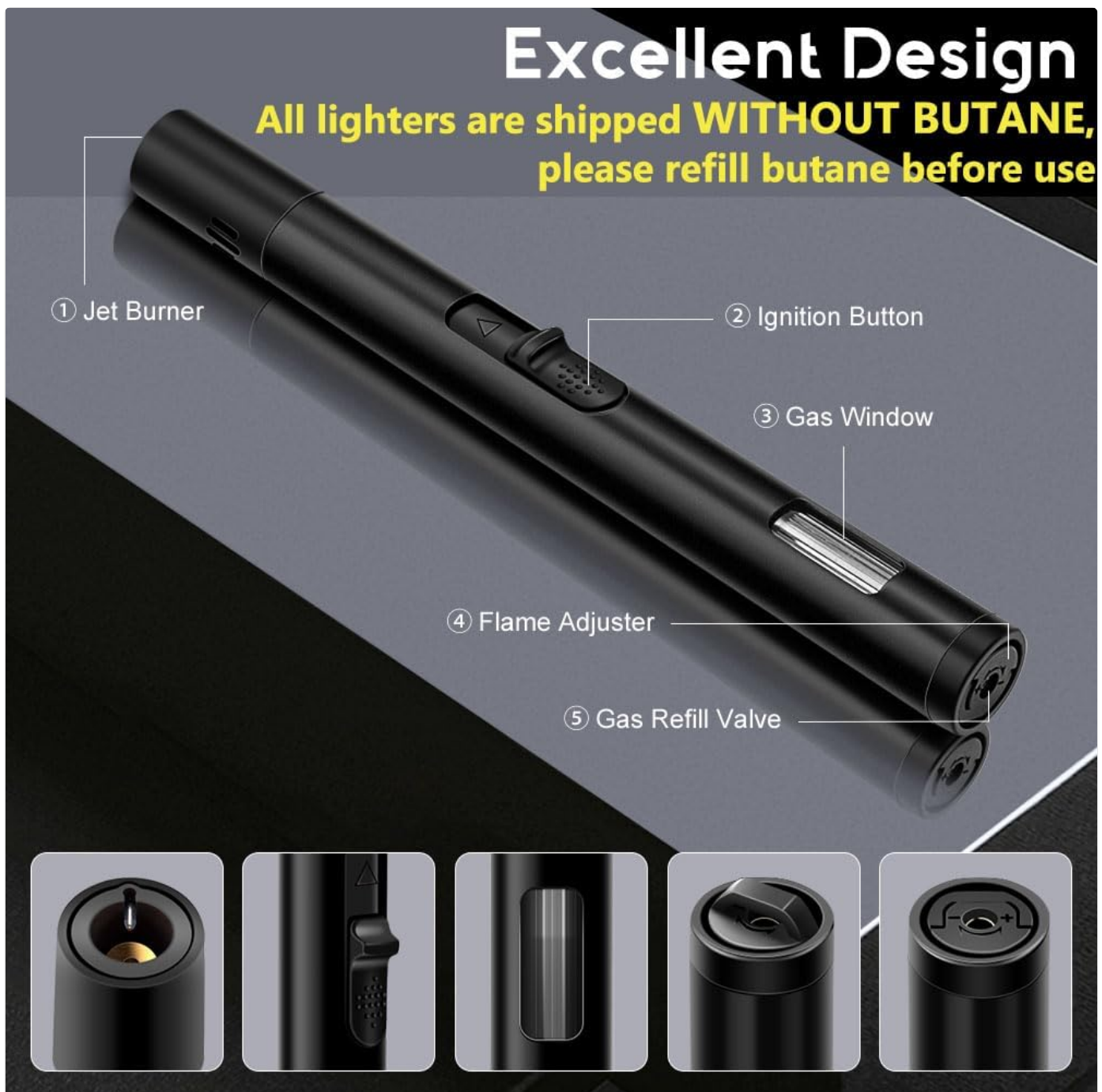
Figure 1: LcFun Torch Lighter components. (1) Jet Burner, (2) Ignition Button, (3) Gas Window, (4) Flame Adjuster, (5) Gas Refill Valve.

All lighters are shipped WITHOUT BUTANE , please refill butane before use