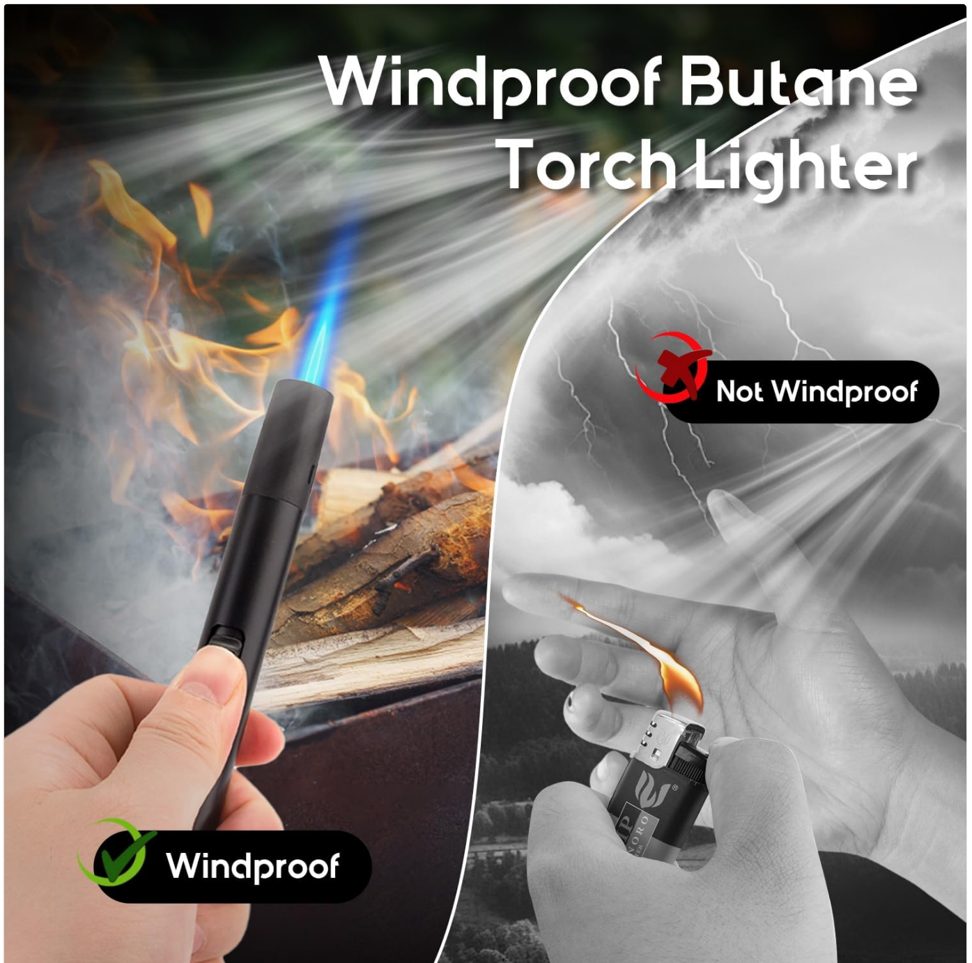
Figure 5: The windproof design ensures reliable ignition outdoors.