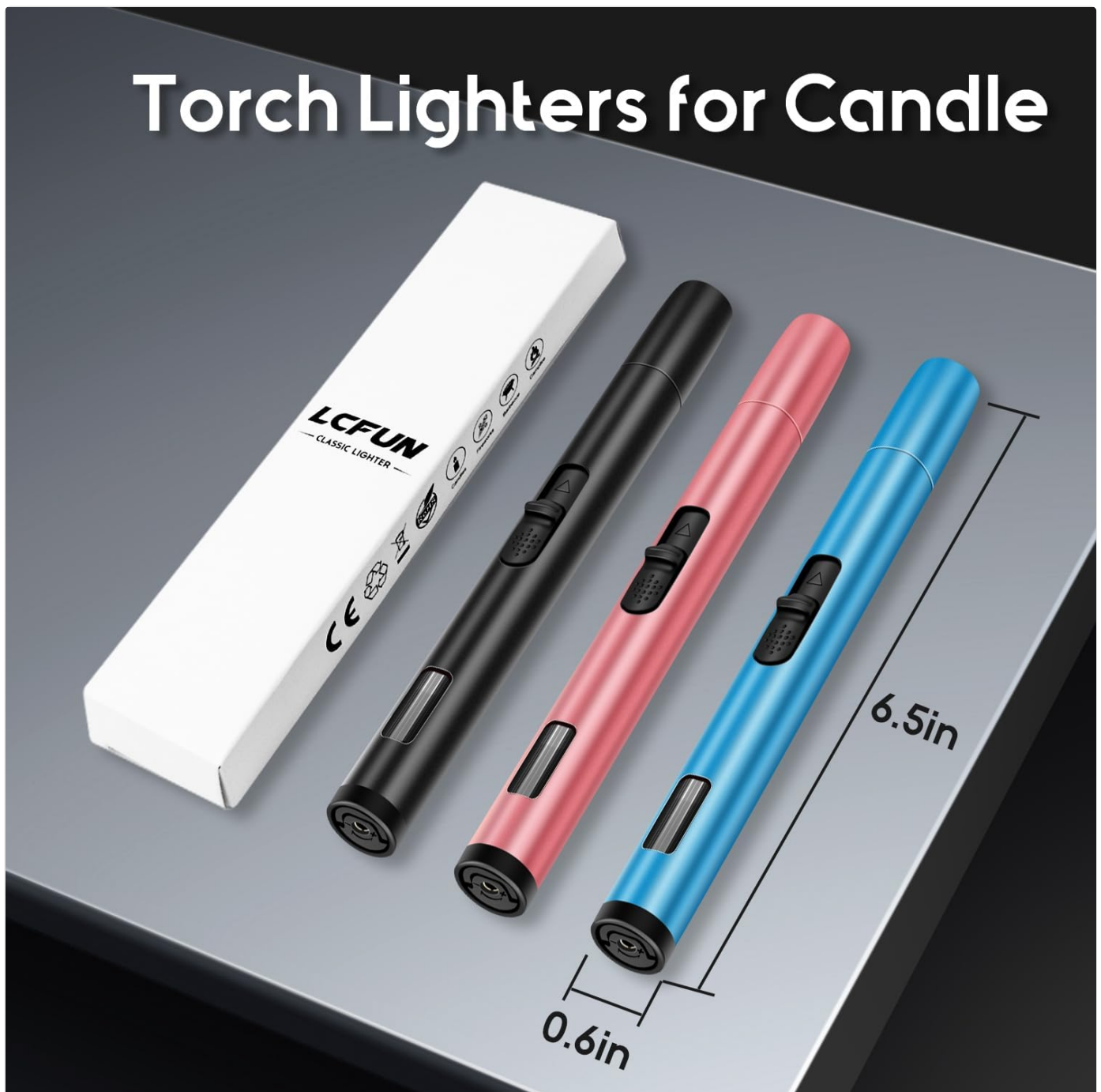
Figure 8: Lighter dimensions for reference.