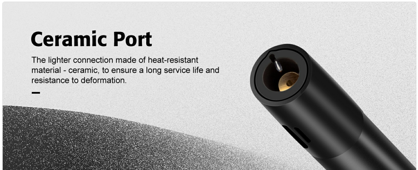
Figure 7: The durable ceramic port ensures consistent performance.

The lighter features a ceramic port, a heat-resistant material designed for durability and long service life. Keep this area clean and free from obstruction.