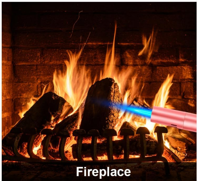
Figure 6: Multipurpose use of the LcFun Torch Lighter.