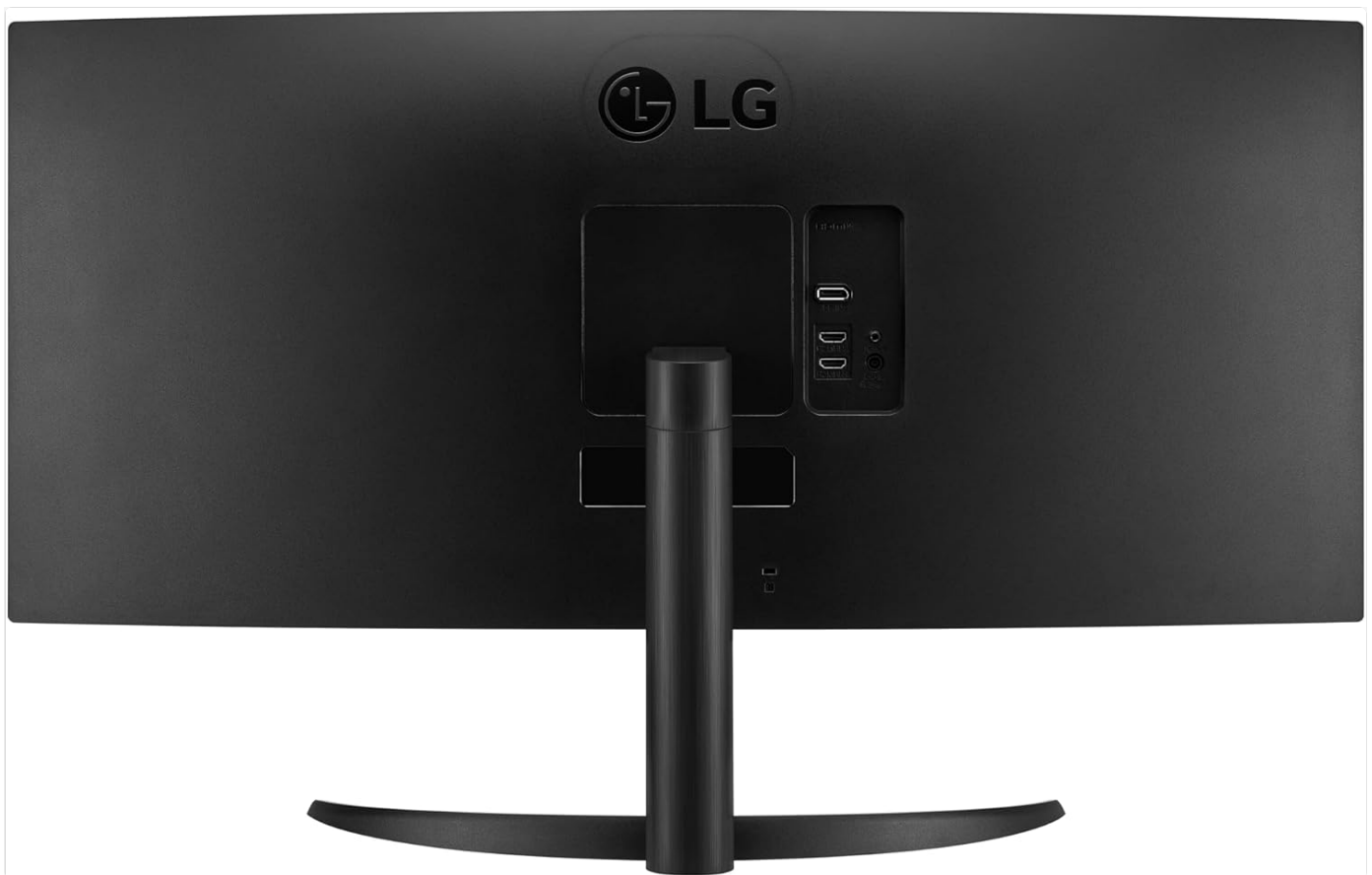
Figure 2.3.2: Full back view of the monitor.