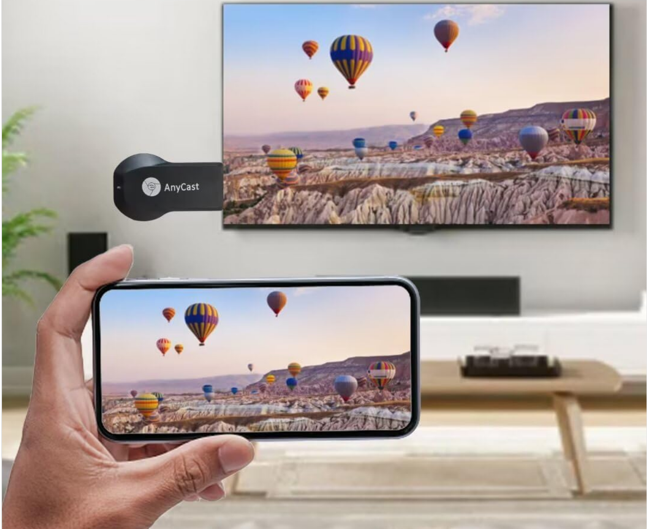
Figure 5: Enjoying a large screen experience by mirroring content from a smartphone to a TV using the wireless display dongle.

Watch movies, play games, create your own exclusive cinema. Allows you to enjoy the different audio-visual.