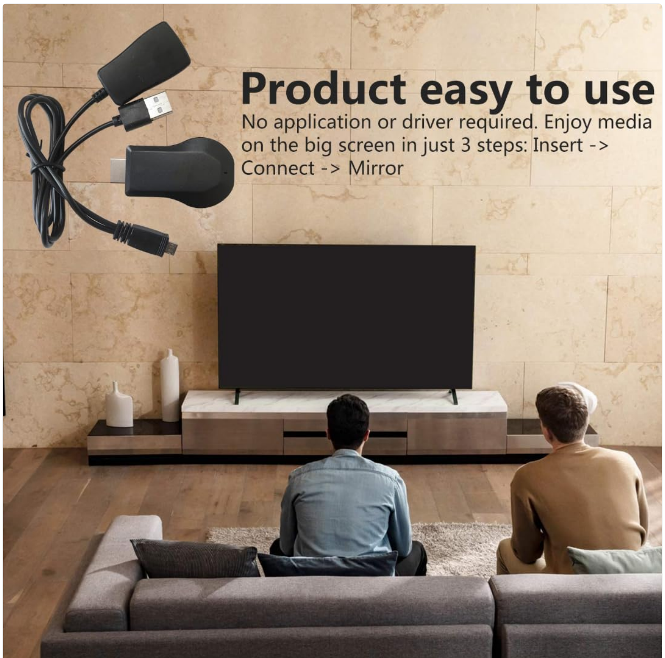
Figure 4: The dongle enables easy screen mirroring, allowing users to enjoy media on a large screen in three simple steps: Insert, Connect, and Mirror.