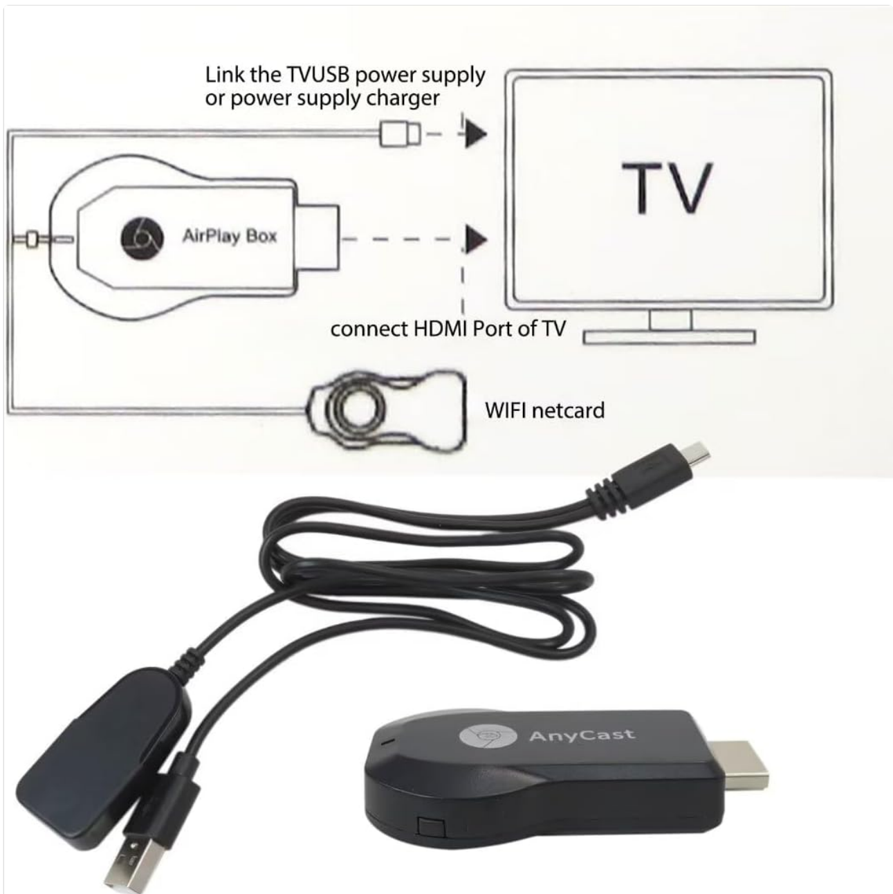
Figure 2: Power and HDMI connection diagram. Ensure the dongle is properly powered for stable operation.