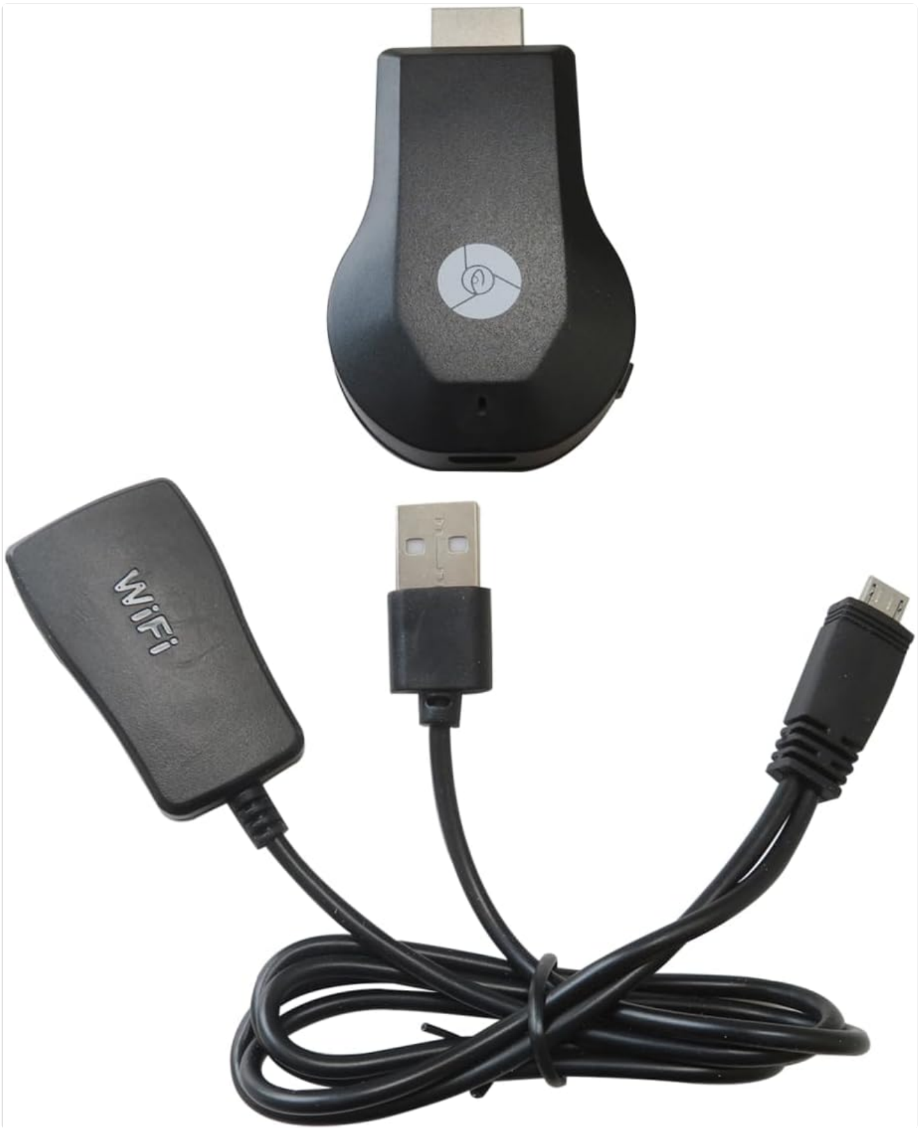
Figure 1: The LINGSEE 4K WiFi HDMI Wireless Display Dongle Adapter, showing the main dongle unit and its accompanying USB power cable with WiFi antenna.