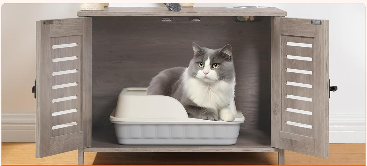
Litter Enclosure: Private space with minimal mess and odor.