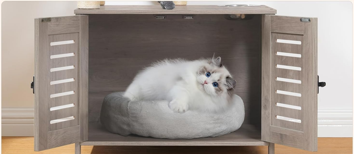
Cat House: Gives your cat a warm and safe spot for naps.