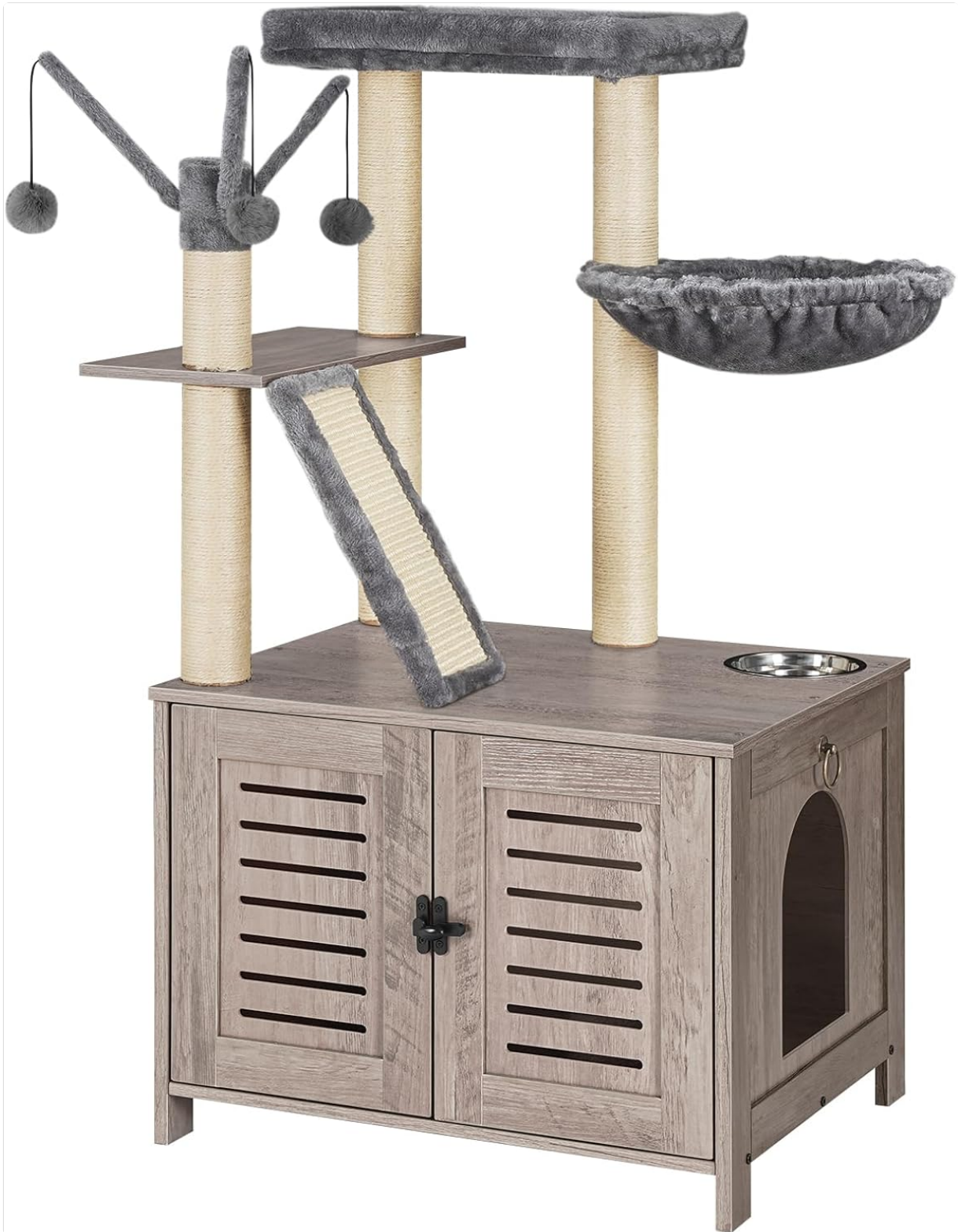
Image 1.1: Overview of the HOOBRO BG48MZ03 Cat Tree with Litter Box Enclosure.