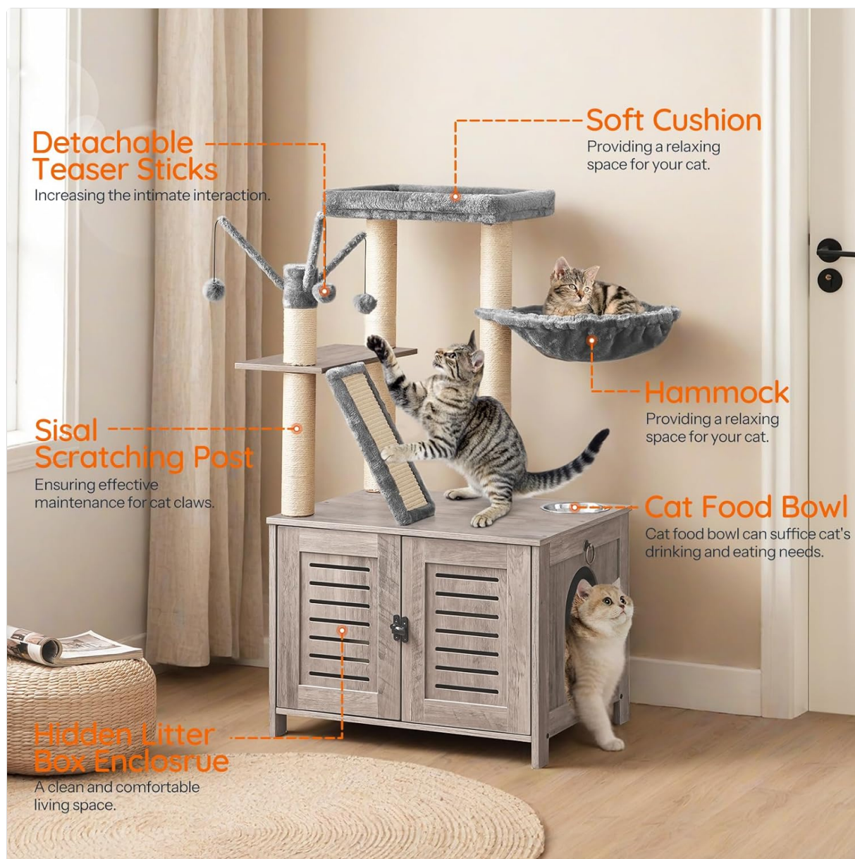
Image 3.1: Diagram illustrating the main components and features of the cat tree.

Please verify that all components listed below are included in your package. If any parts are missing or damaged, please contact customer support.