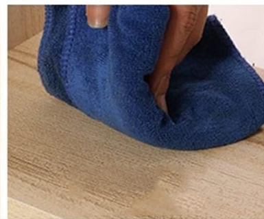
easy to clean

Image: The high-quality board material is designed to be waterproof, scratch-resistant, and easy to clean, ensuring durability.