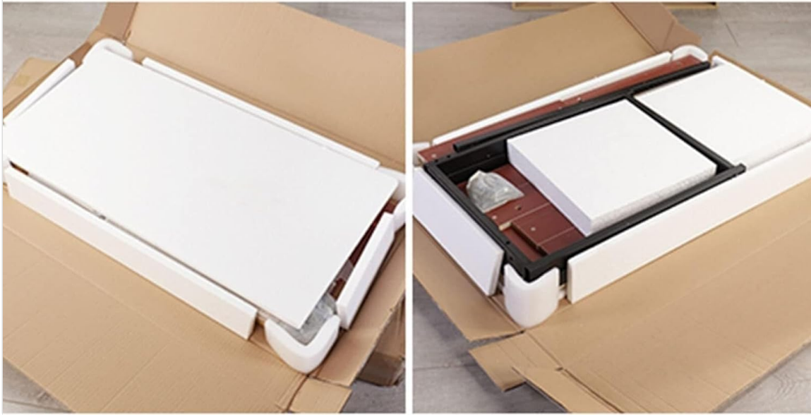
Image: Components are securely packed to prevent damage during transit. Please unpack carefully and verify all parts.