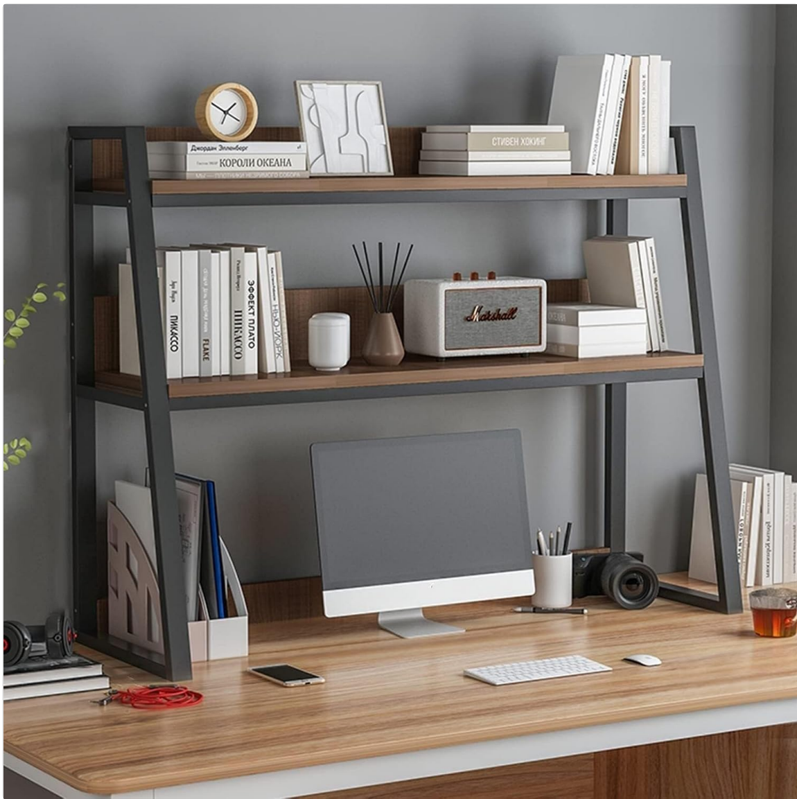
Image: The fully assembled Ktop 2-Tier Office Storage Rack, ready for use.