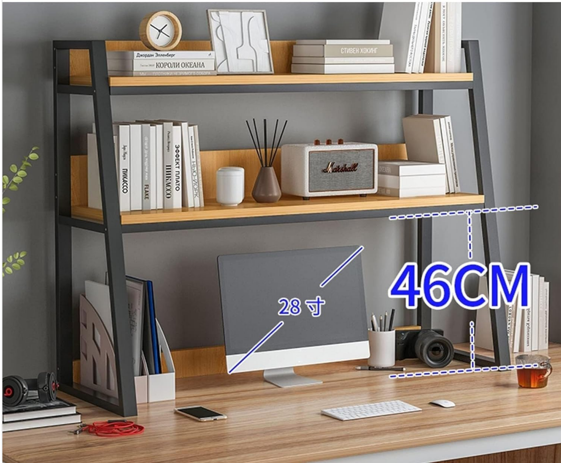
Image: The lower section provides ample space for a monitor, up to 28 inches, with a height clearance of 46cm (18.1 inches).