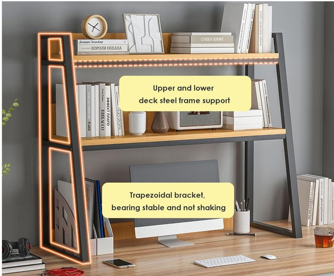
Image: Detail of the robust steel frame construction, designed for stability and even weight distribution.

Bold trapezoidal steel frame, the overall force is even and does not shake