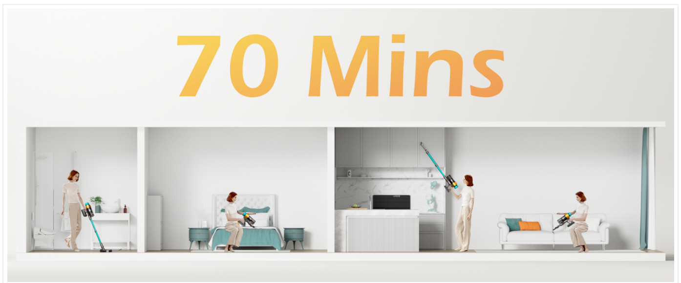
Image: A visual representation of the vacuum's versatility, showing the crevice tool for tight spaces, the 2-in-1 brush for surfaces, and the extension tube for high-reach cleaning.