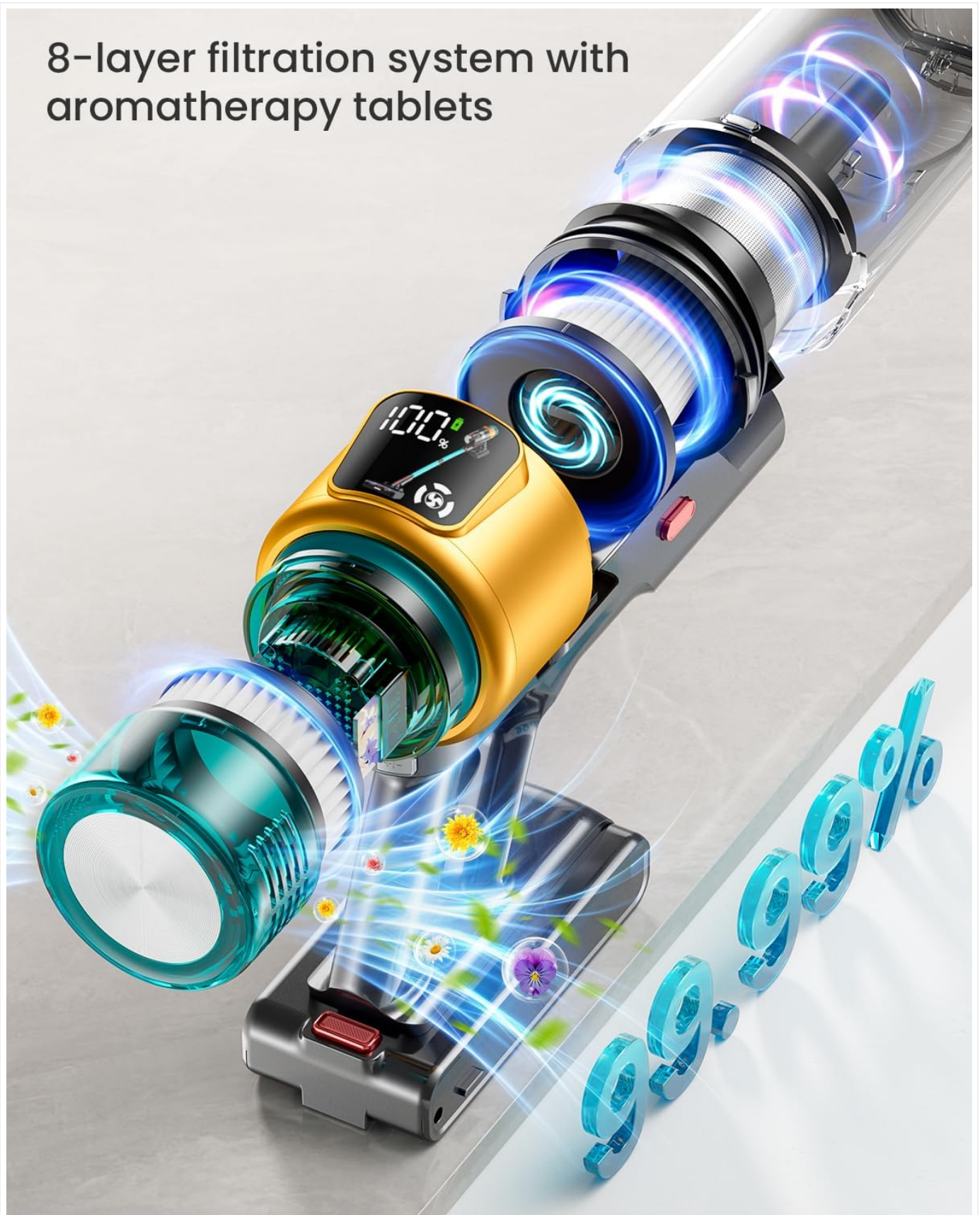
Image: An exploded view diagram illustrating the vacuum cleaner's 8-layer filtration system, including the HEPA filter and the integrated aromatherapy tablet feature, designed to capture fine dust and release a pleasant scent.