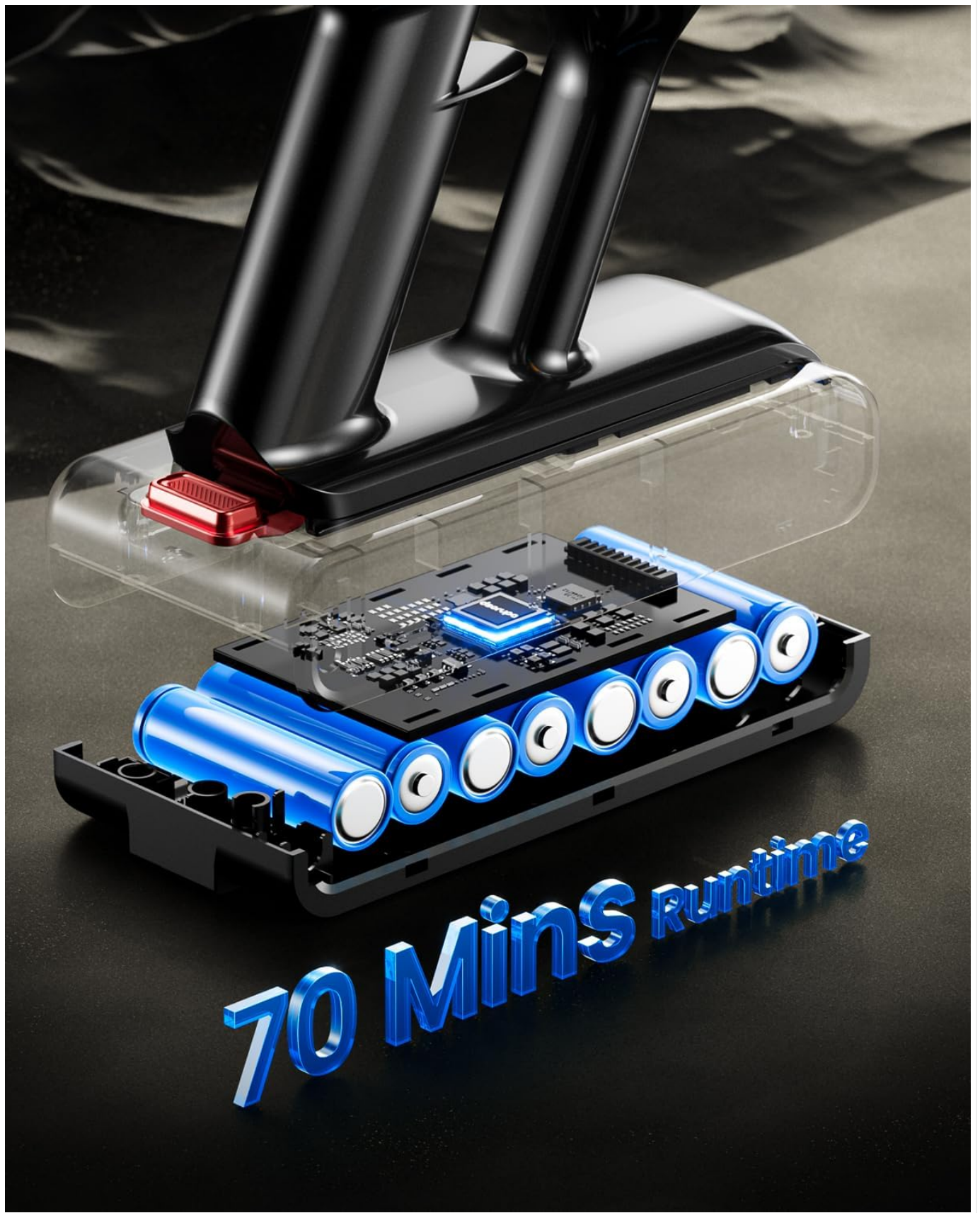
Image: A detailed view of the vacuum's removable battery pack, highlighting its internal components and the '70 Mins Runtime' capability.