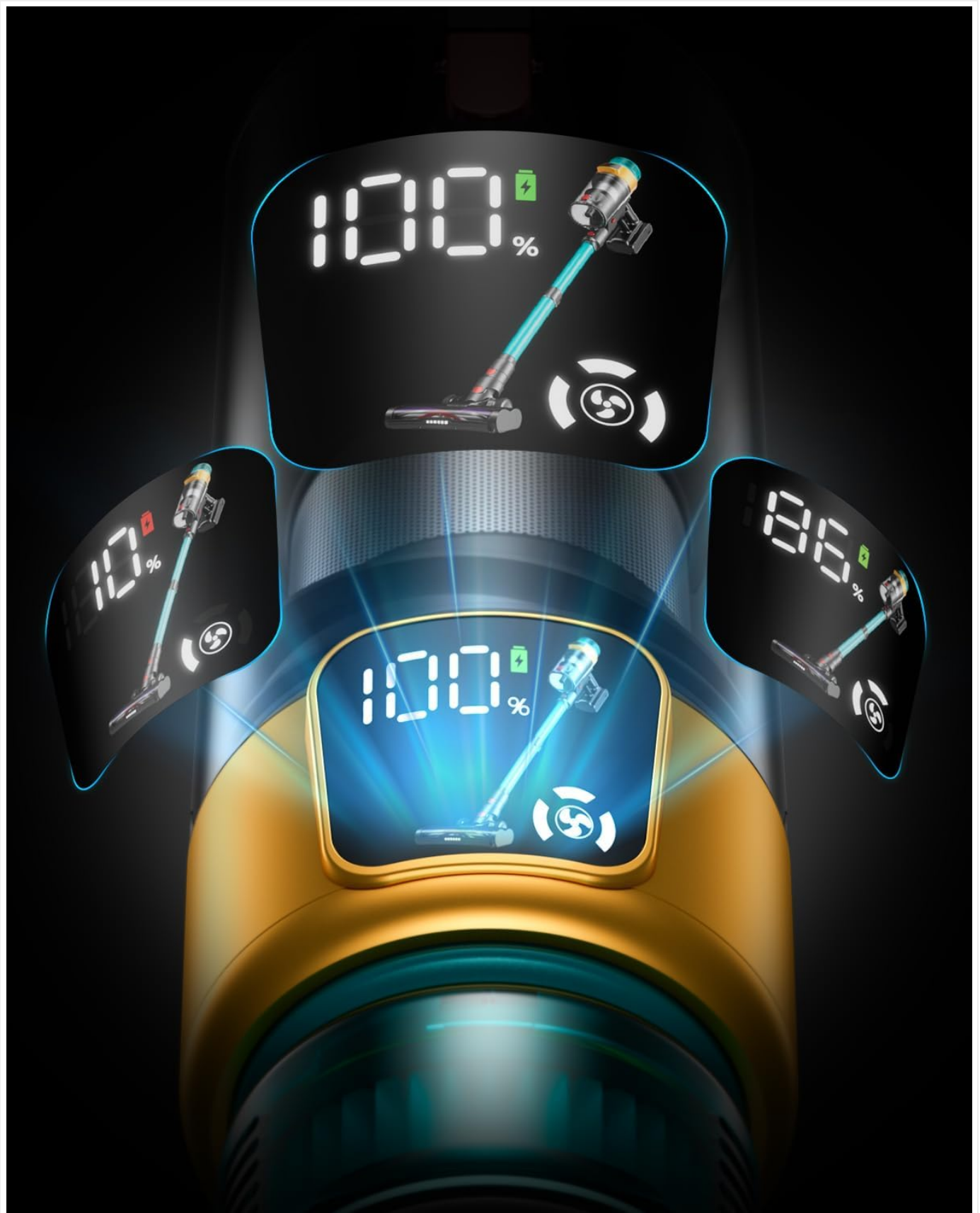
Image: A close-up of the vacuum cleaner's digital LED display, illustrating how it shows battery percentage and current suction mode, with examples of different battery levels.