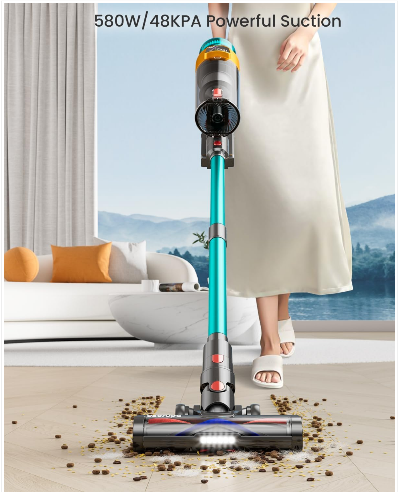
Image: A person is shown operating the dsorupa V10 Ultra cordless vacuum cleaner on a hard floor, demonstrating its powerful 580W/48KPA suction capability to clean scattered debris.