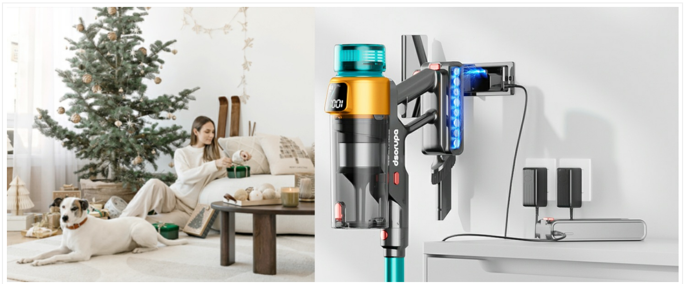
Image: The dsorupa V10 Ultra vacuum cleaner is shown mounted on its wall-mounted charging dock, connected to a power outlet, indicating convenient storage and charging.