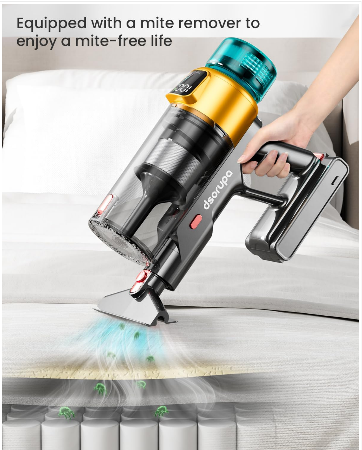
Image: The vacuum cleaner is depicted with its specialized mite remover attachment, actively cleaning a mattress surface to eliminate dust mites, promoting a mite-free environment.

Equipped with a mite remover to enjoy a mite-free life