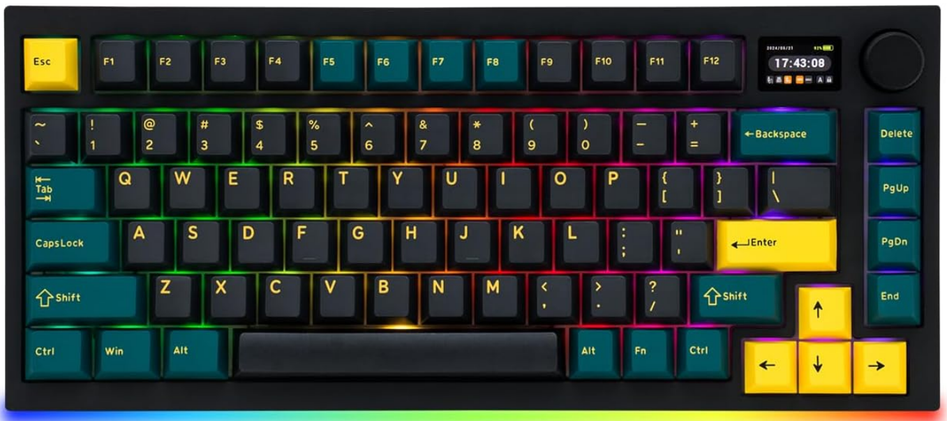
Image: Top-down view of the MD750 keyboard showcasing its vibrant and customizable RGB backlighting across all keys, highlighting its aesthetic capabilities.