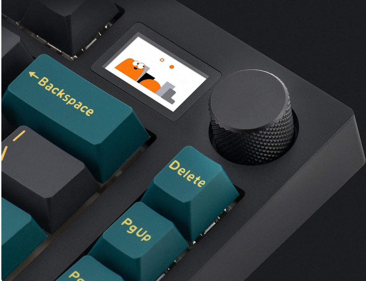
Image: Detailed view of the MD750 keyboard's 1.2-inch LED screen and the rotary control knob, highlighting the intuitive user interface for quick adjustments.

Featuring a 1.2" LED screen and an intuitive knob, easily adjust RGB lighting effects, colors, speed, brightness, volume and switch between systems.