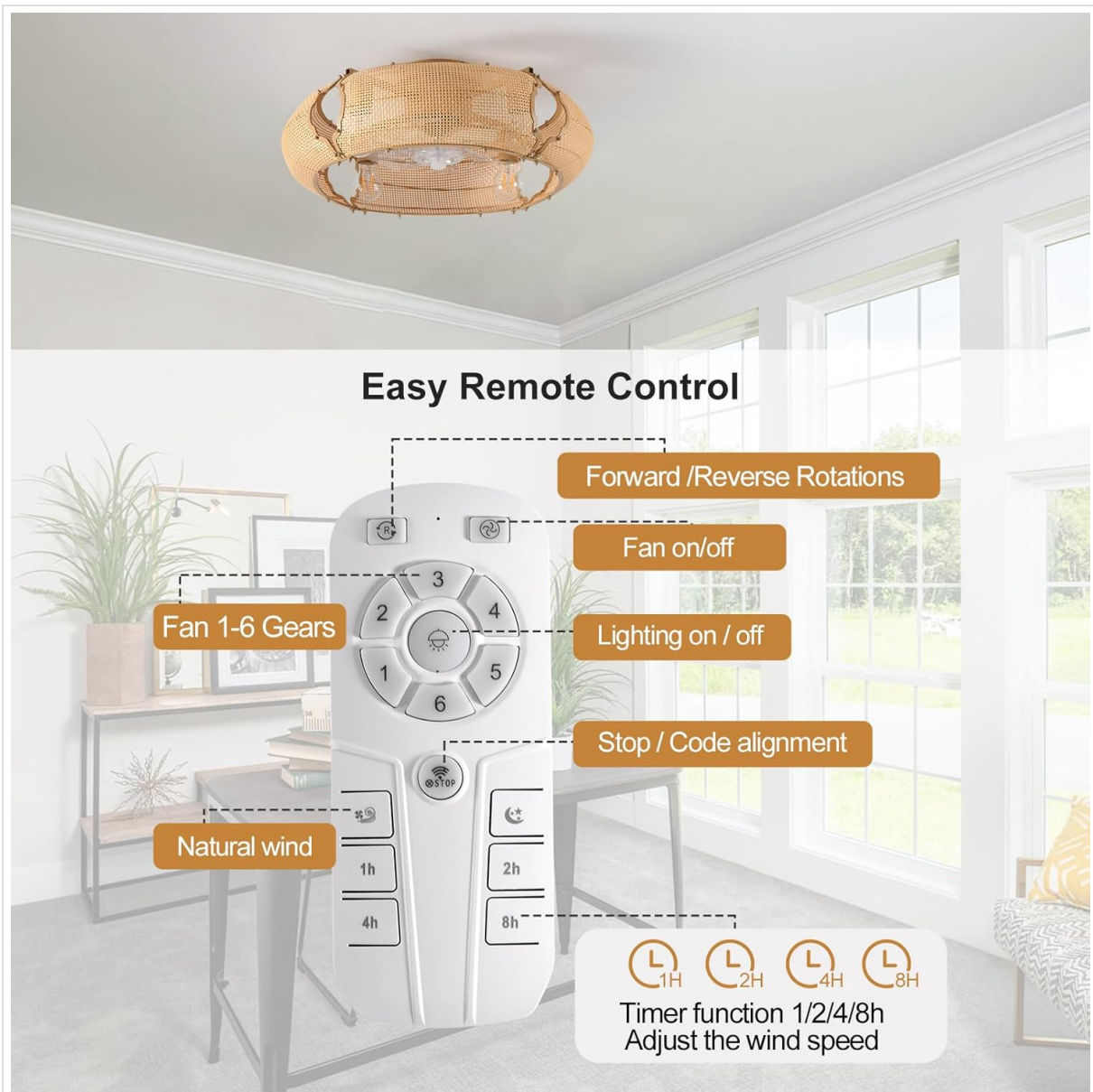
Image: A detailed view of the remote control, highlighting buttons for fan on/off, light on/off, 6 wind speeds, forward/reverse rotations, natural wind mode, and timer functions (1H, 2H, 4H, 8H).