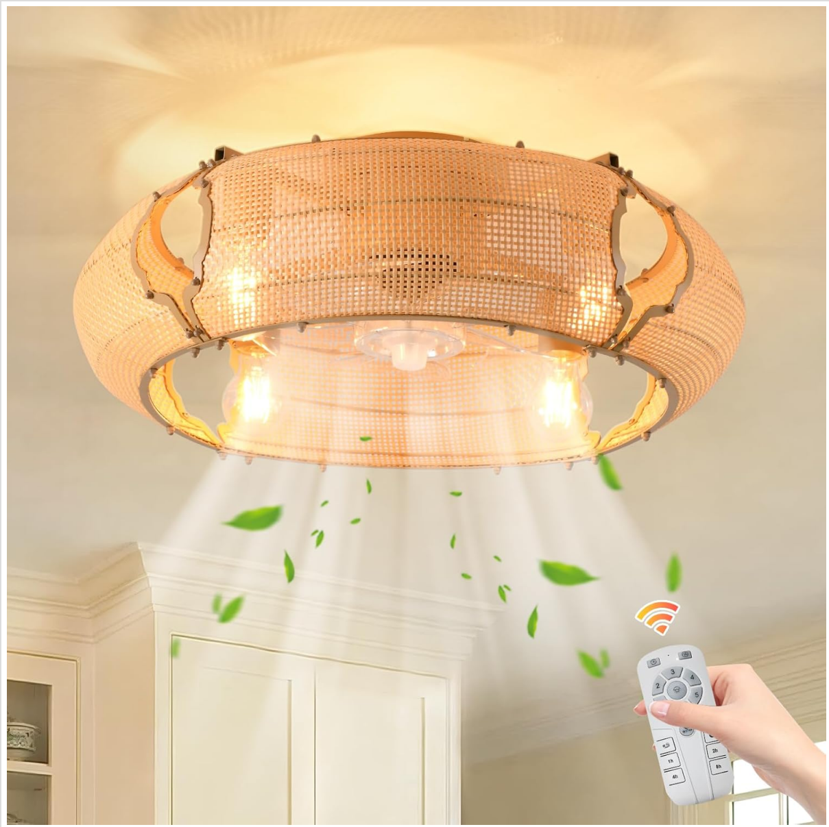
Image: The Ganeed 20.86-inch Boho Caged Ceiling Fan, showcasing its rattan cage design and integrated lighting, with a remote control in the foreground.