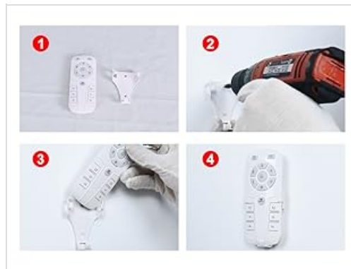
Image: A four-panel image showing the steps to install the remote control holder on a wall, including drilling and securing the holder.