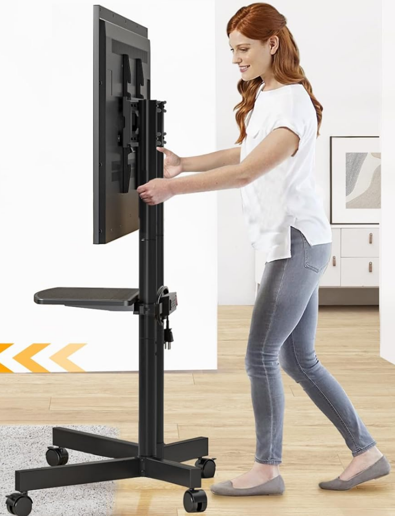
Image: The TV stand features 360° silent lockable wheels, designed for smooth movement on all floor types.

Your browser does not support the video tag.