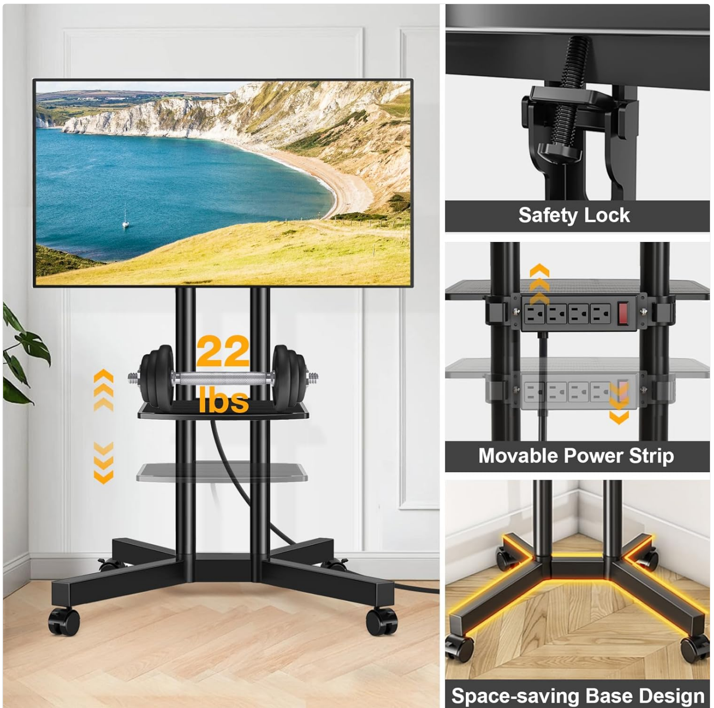
Image: Details of the safety lock, movable power strip, and the stable X-base design.