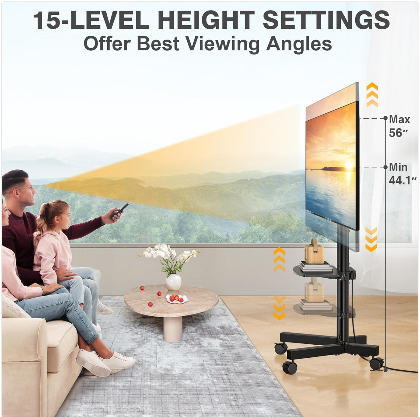
Image: Illustration of the 15-level height adjustment feature, allowing optimal viewing angles from 44.1 to 56 inches.