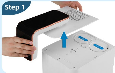
Remove tank cover, tank and top cover

Safety first: Turn off the power, unplug the unit, empty the water tank