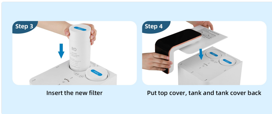
Image: Quick Steps to Replace Your Filter (Steps 1-4). This image illustrates the initial stages of filter replacement, showing the removal of the tank cover, tank, and top cover, followed by the removal of the expired filter, insertion of the new filter, and reassembly of the covers.