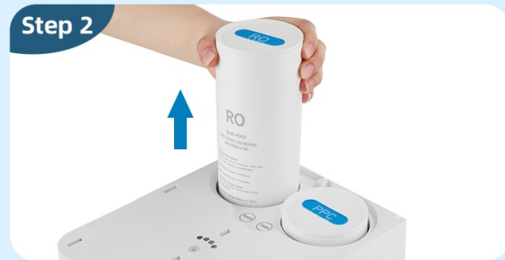
Remove the expired filter

Image: 5-Stage Filtration Process. This diagram illustrates the layered filtration stages, including PP, CTO, RO, PCF, and Mineral Filter, detailing what each stage removes or adds to the water.