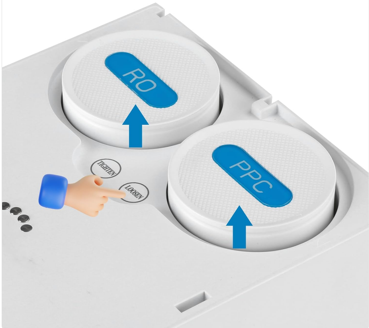
Image: True One-Touch Replacement. This image highlights the user-friendly design of the filter system, allowing for easy, tool-free filter replacement with a simple twist and pull motion.