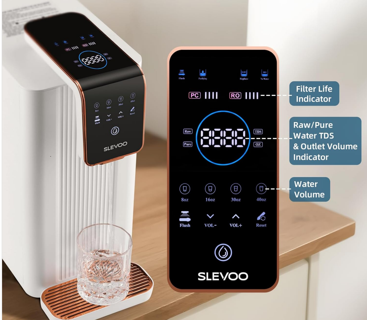
Image: Real-time TDS Monitor and Filter Life Indicator. This image displays the control panel of the Slevoo RO-100R system, showing the digital display for TDS levels, filter life indicators for both PPC and RO filters, and water volume selection options.

Real-time TDS Monitor, Know Exactly What You Drink