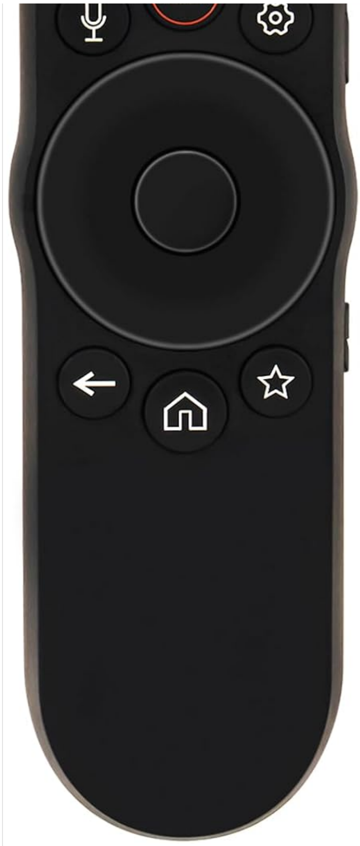
Image 1: Front view of the ECONTROLLY XRT270 Voice Remote Control, showing all buttons including power, input, streaming service shortcuts, microphone, settings, navigation pad, back, home, and star buttons.